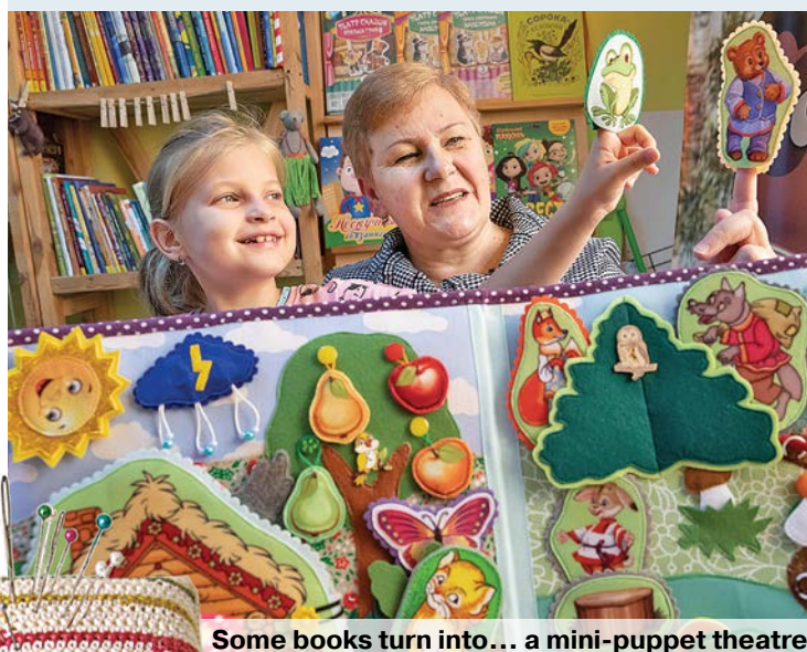
Some books turn into... a mini-puppet theatre

Bunny, Fox, Wolf, Bear... The whole family can put the sewn dolls on their fingers and play, letting their imagination run away with the stories. Undoubtedly, such games played together, bring children closer to their parents," the master says.