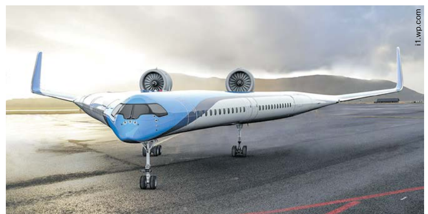
Materials prepared with aid of information agencies

There is still work to be done to refine the aircraft before it could take to the skies with passengers aboard: researchers said that the test flight showed that the aircraft's current design allows for too much 'Dutch roll', which causes a rough landing.