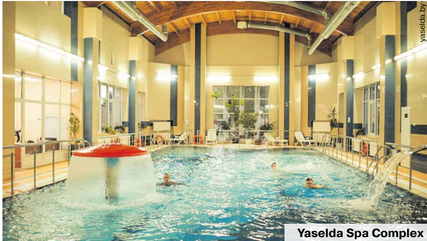
Yaselda Spa Complex

The trend of the season in blue-eyed Belarus' health resorts is rehabilitation after COVID-19. Is it truly effective? How much is it in demand among Belarusians and Russians?