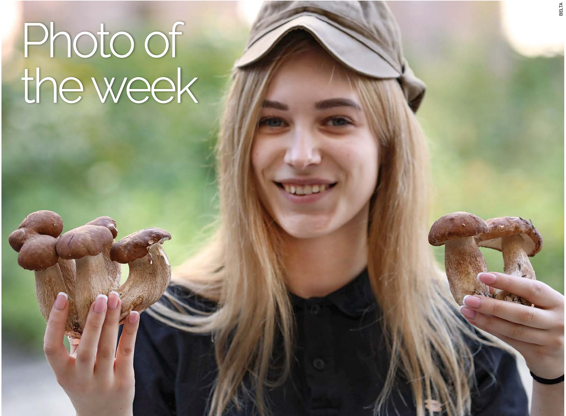
Mushroom season in the Gomel Region