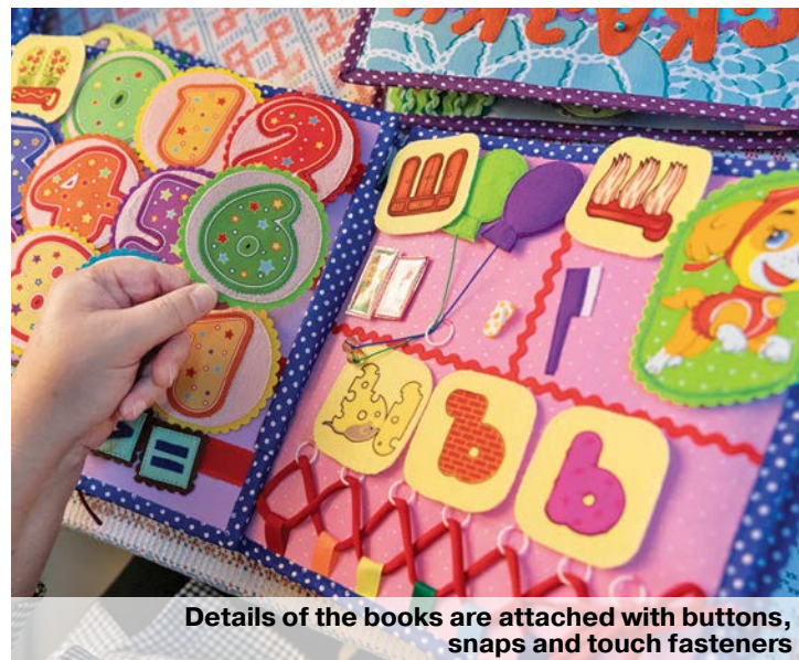
Details of the books are attached with buttons, snaps and touch fasteners

"In Kolobok (Roly-Poly) , for example, there are many characters: