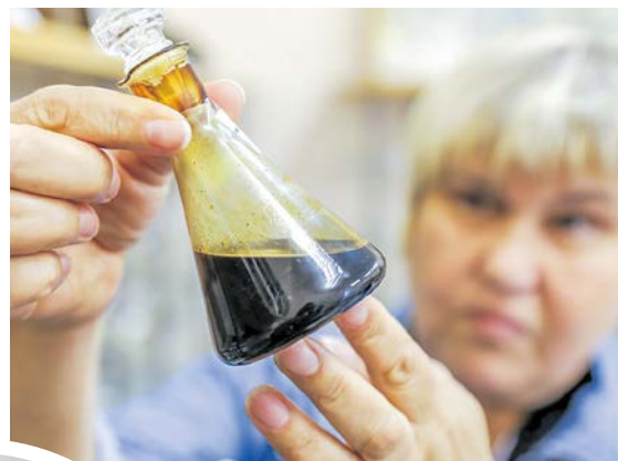
Oil from the Yuzhno-Shatilkovsky deposit

for uranium and rare earth elements — such as, for example, lanthanum, cerium or europium — was seen. Nobody knows what will happen tomorrow. Maybe it will be basalt that will enjoy demand. Deposits of this igneous rock were discovered in 2016 in the Pinsk District, near the village of Novy Dvor. Laboratory tests have now been conducted, while reserves and forecast resources have been calculated. A project has been drawn up for preliminary exploration of this field. To understand whether it is appropriate to work on it, the technology needs to be further studied as well as a feasibility study for each type of work that involves creating a quarry (so far, to a depth of 100 metres). Experts say that this raw material can be used, for example, for the production of