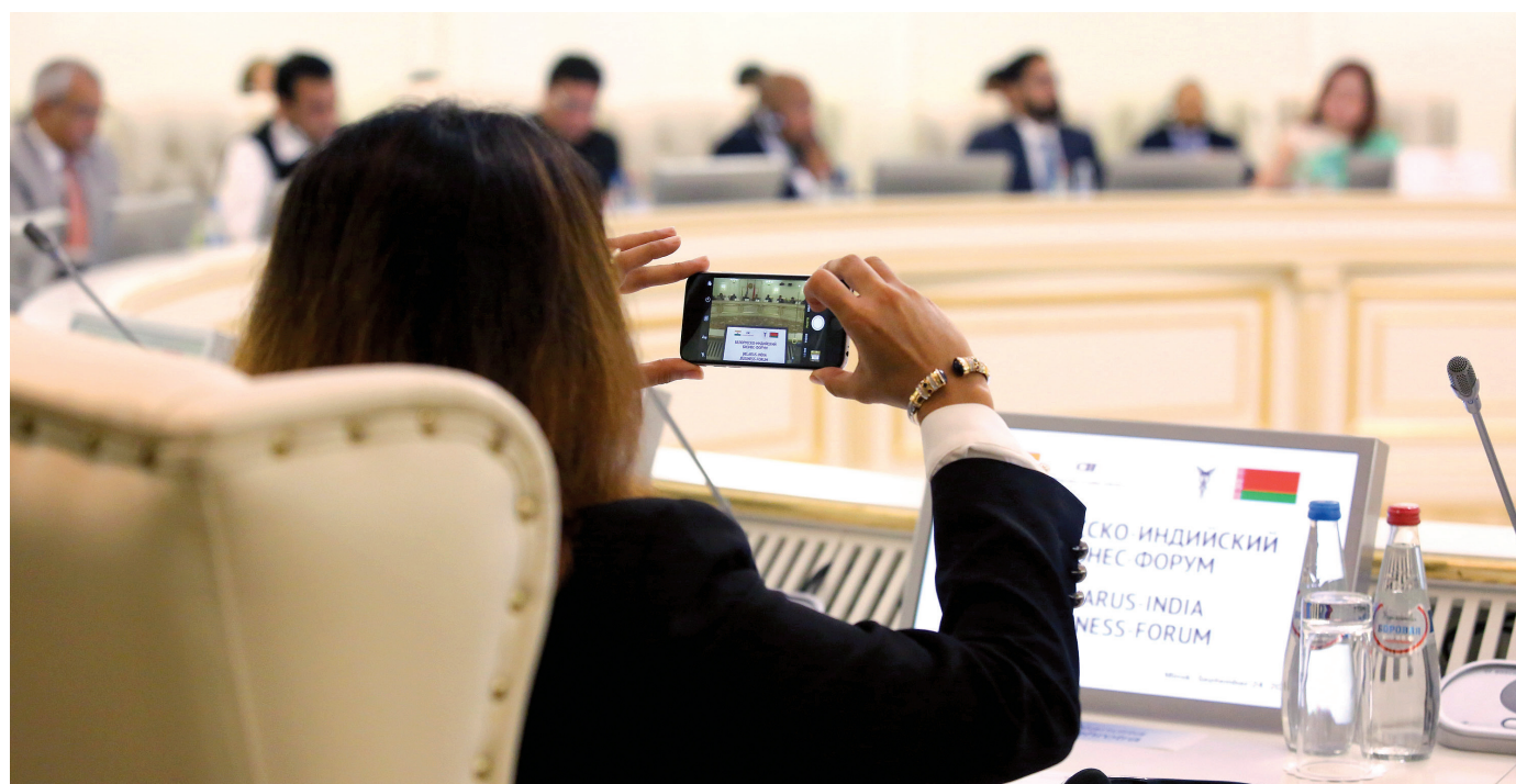
At the Belarusian-Indian Business Forum