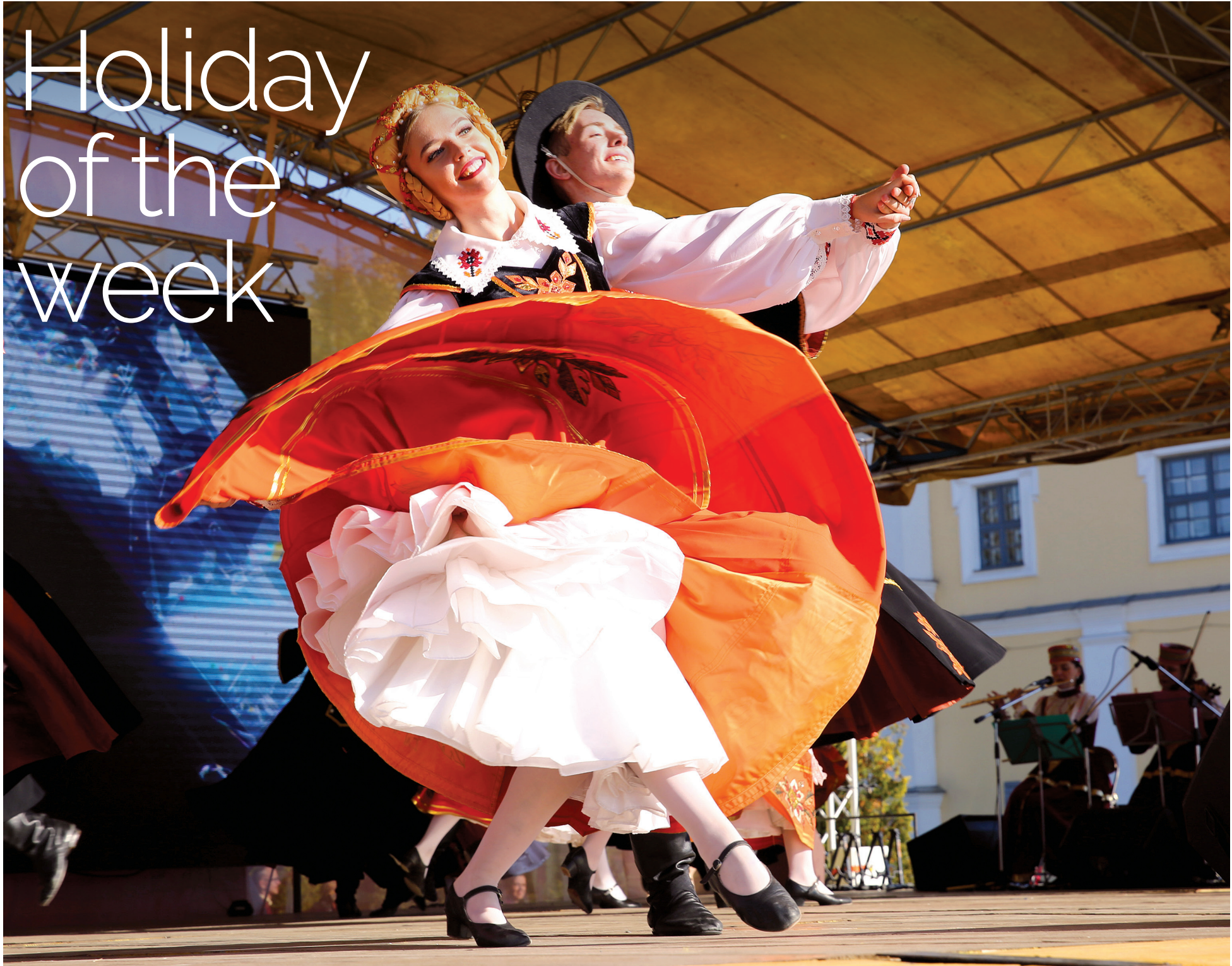
On October 6th-7th, Pinsk brightly and colourfully celebrated its 921st birthday