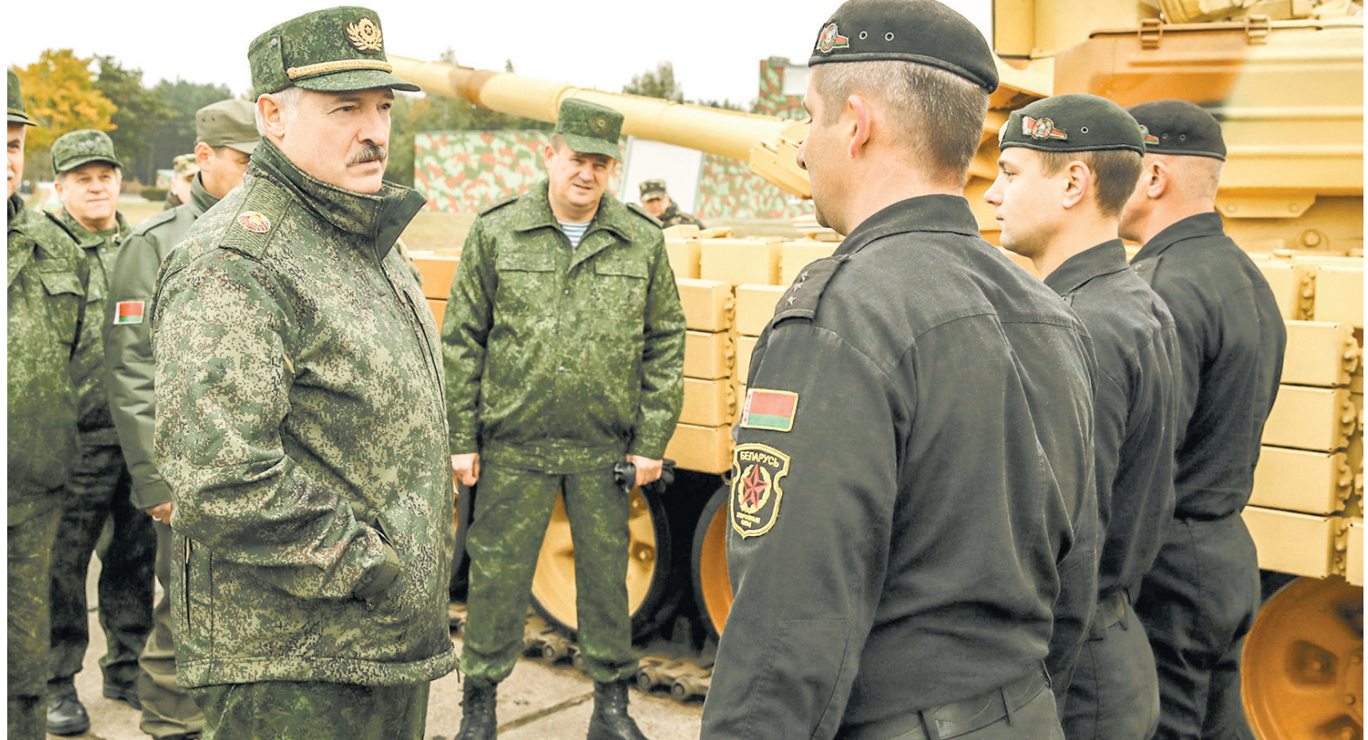
President of Belarus familiarises with modern models of weapons for the army

For the first time, the T-72 tank improved by Belarusians was shown. It is comparable in performance with one of its newest brothers, the T-90. The ‘Cayman’ fighting machine is swift in a sud-