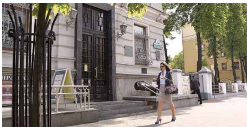
Near the entrance to the Historical Museum of Belarus

It remains to add that the exhibition features items from the collections of the National Historical Museum of Belarus, the Museum of Criminalistics at the Interior Ministry’s Academy, the Museum of the Centre for Cultural and Educational Work of Belarus’ Interior Ministry, the History Department’s Museum of the Belarusian State University