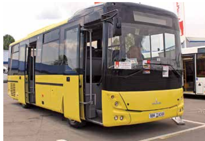
MAZ buses for Vologda Region