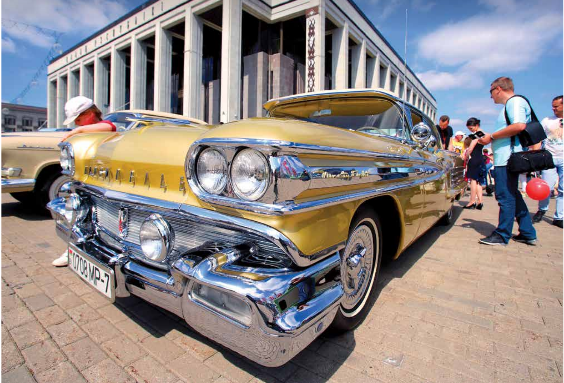
Festival of retro cars — Oldtimer Rally — held in Minsk