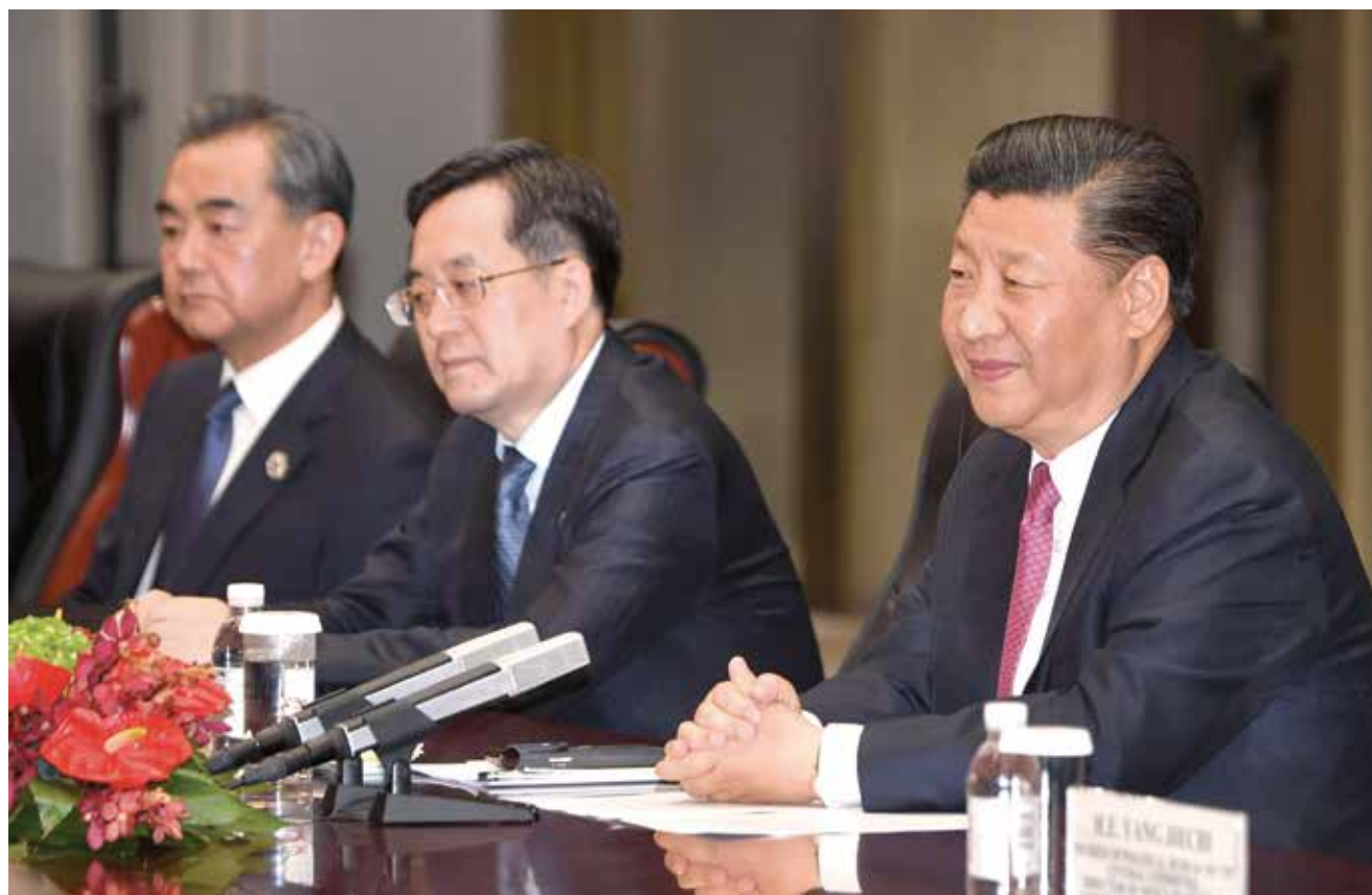
During the negotiations with Chinese President, Xi Jinping

Belarus will be strong if China is strong, noted the President of Belarus, Alexander Lukashenko, during his negotiations with the President of China, Xi Jinping, on the sidelines of the Shanghai Cooperation Organisation Summit, held in Qingdao