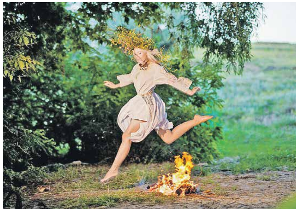
Jumping over the purifying fires of Kupalie night is a long-lasting tradition

Opera and ballet in the open air will be shown. This fabulous event is being organised for the sixth time by the Belarusian