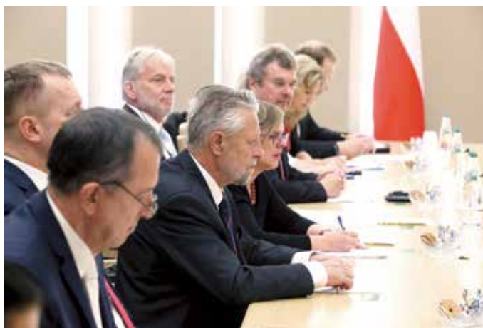
Czech parliamentarians at the meeting

At the Eastern Partnership Summit in Brussels in November last year, Belarus' Foreign Minister Vladimir Makei, noted that the conclusion of the framework agreement between Belarus and the EU was an issue for the immediate future. This document defines the principles of cooperation, the institutional framework and creates a solid legal basis for interaction between Belarus and the EU. Moreover, the Czech Republic could more actively use the opportunities of Belarus as a member of the