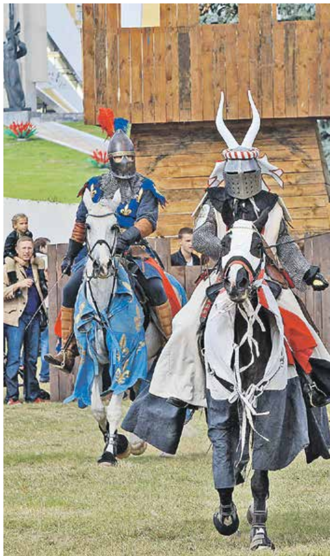
Historical re-enactors reproduce to the smallest detail

Bolshoi Theatre. It was not for nothing that they decided to put the festival in Nesvizh. In the 17th-19th century, the city was one of the largest cultural centres of Europe. Here, the best composers of Italy, Germany and France performed their works. The present Nesvizh Palace and Park Complex is one of the most beautiful and popular places in the Republic. This summer, guests of the former residence of the Radziwill noble family will enjoy classic and modern pieces, the famous La Traviata and the Evening of Romances by the Sergei Rachmaninoff concert orchestra. Performances will be held at three venues. The most interesting is in the courtyard of the Nesvizh Castle, which boasts the best acoustics thanks to the high palace walls and stone floor, so microphones are not needed. The second stage is the theatre hall of the castle and the third is the Church of the Body of Christ. The festival will close with a gala concert of soloists of