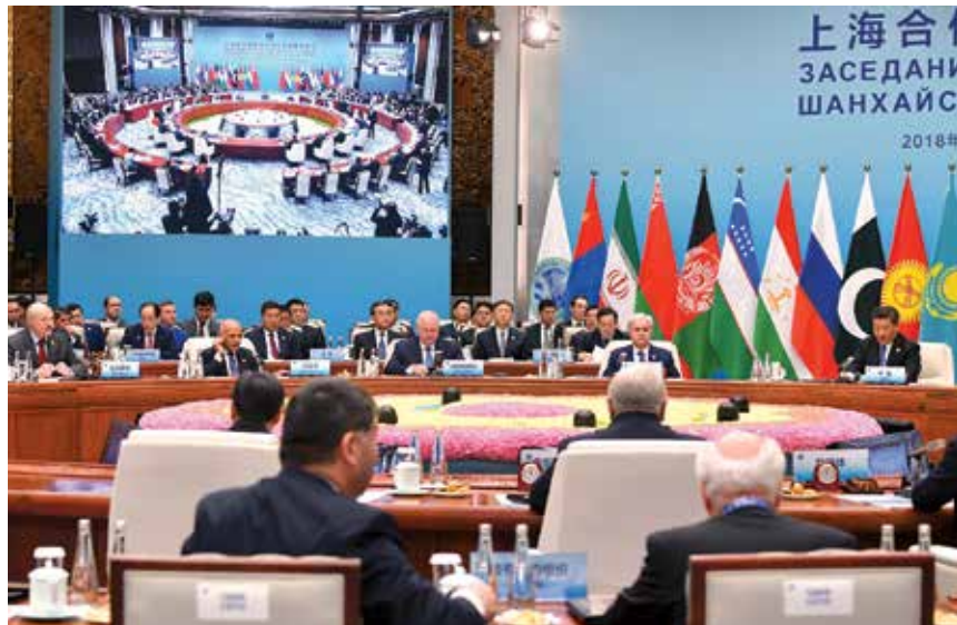
At the SCO Heads of State Council session

The President of Belarus paid attention that the new waves of protectionism in global trade directly or indirectly affect virtually all the countries participating in