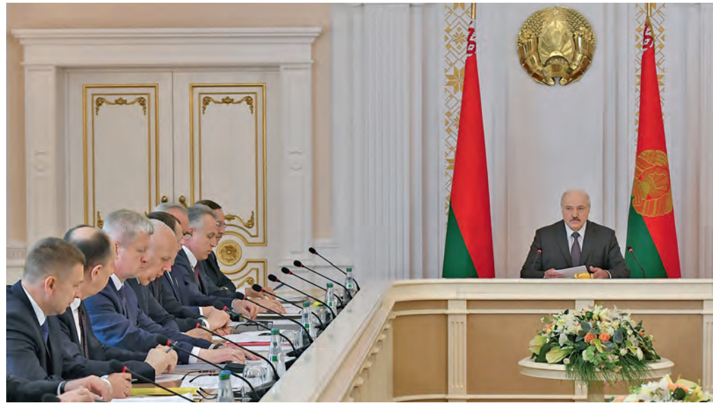
At the meeting devoted to forthcoming election campaign

Mr. Lukashenko said that the Election Code had not changed in the run-up to the elections, the existing rules are well-known. “Everything should be done in strict compliance with legislation. I want to emphasise once again: we are organising