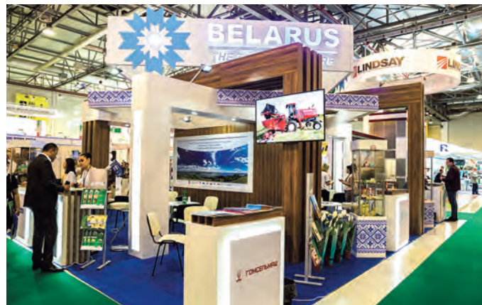
At Baku exhibition

The two countries have reached a new level of co-operation, as they implement