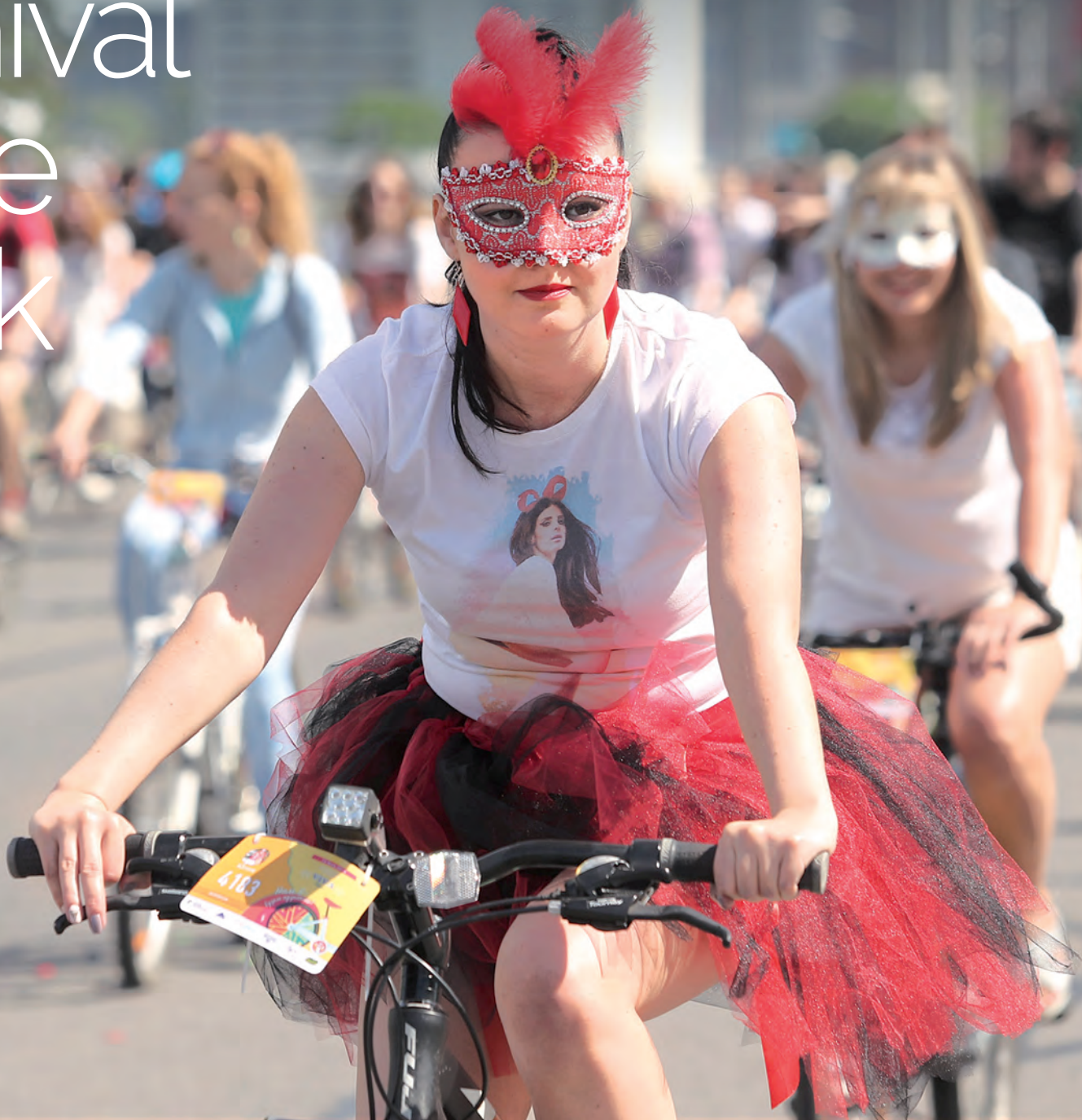
Cycling Carnival Viva Rovar becomes central event of Minsk's Cycling Week — gathering over 22,000 participants