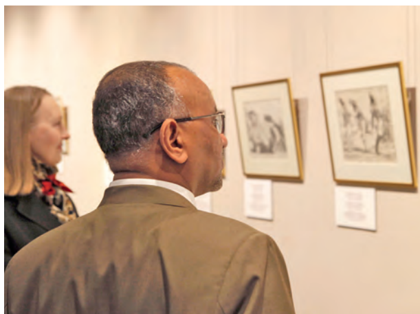
When true interest is demonstrated

One of the greatest French artists, Honore Daumier, was a famous painter, sculptor and draughtsman, but was best known for his caricatures. From 1830, he liaised with Charles Philipon by posting satirical illustrations in the La Caricature magazine; after 1832, he collaborated