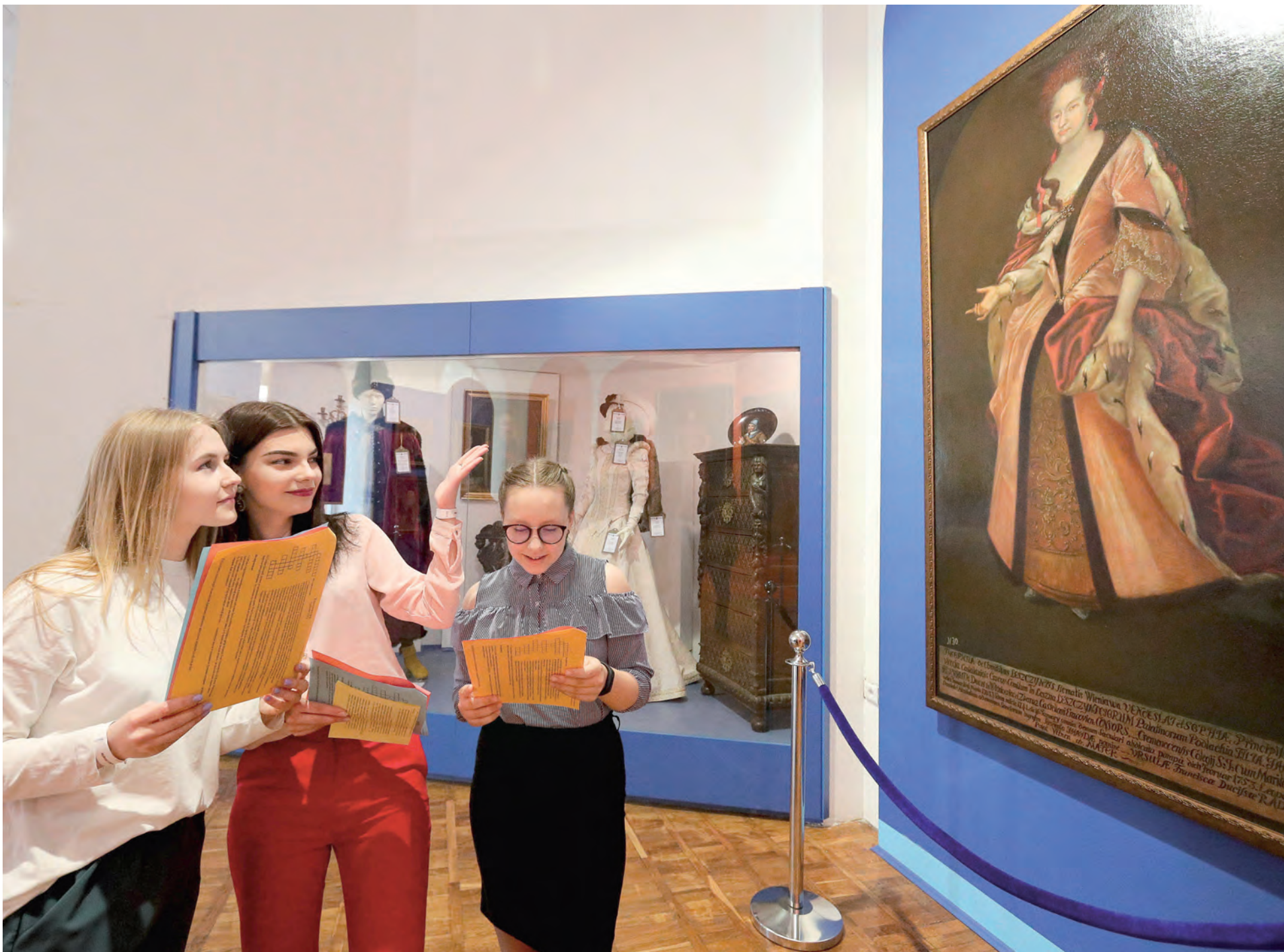
Saturday night at National History Museum

PUBLISHED SINCE FEBRUARY 2003 ● NO. 19 (785) ● THURSDAY, MAY 23, 2019 ● WWW.SB.BY