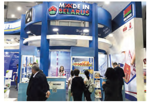
At the exhibition in Serbia

In particular, Belshina demonstrated tyres for agricultural machinery and trucks. The Mountain Wax Plant offered paraffins, highly refined candle wax, paraffin emulsions, reagents for drilling, model compositions for accurate casting and other products, including their business speciality, an anti-tracer for mineral fertilisers, which is designed to prevent caking and dust suppression during storage and transportation. In turn, Lidakhleboprodukt demonstrated flour and semi-finished flour products for fast preparation, as well as a