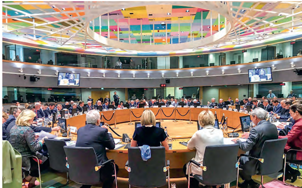
Representative meeting in Brussels

The Head of the Belarusian Foreign Ministry also called for the stepping up of digital co-operation and development of a regional agreement for person-