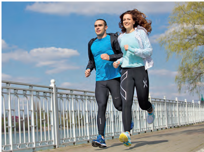
Correct training is a key

Before exercise, it’s important to define the final goal: active heart training or