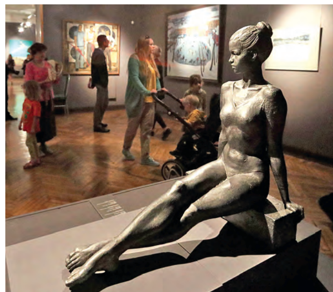
At National Art Museum

It was also possible to join in with cultural life at the Loshitsa estate, where works by famous composers from previous eras were heard. Moreover, the Yanka Kupala Literary Museum offered a treat by inviting everyone to celebrate its 75th anniversary. On that night alone, seventy-five exhibits with a unique history were on display.