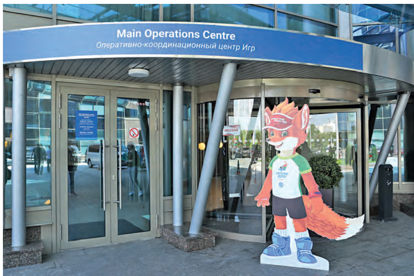
At the entrance to Main Operations Centre

The facility will receive immediate information about unexpected situations. Training sessions are already be-