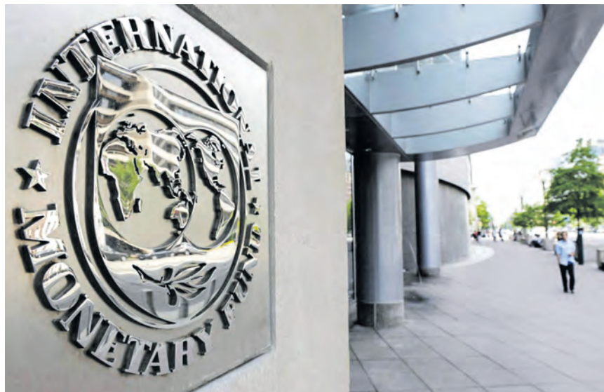
World Bank ready for investments

Apart from the investment portfolio, the parties reviewed progress in drafting the road map to increase the efficiency of the domestic economy. In particular, they noted that they share a vision of how the stability of the financial sector should be maintained, how public finances should be bolstered and how the public debt management policy should be improved. The World Bank deems it necessary to conduct more dramatic