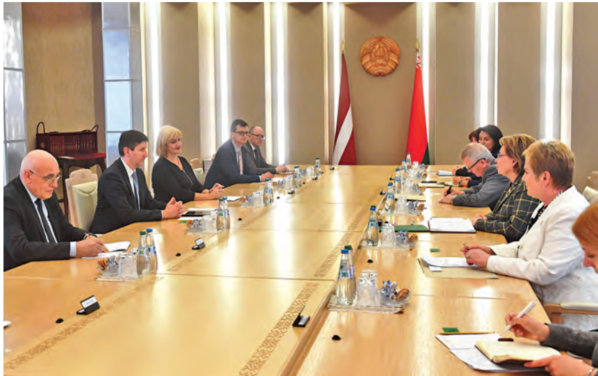
During the meeting in Minsk

The advancement of Belarus-China relations is also being considered. To get first-hand information on these matters, the delegation visited the Hi-Tech Park and the Chinese-Belarusian