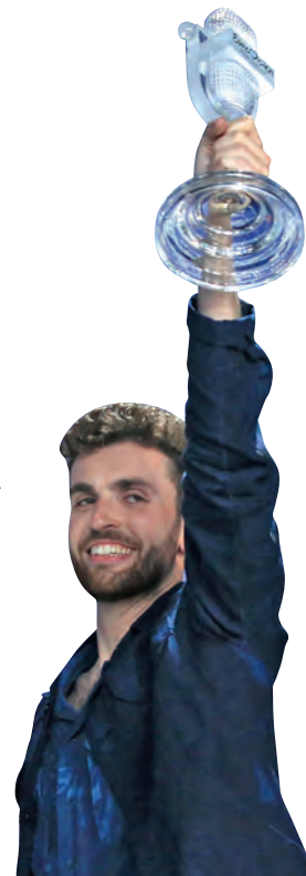
Duncan Laurence wins Eurovision 2019

Zina Kupriyanovich received her ZENA pseudonym after participating in the New Factory Star TV show, where