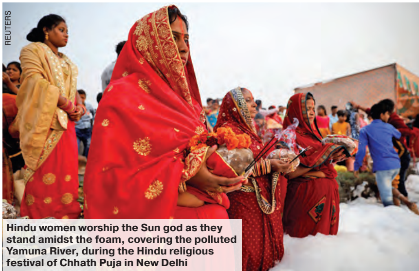
Hindu women worship the Sun god as they stand amidst the foam, covering the polluted Yamuna River, during the Hindu religious festival of Chhath Puja in New Delhi

"I urge everyone to look at this situation not through the prism of numbers but realise the plight of people like us who are facing a very serious situation,"