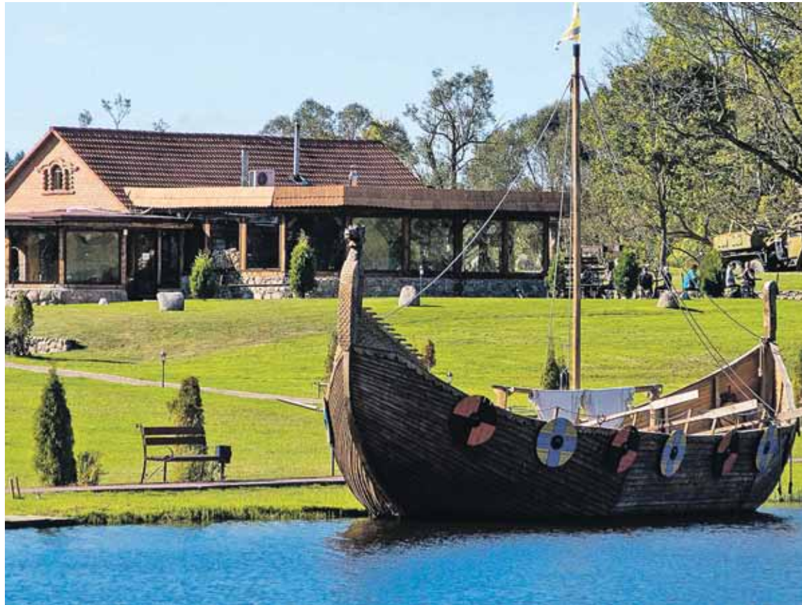
Drakkar sailing along 'Varangians to the Greeks' route

New approaches are being made, such as staff at the Park-Museum of Interactive History, at Sula in the