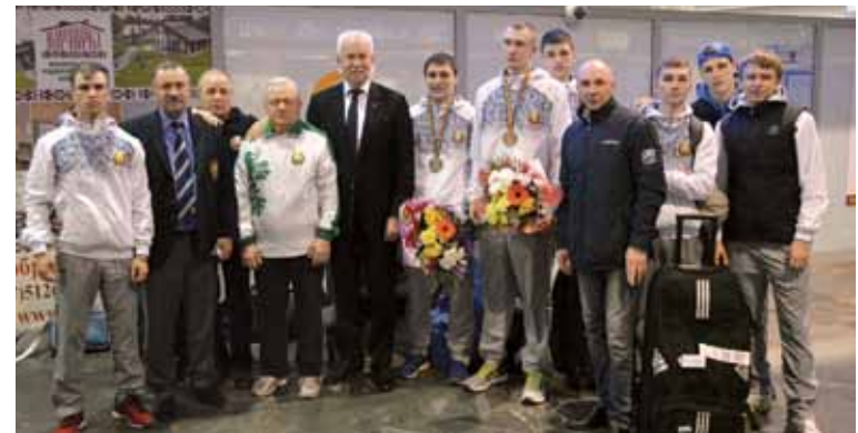
National boxing team at Minsk airport