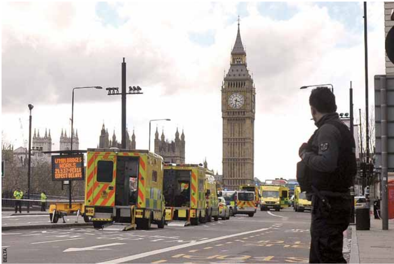
View of Houses of Parliament, from Westminster Bridge, where the tragedy took place