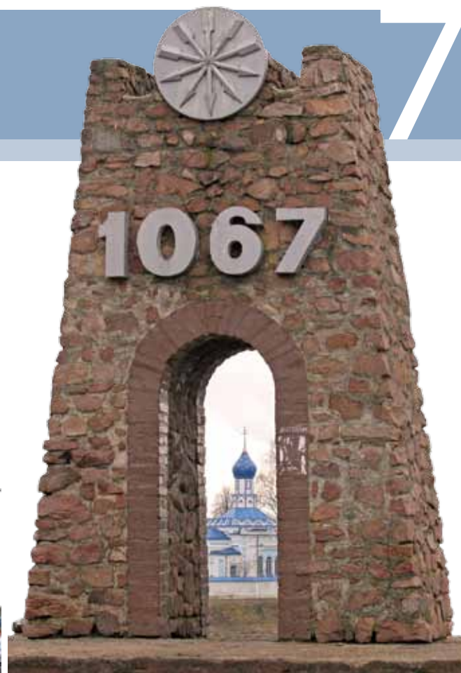
'1067' memorial sign on the site of ancient citadel

are often there, purchasing linen souvenirs at affordable prices. The world's largest flax mill operates in Orsha.