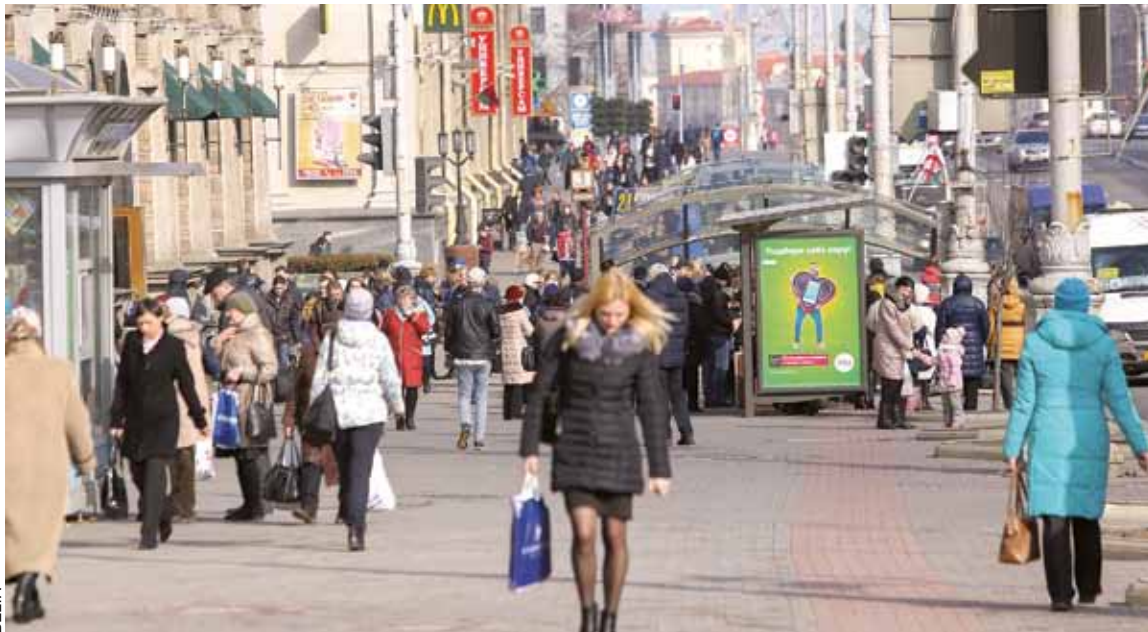
On Nezavisimosti Avenue, in Minsk

In this context, Mr. Lukashenko disavowed the opinion popular in certain circles that the authorities threaten people when they anticipate unwanted events. “Some people hold crazy opinions. I want to tell these people that the Government isn’t afraid of anyone. This especially pertains to the President. We pursue an honest and sincere policy,” asserted