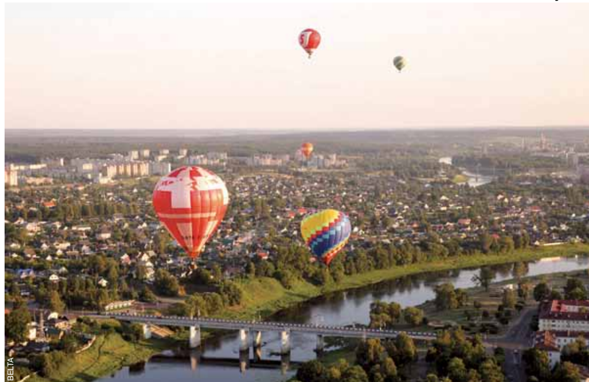
Balloons from four countries rise over Orsha

Twenty-five years later, a memorial sign, 'For Our Soviet Motherland!' appeared on the site, honouring the legendary weapon.