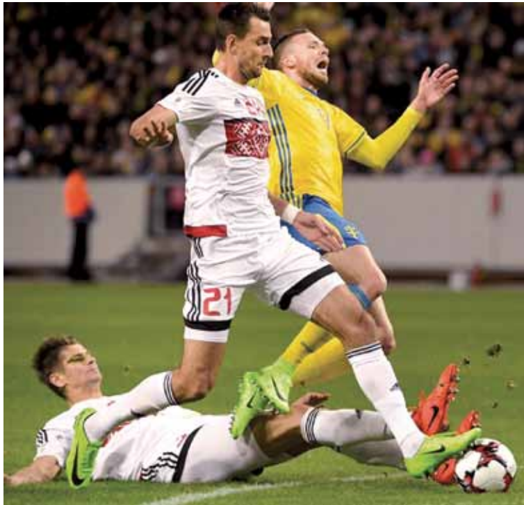
Moment from Sweden-Belarus match

Theelin appeared on the pitch, he used a pass from Oscar Hiljemark to score, leaving Sweden with a four goal victory.