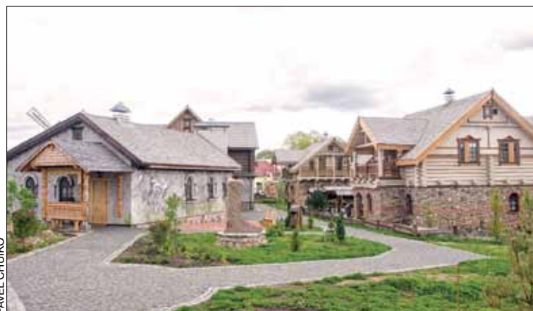
Nanosy agro-estate in the Myadel District

Meanwhile, Russians are delighted with Belarusian villages, enjoying traditional holidaying, in old wooden houses near the forest or on