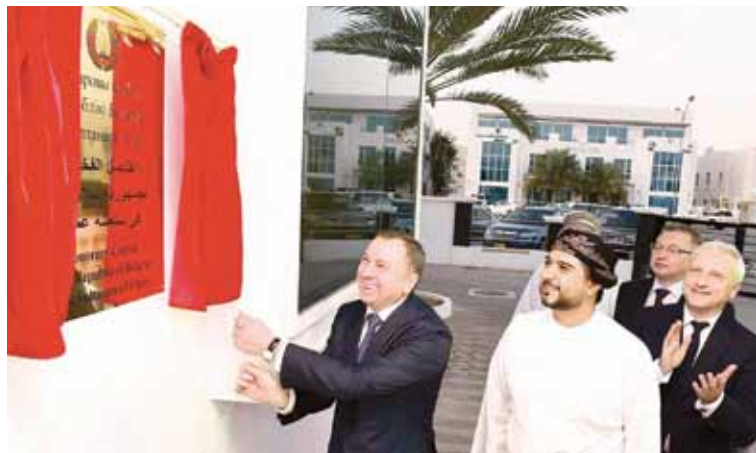
Office of the Honorary Consul of Belarus opens in Sultanate of Oman

The Belarusian Foreign Minister emphasised the need to promptly form an intergovernmental mechanism of co-operation between Belarus and Oman in the format of a joint committee, and to sign a corresponding bilateral agreement. The Deputy prime Minister said that Oman will undertake necessary steps in the near future.