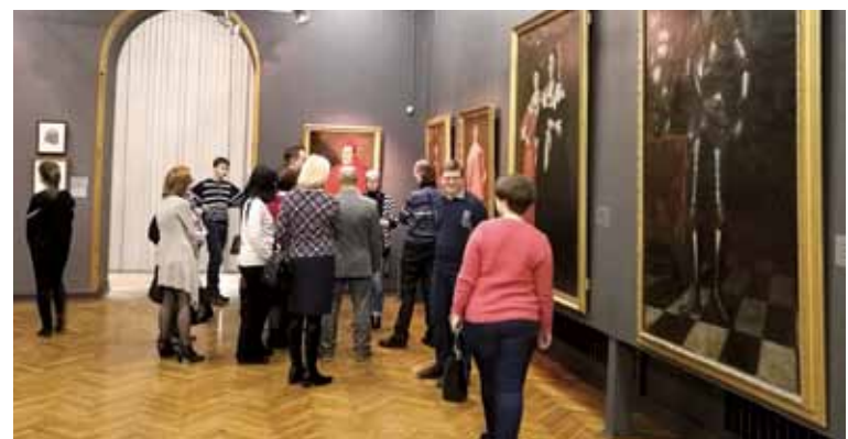
Audiences sure to be delighted by F. Ruszczyc's exhibition

it's important to step up our cultural collaboration and notes that Poland is eager to provide assistance with the renovation of Fer-