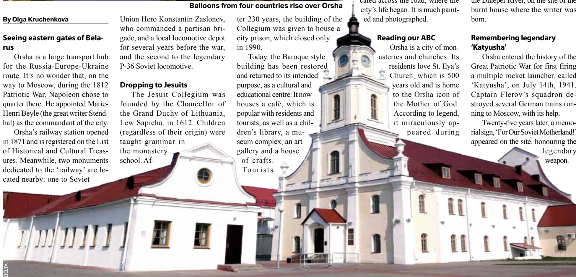
Restored building of Jesuit Collegium in Orsha