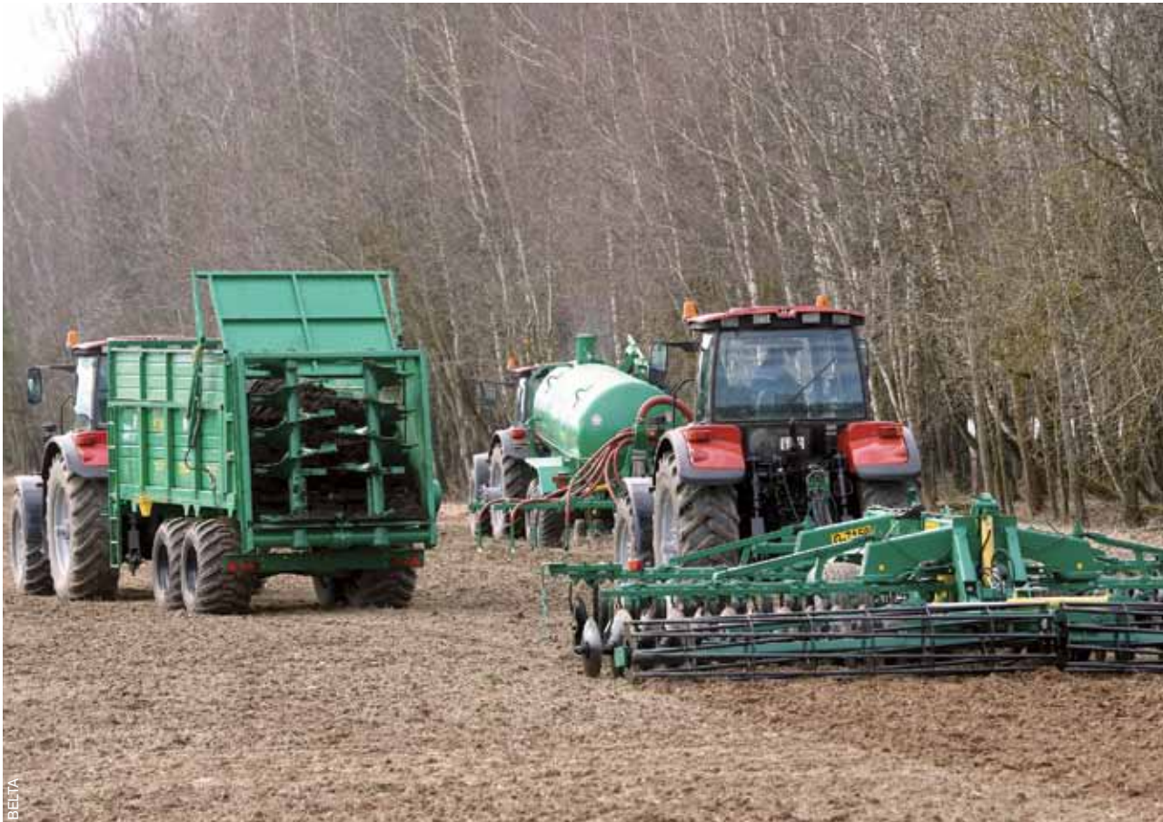
Machinery at work in the fields of Lidsky Sovkhoz agro-enterprise, in the Grodno Region