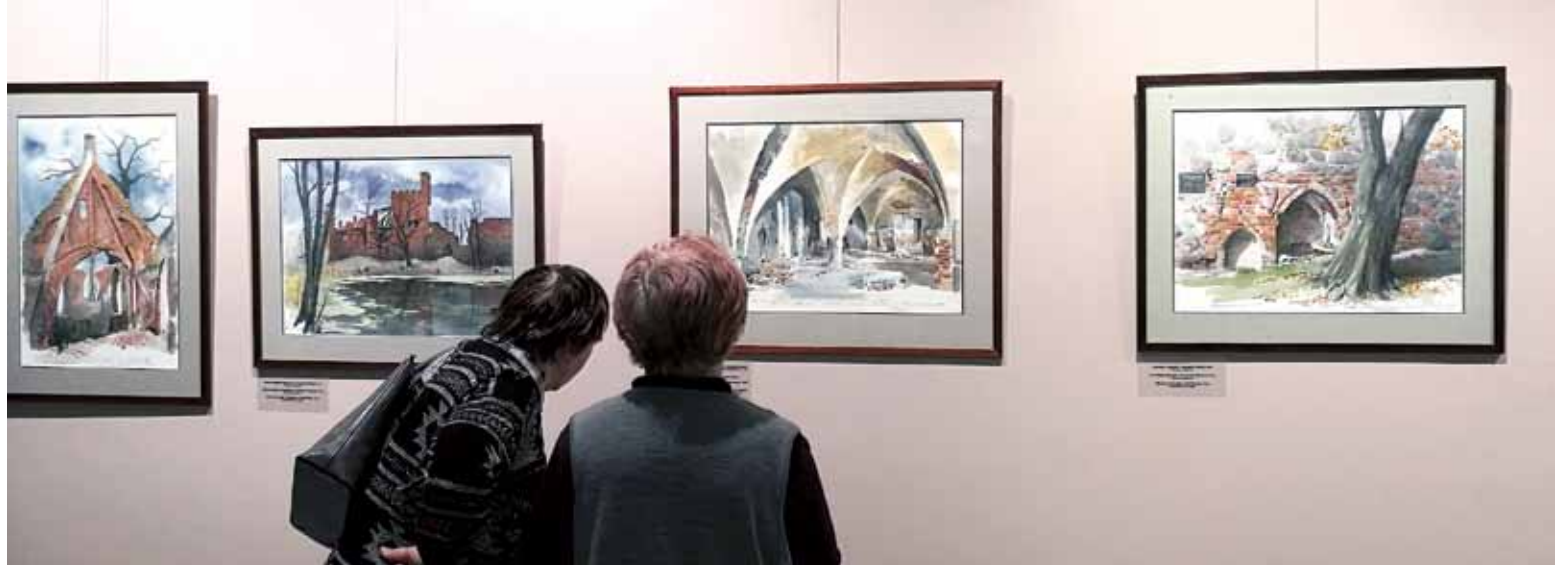
Works on museum display attract with their historical authenticity