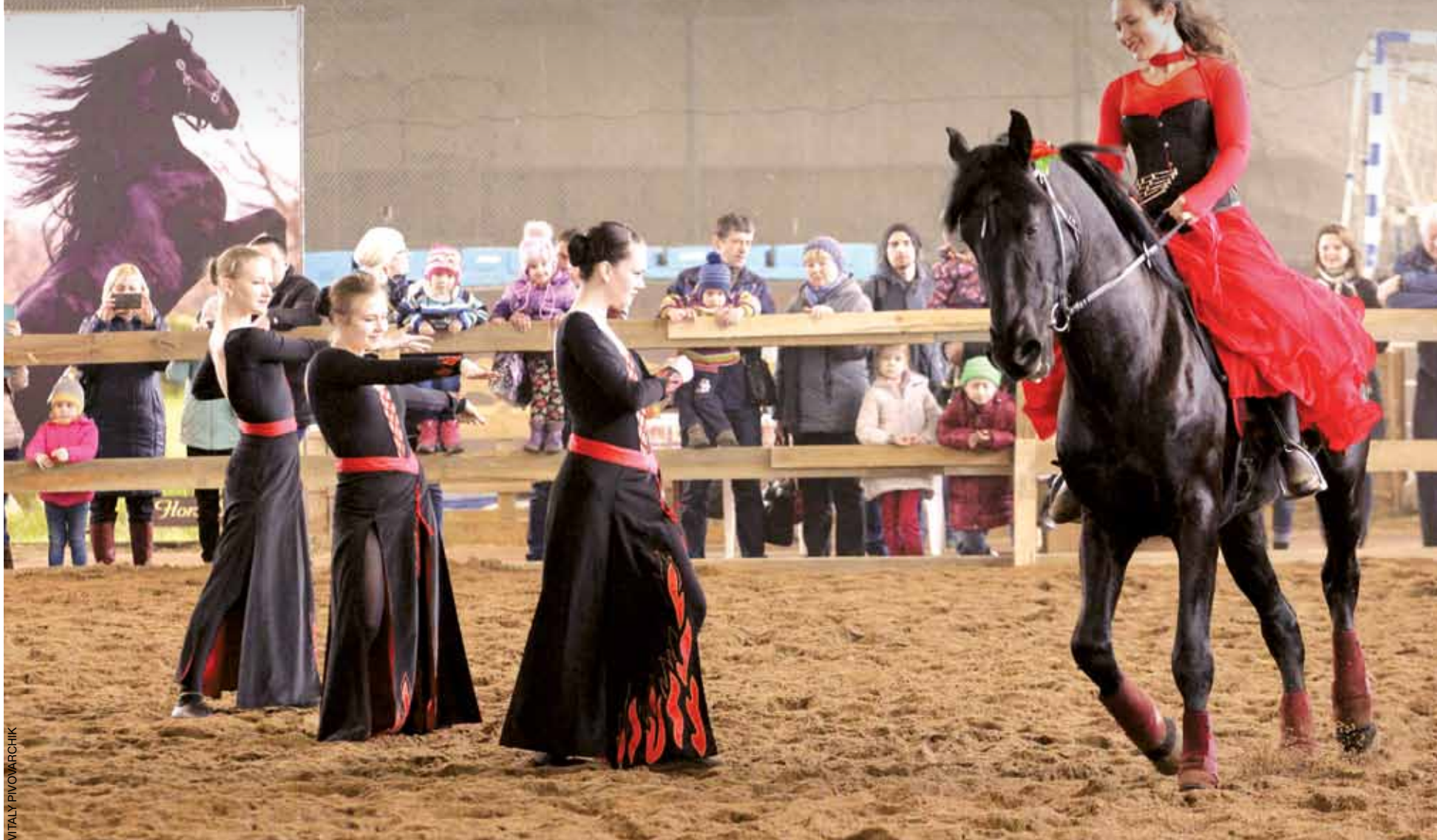
Minsk's Dinamo Sports Complex hosts exhibition of pedigree horses