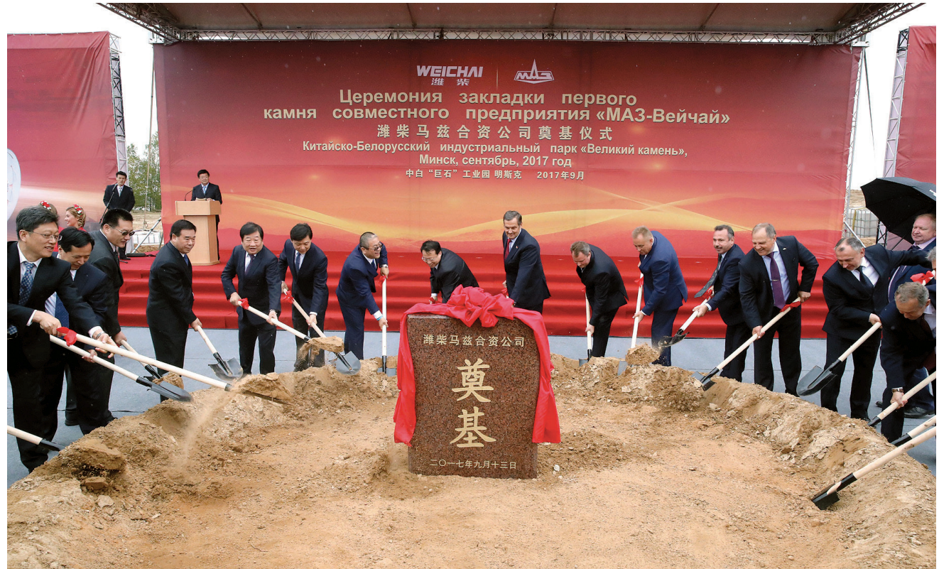
During the first stone laying ceremony on the construction site of MAZ-Weichai