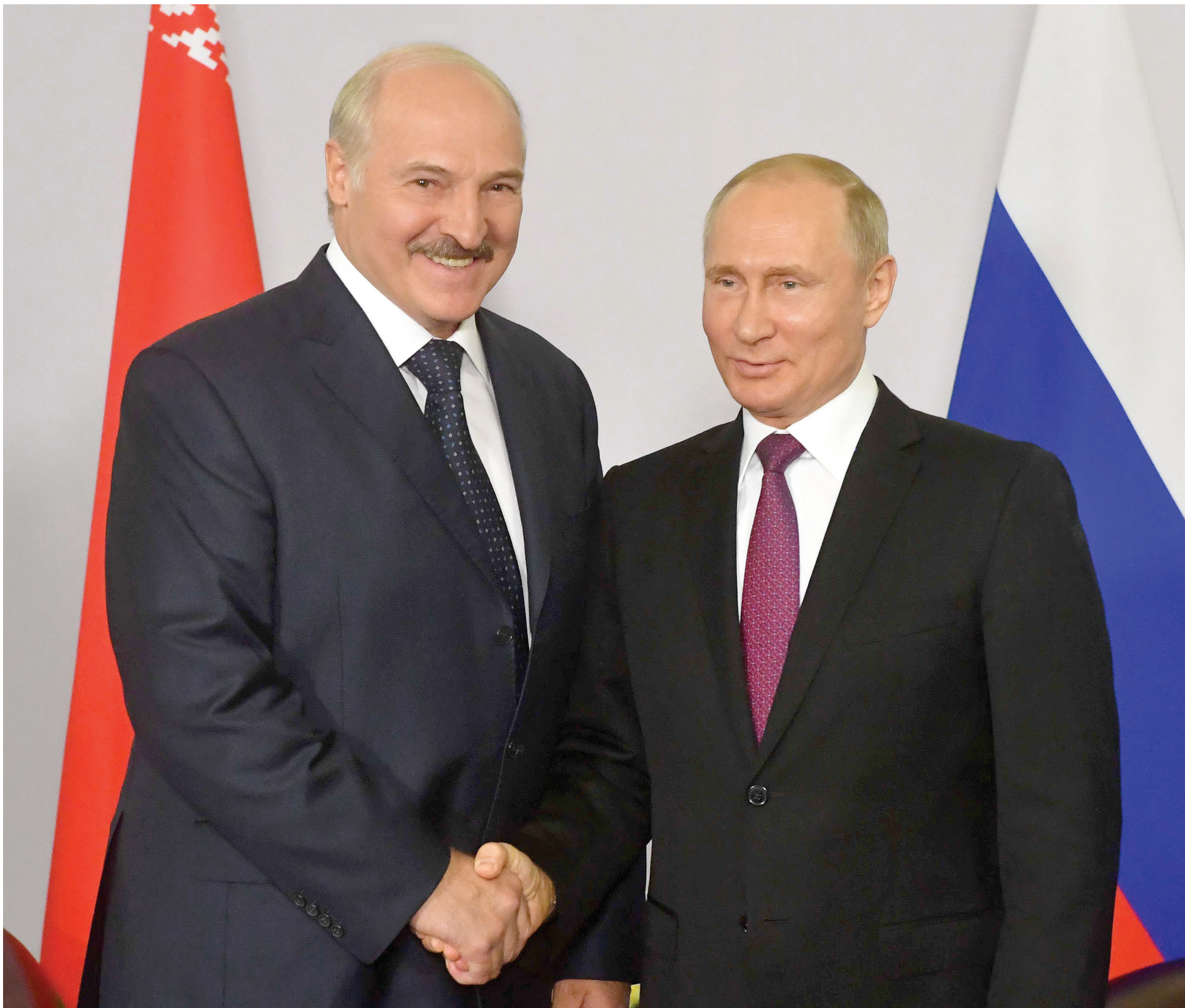
President of Belarus, Alexander Lukashenko, and President of Russia, Vladimir Putin, during their meeting in Sochi