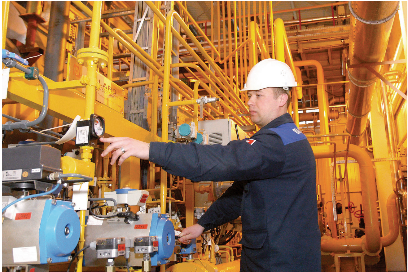
In Grodno Azot’s manufacture workshop

According to experts’ information, each of the options for the enterprise’s