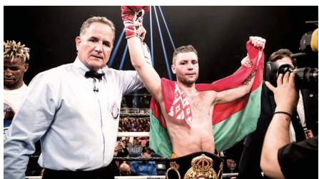
The Russian boxer is a former world champion of the International Boxing Federation

The match will take place during the World Boxing Super Series (WBSS) tournament in the under 63.5kg weight category. His rival will be Eduard Troyanovsky of Russia.