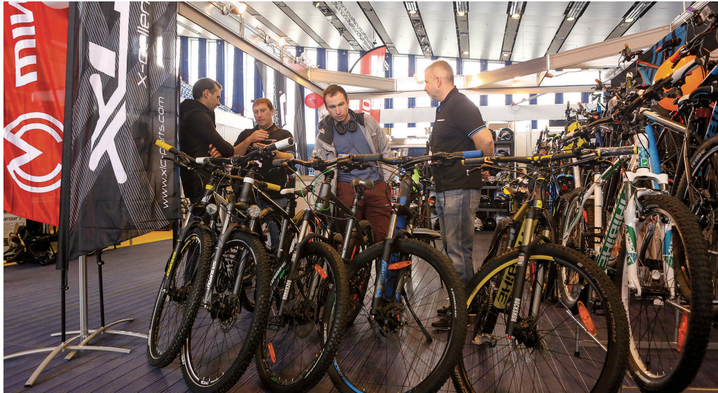
3rd International Specialised Motoveloxpo opens at Sports Palace