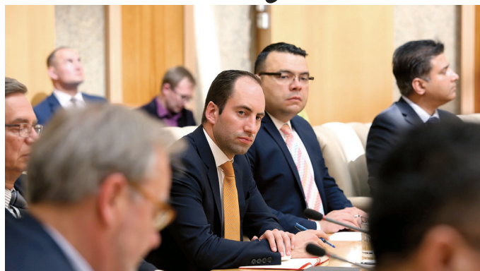
At the meeting with World Bank representatives

According to Mr. Kobyakov, Belarus expects the implementation of projects together with the World Bank to contribute to the implementation of the main government programmes in the medium term, thus creating the foundation for long-term sustainable growth of the country’s economy. In 2015, Belarus and the World Bank put together a roadmap, which lies at the heart of the programme guiding the government’s work. Most of the document specifics have been fulfilled and contributed to the economic growth in 2017 and 2018. Mr. Kobyakov noted that close attention is paid to the encouragement of entrepreneurship and business activities in Belarus. A package of regulatory acts