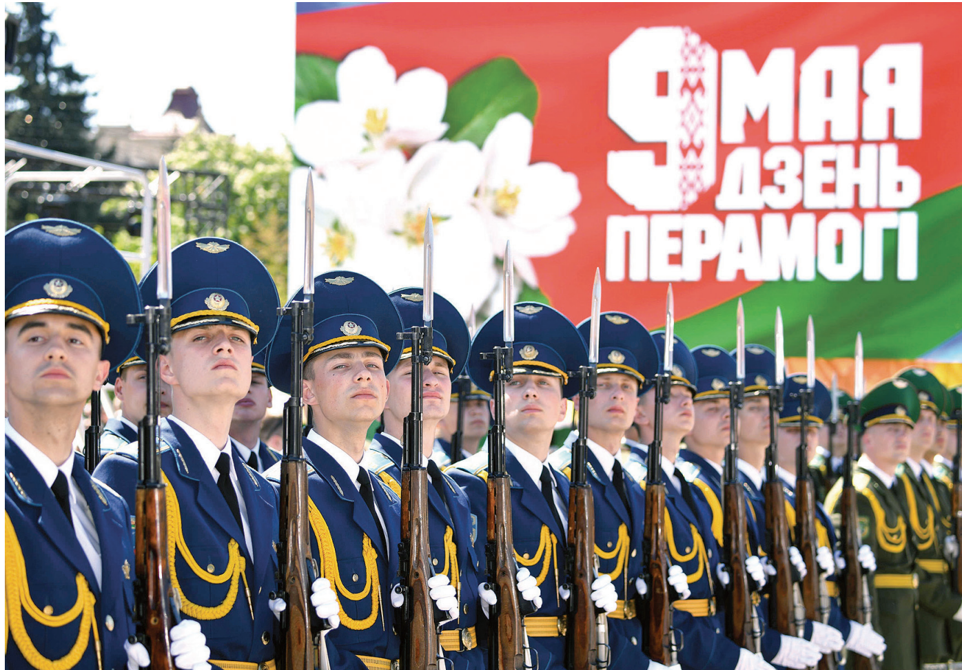
Victory Day celebrations in Minsk

It's impossible to forget about the Great Patriotic War, no matter who is in power, President of Belarus, Alexander Lukashenko, tells the media on Victory Day, May 9th