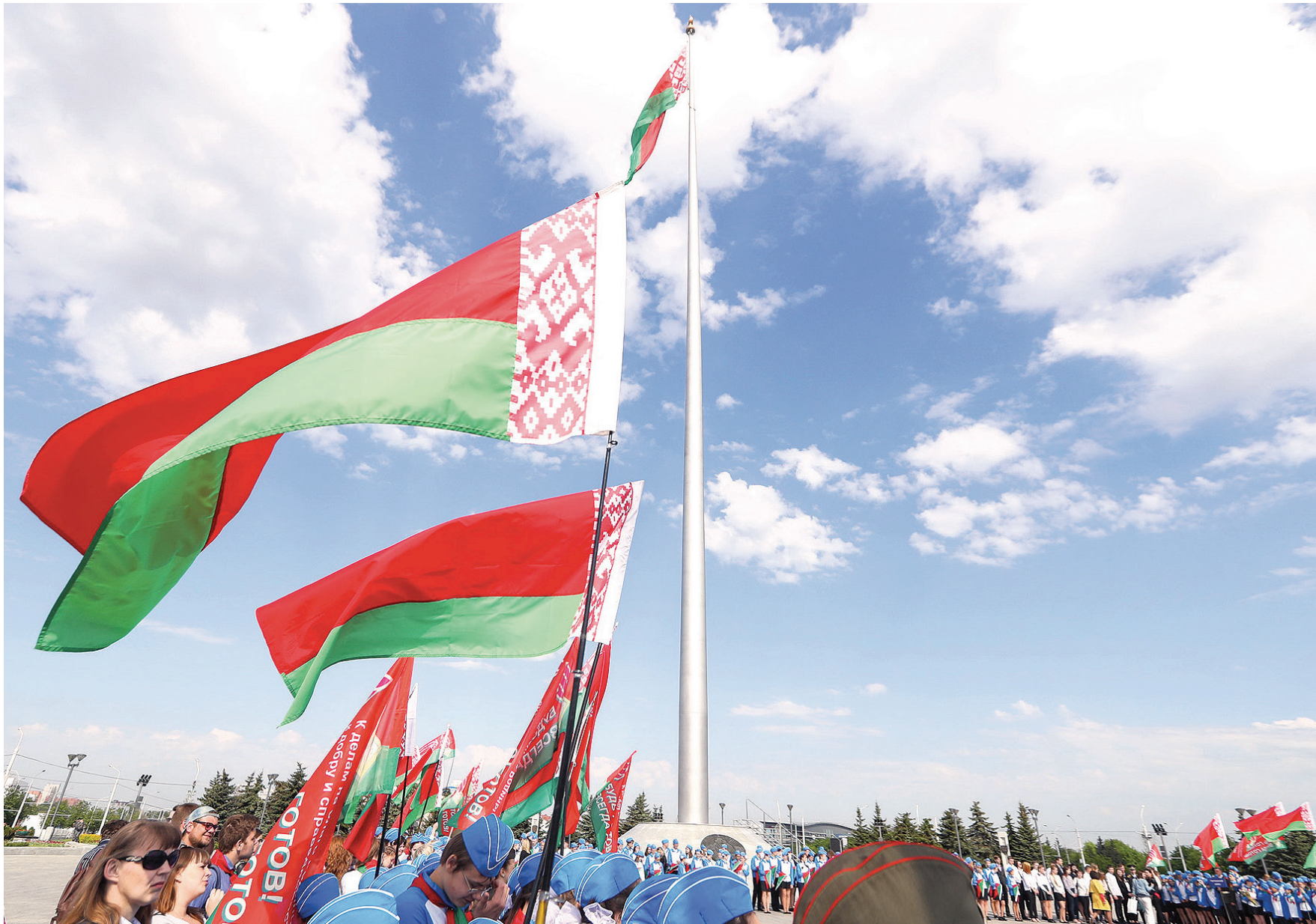
We're Proud of Our Motherland campaign takes place on the State Flag Square in Minsk, dedicated to the Day of State Emblem and Flag