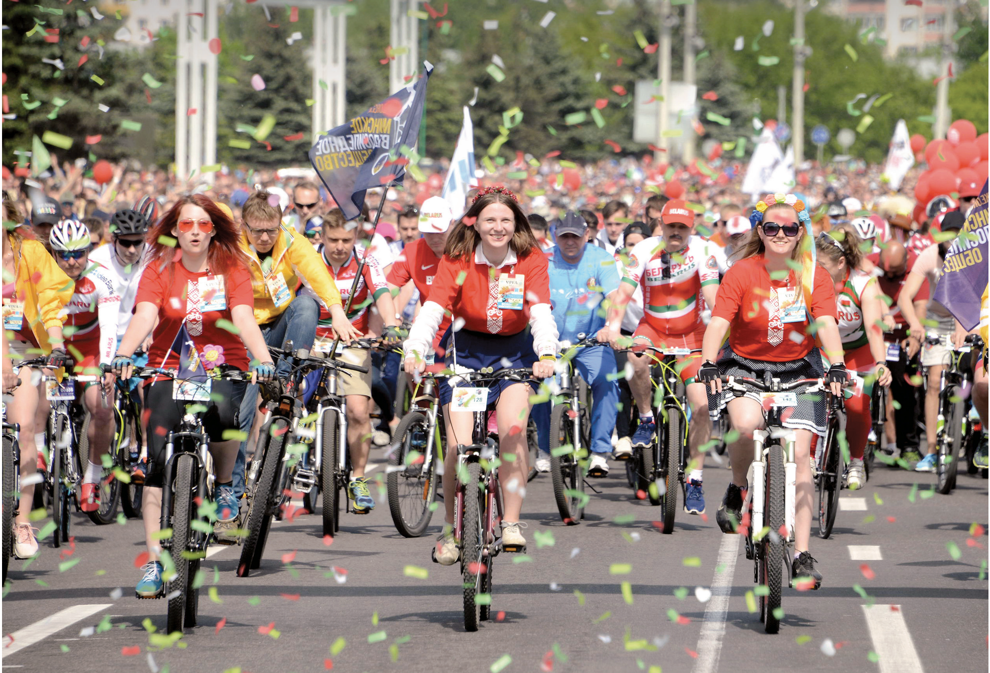
Minsk hosts traditional cycling carnival — Viva Rovar