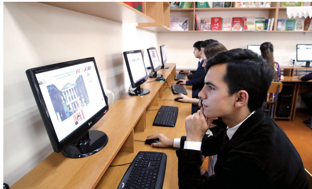
Belarus’ Legal Information Centre opens in Tajikistan’s capital Dushanbe

Mr. Ivanov said that, in previous years, trade-economic collaboration with Tajikistan was not steady for a number of reasons. “We’ve outlined a rather pragmatic and specific programme of action, first of all, in trade and the economy. It is during the visit that the road-