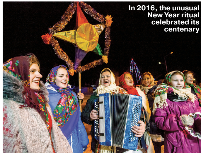
In 2016, the unusual New Year ritual celebrated its centenary

The main character of the magical night is the 'horse', whose head is made from a felt boot and whose body is