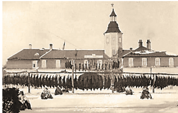
Radziwill magnates once organised true 'tsarist' hunts

made from basket weave, with a flax tail fixed behind. A soldier in an overcoat leads the horse by its reins, followed by a noisy crew with songs and dances, going from one house to the next, singing carols. The custom appeared during the First World War. On the eve of the old calendar New Year, Russian