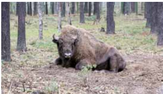
Host of the forest

the Greeks', now being used again to transport goods and timber to Riga port, and for canoeing.