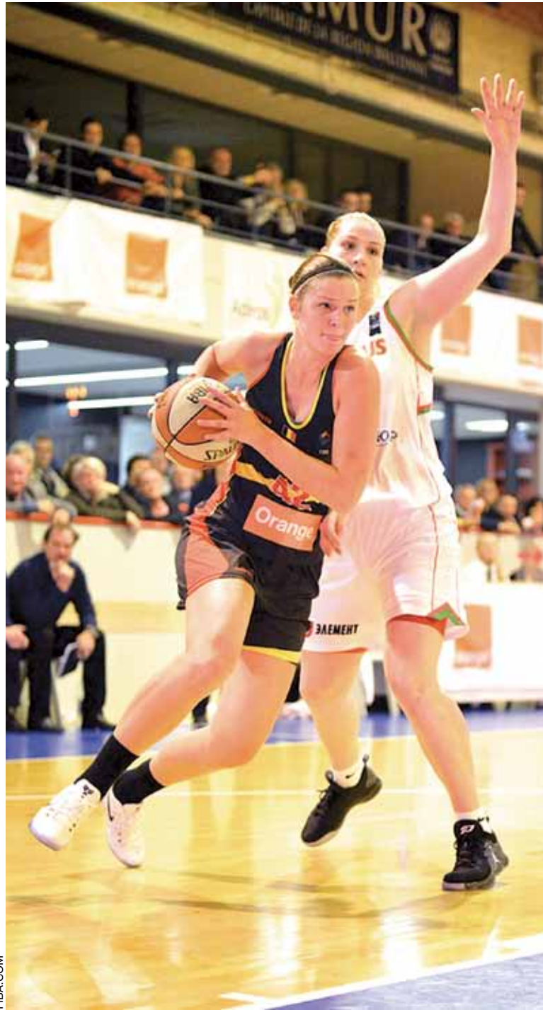
Belarus-Belgium match kicks off