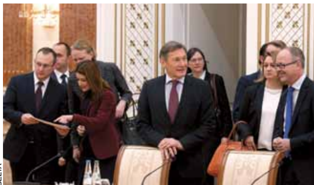
Delegation of Council of the European Union

Commission members asked about the areas in which Belarusian partners most welcome investment, and discussed the country’s role within the Eastern Partnership . Regional issues also came under scrutiny, with Belarus’ status as a pole of stability and security being obvious to all. The UK’s recent ‘Brexit’ vote also came under discussion, with the President stressing