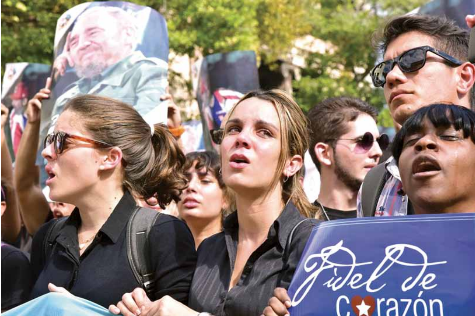
Students and teachers from University of Havana honour the memory of Fidel Castro