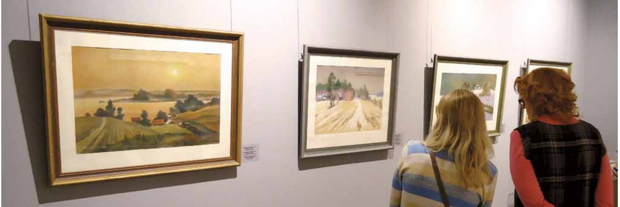
Exhibition of Mikhail Karpuk's works at National Art Museum