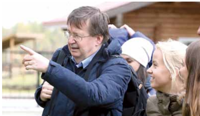
Czech participants of the project

In this part of the country, there are many Great Patriotic War memorials. Mass graves and monu-