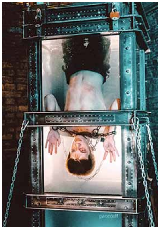
During the performance