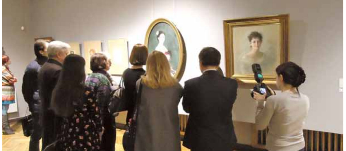
Diverse creativity of Leon Bakst