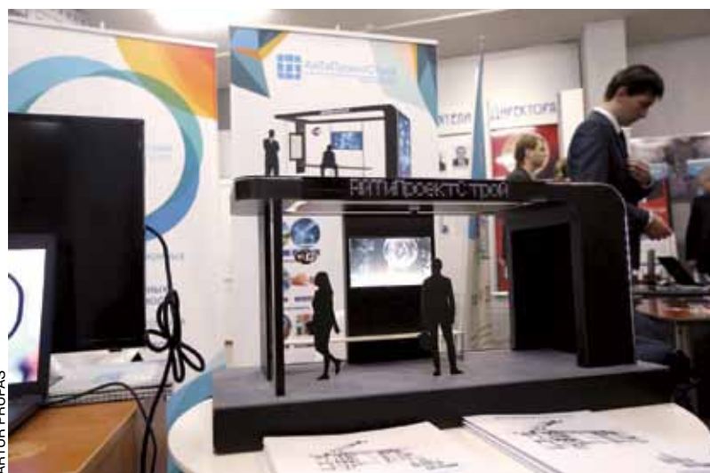
Artificial Intelligence Centre exhibition