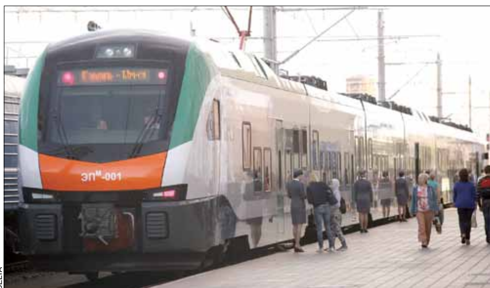
InterCity business class electric train runs between Minsk and Gomel

Minsk-Gomel remains a popular route, so extra carriages are being added to