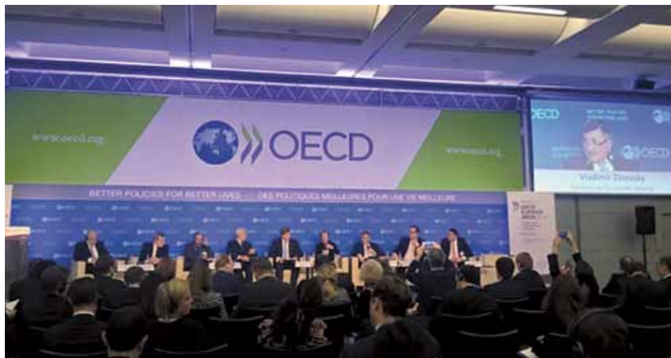
Discussion during the Week of Eurasia in Paris

For the first time in the history of the Organisation for Economic Co-operation and