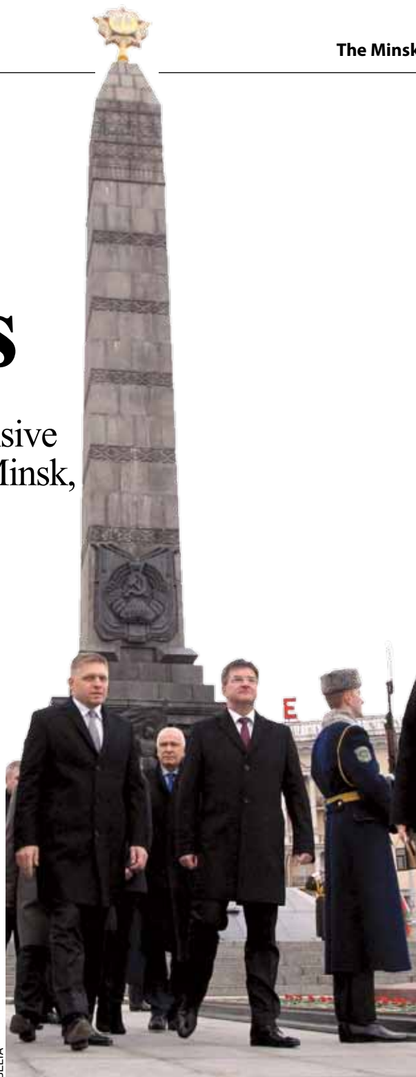
Robert Fico in Pobedy Square in Minsk

Mr. Fico praised Belarus’ stable and dynamic development, and its considered decision-making regarding privatisation. He views political stability in Belarus as an important factor in our good