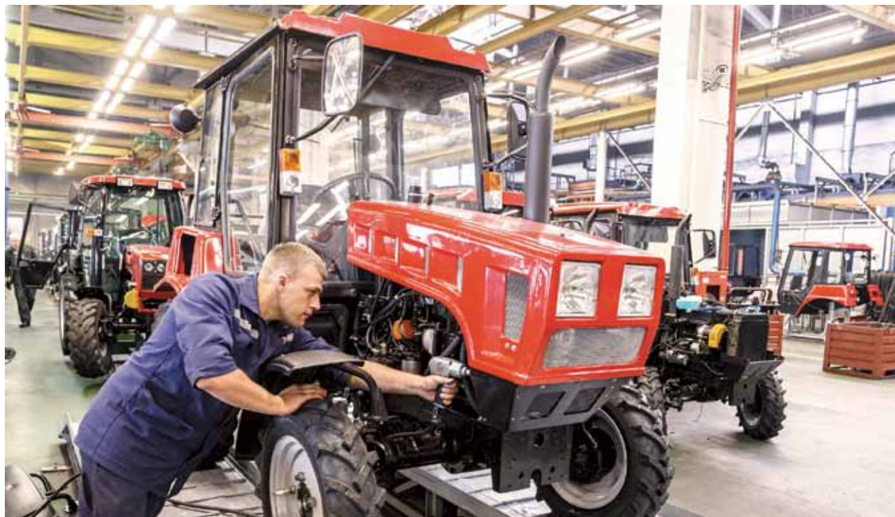
Assembly line of Bobruisk Plant of Tractor Parts and Units

In 2014-2015, enterprises' output fell by 50 percent, and fell again in 2015, by 25 percent. Industrial potential was replenished by only 3 percent between January and October 2016.