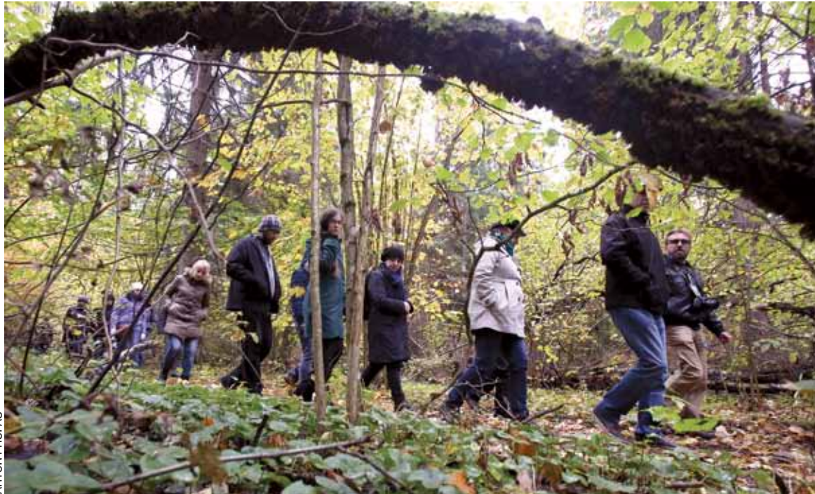
Walking along ecological path

In the reserve is a watershed between the basins of rivers from the Baltic and Black seas. Two hundred years ago, the Berezina water system, a unique engineering construction, appeared on the region's map. It represents a network of man-made channels that connect seven lakes and two mighty rivers: the Dnieper and the Zapadnaya Dvina. Running 162km, with a dozen and a half locks, it's part of the ancient waterway 'from the Varangians to