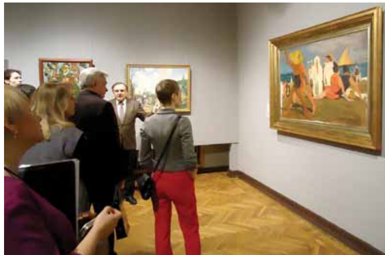
At exhibition of L. Bakst's works