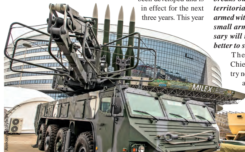
MILEX exhibition maintains its reputation. Belarusian machinery is traditionally highly appreciated.

“Several pavilions of foreign partners will attend. 31 delegations have already confirmed their participation,” added Mr. Pantus.