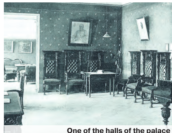
One of the halls of the palace