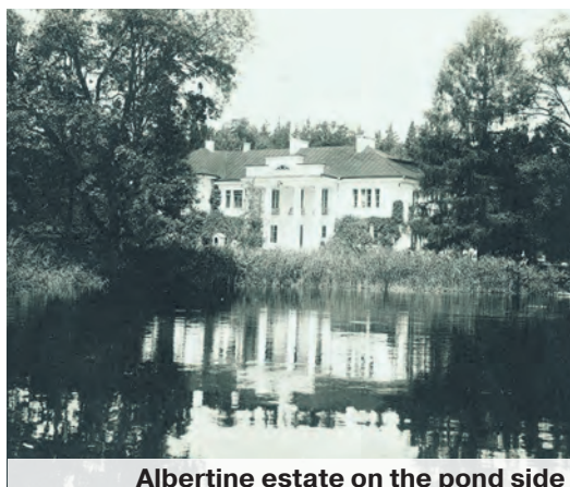
Albertine estate on the pond side