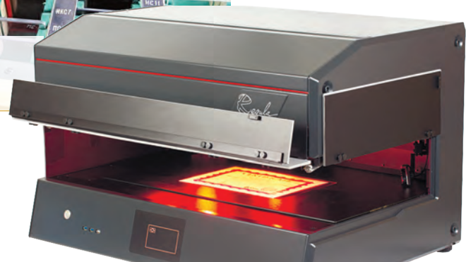
The work is now greatly facilitated by a special device: a video spectral comparator

The photo 'before' shows that the document was badly damaged: a stain — presumably from water — blurred part of the record in the very centre. The experts had a great deal of work to do to return it to a readable form. After all, these words were worth reading. Here is what they managed to restore: 'The Supreme Commander-in-Chief Generalissimo of the Soviet Union, comrade Stalin, announced to you twenty-one gratitudes for your bravery, courage and skills shown in the capture of the cities of Berdichev and Zhitomir, in the destruction and encirclement of the Korsun-Shevchenko group of German troops... during the breaking through the heavily fortified defence of the Germans northeast of Budapest and reaching the Danube River... during the defeat of eleven German tank divisions in the area of Lake Balaton...' The letter lists several dozen cities that were