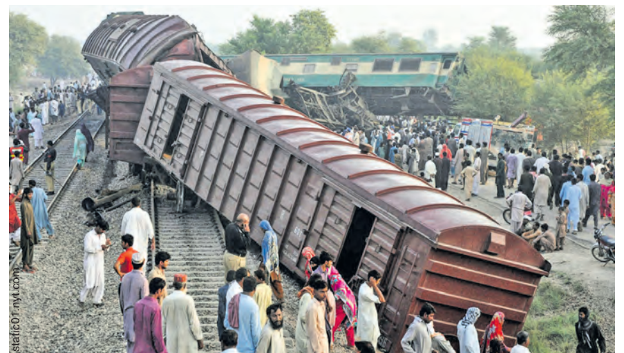
Materials prepared with aid of information agencies

Senior railway official Arshad Khan said an initial investigation into the crash suggested the Millat Express derailed because a recently welded joint of the track broke.