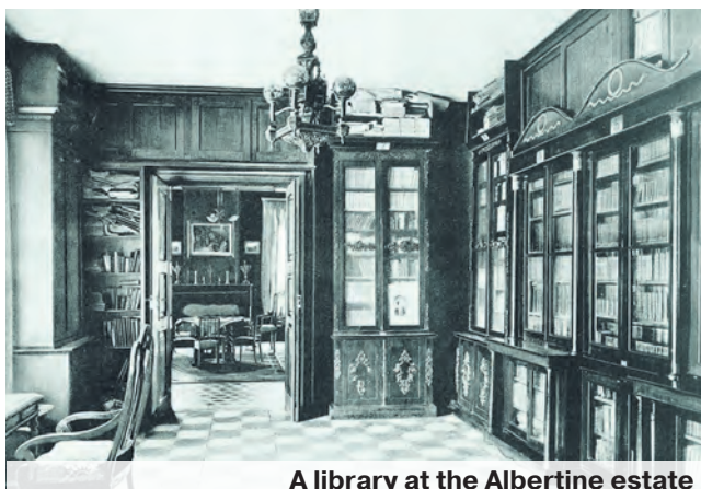
A library at the Albertine estate