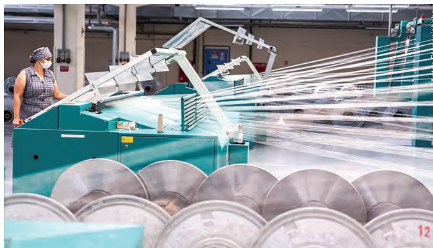
This year, the industry is demonstrating positive dynamics

A good trend is registered: exports of Bellegprom organisations in January-April increased by 15 percent to reach $142m