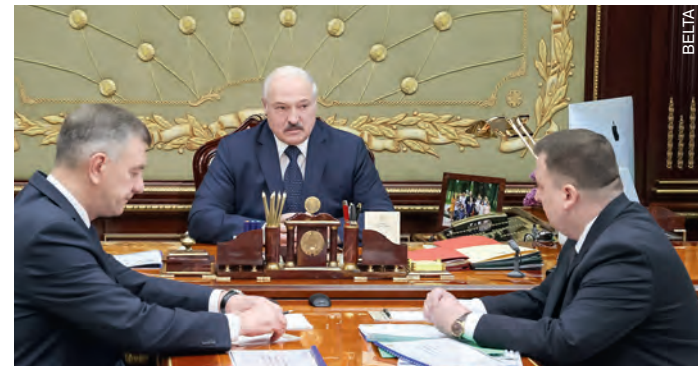
During a meeting with the President: Deputy Prime Minister Yuri Nazarov and Chairman of the State Authority for Military Industry Dmitry Pantus

A meeting at the Palace of Independence focused on sanctions, new weapons and MILEX exhibition as part of discussing the work of the military-industrial complex