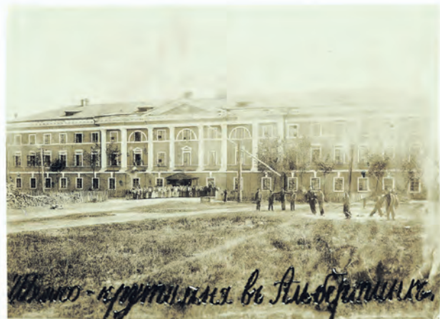
A factory building

count built not only festive, winter and summer palaces here, but also a park with a pond. In the festive palace, he received guests. Balls and theatrical performances were held on the first floor. The reception rooms were decorated with paintings by Italian artists. It's impossible to see any of them now: the estate hosts took thirty wagons of heirlooms out of the country in the 1930s. It's possible to imagine how luxurious the estate was by looking at the remains of stucco on the walls, the vases and lion figures at the front entrance. Interestingly, the king of animals is seen not only here: the lion is also depicted on Slonim's coat of arms.