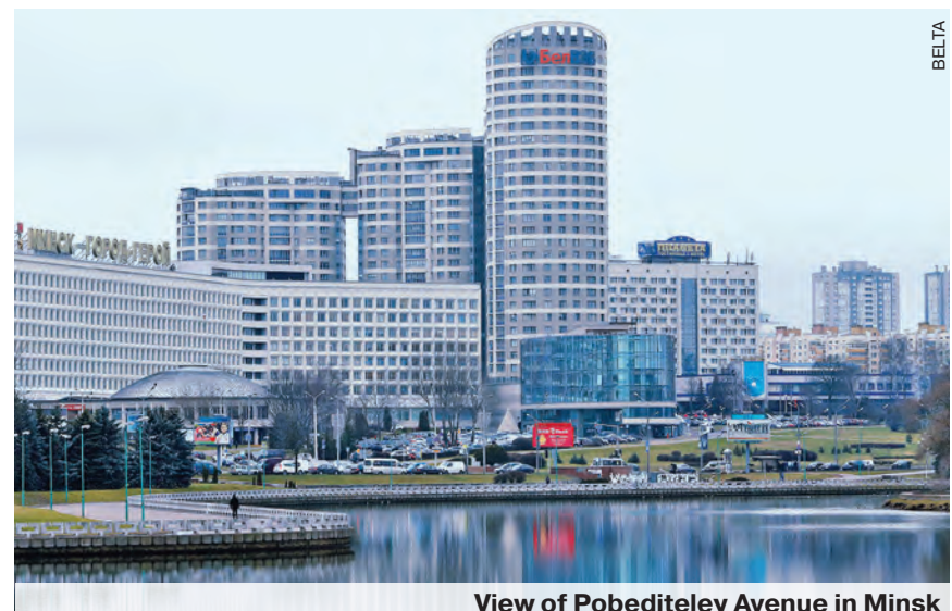
View of Pobediteley Avenue in Minsk

Will spring surprise us with new climate anomalies? It is difficult to judge yet. According to the assessment of the North-Eurasian Climate Centre, which specialises in long-term climate forecasts for the CIS countries, the air temperature in Belarus in March will be slightly higher than normal.