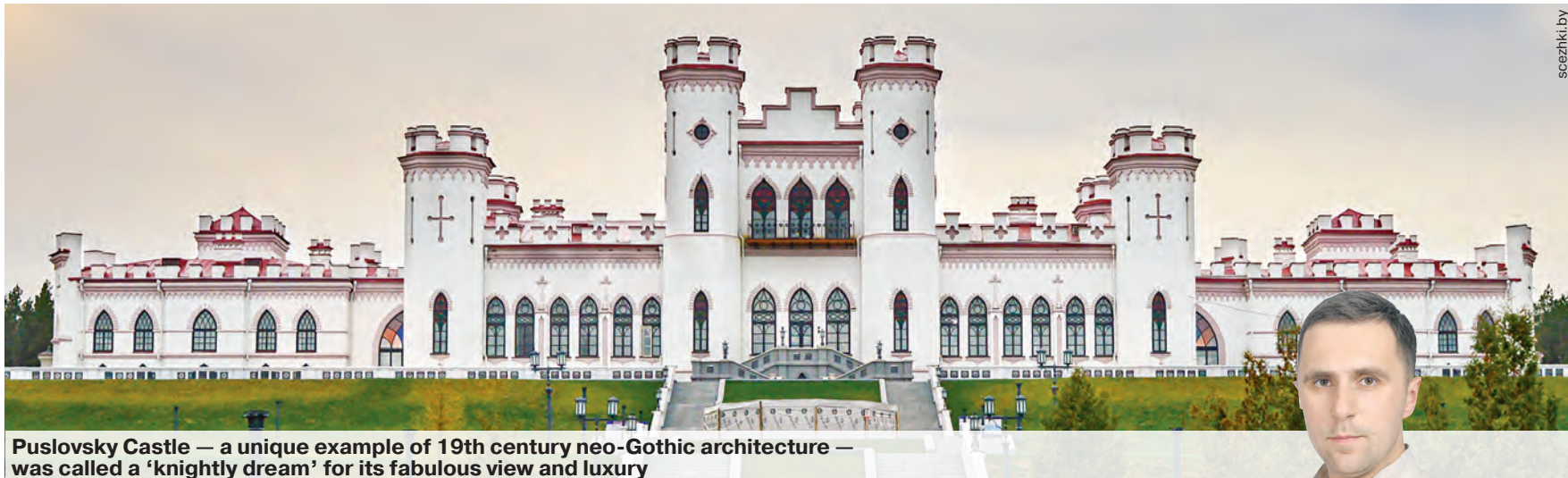
Puslovsky Castle — a unique example of 19th century neo-Gothic architecture — was called a ‘knightly dream’ for its fabulous view and luxury