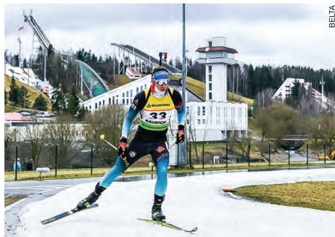
Considerable effort made to maintain snow reserves and ensure the track met the level required for the competition

"When the decision was made to postpone the European Championship, the picture outside the window still gave some hope that there would be at least a few 'winter' days. But closer to the start of the competitions, the weather presented us with one surprise after another."