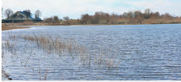
Floodplain meadows near Turov already filled with water overflowing from the Pripyat's banks