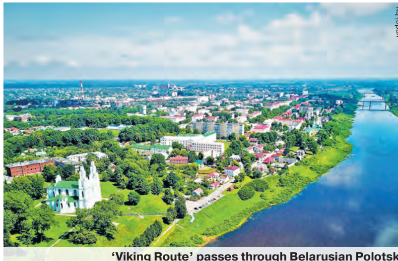
‘Viking Route’ passes through Belarusian Polotsk

Belarus granted observer status in the Enlarged Partial Agreement on Cultural Routes of the Council of Europe