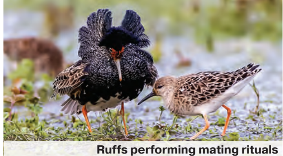
Ruffs performing mating rituals