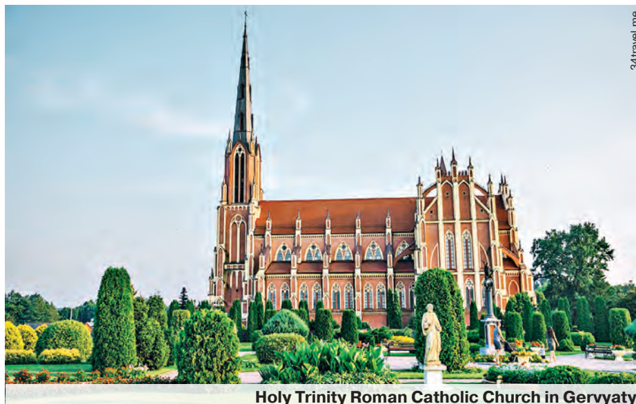
Holy Trinity Roman Catholic Church in Gervyat