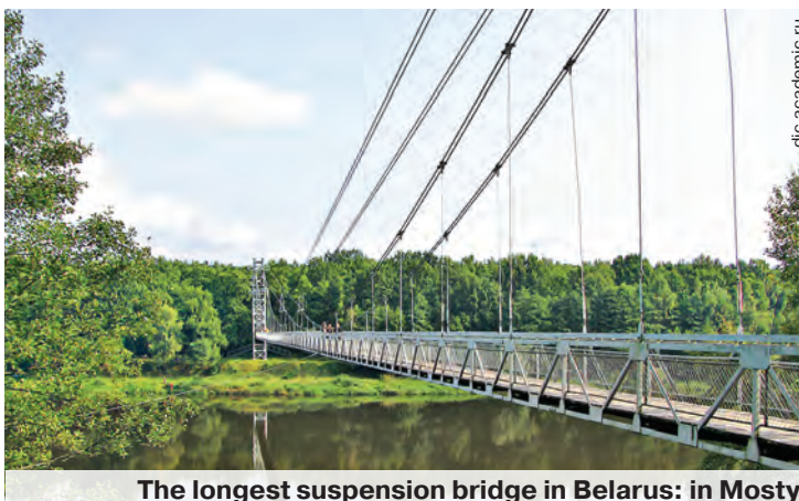
The longest suspension bridge in Belarus: in Mosty