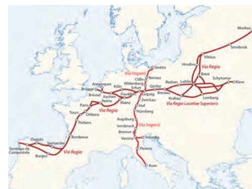
Route map of ‘Via Regia’ and ‘Via Imperii’

Belarus truly enjoys considerable potential from the point of view of enriching regional intercultural co-operation. There are over 15,000 objects of historical, cultural and artistic significance in the country; 5,500 are included in the state list of historical and cultural values. The country also has a large number of memorials associated with the names of prominent figures in world history and culture — such as Adam Mickiewicz, Fiodor Dostoevsky, Simeon Polotsky, Mark Chagall, Nadia Leger and Kazimir Malevich.