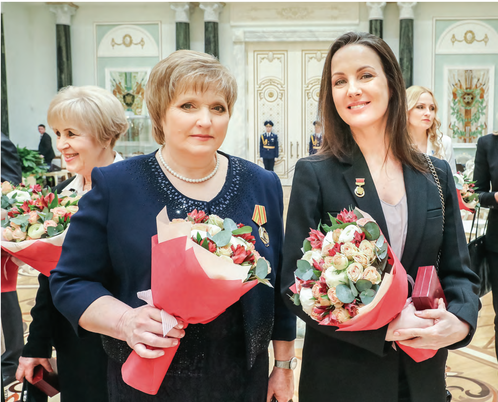
Smiles, beauty and charm of the awarded participants contribute to a special atmosphere of the event

PUBLISHED SINCE FEBRUARY 2003 ● NO. 10 (824) ● THURSDAY, MARCH 12, 2020 ● WWW.SB.BY