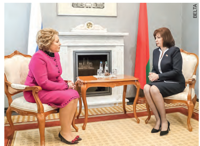
During the meeting between Valentina Matviyenko and Natalia Kochanova

During the official visit, Valentina Matviyenko also held talks with the chairpersons of the Council of the Republic and the House of Representatives of the National Assembly, Natalia Kochanova and Vladimir Andreichenko. One of the topics of discussion in the Upper House of Parliament was the preparation for the 7th Forum of Regions of Belarus and Russia which will be dedicated to the historical legacy of the Great Victory and bring together more than 500 people. "The business agenda will be an important part of the programme. Belarusian and Russian business circles will discuss prospects for co-operation and new joint projects. Co-operation agreements and commercial contracts will be signed," Ms. Kochanova announced. She also expressed confidence