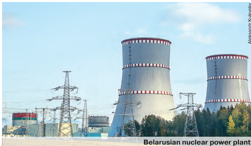
Belarusian nuclear power plant

Belarus is determined to establish a safe, efficient and environmentally friendly industry that will foster the country’s growth. An absolute priority in the construction of the Belarusian NPP is given to ensuring the safety of the future station.