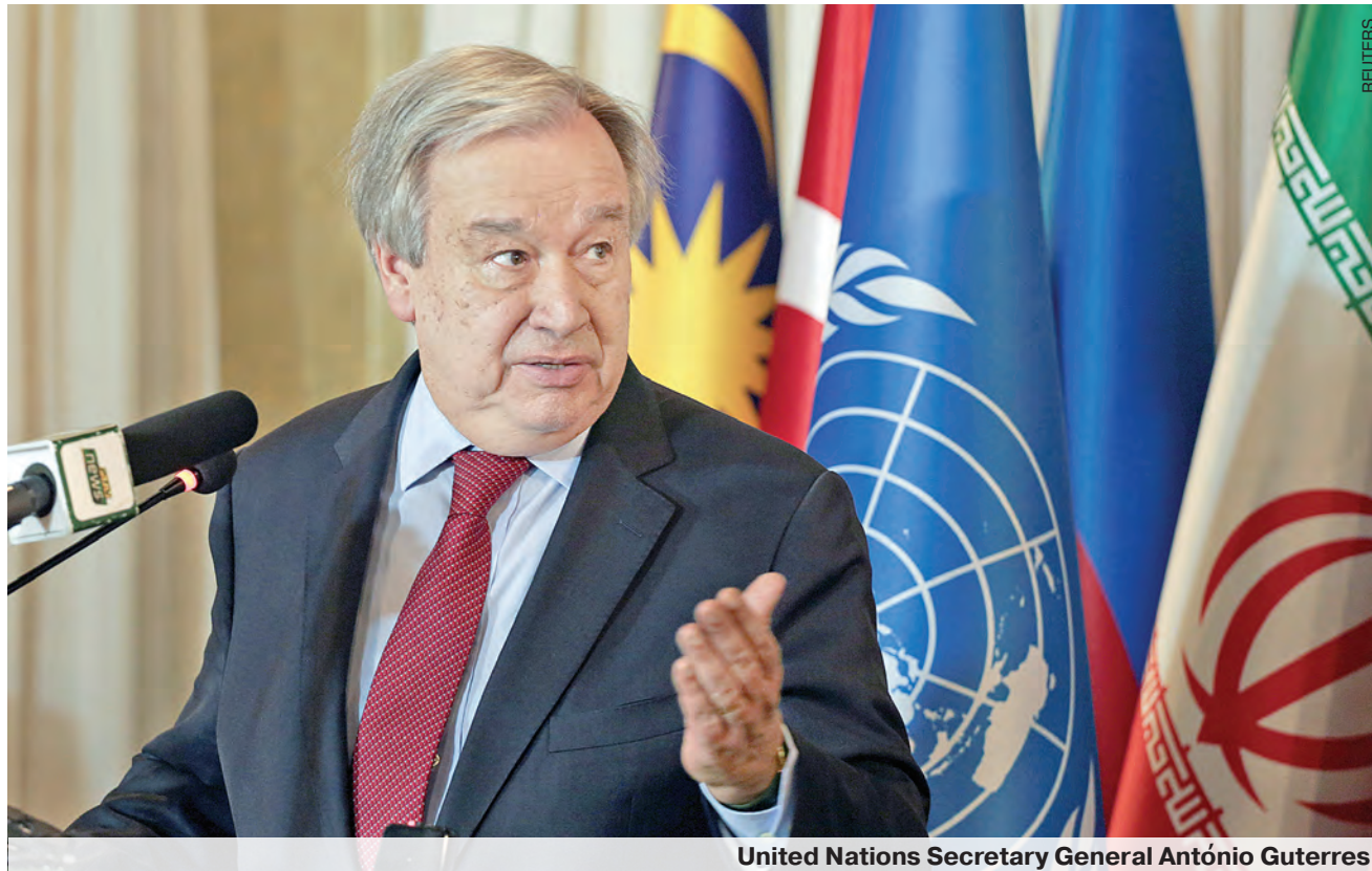
United Nations Secretary General António Guterres