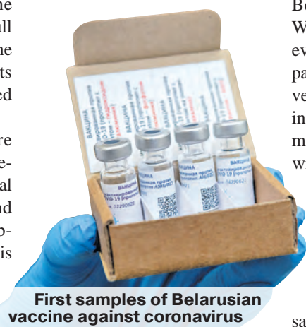
First samples of Belarusian vaccine against coronavirus

Alas, humanity is constantly faced with new infections, and the coronavirus is not the last pandemic. The situation with COVID-19 in the world has revealed the problem of unfair distribution of vaccines between