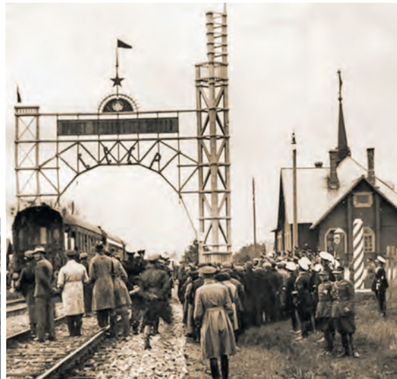
Station workers saw different delegations and famous people

On September 1st, 1939, Nazi Germany attacked Poland, and on September 17th, the Workers' and Peasants'