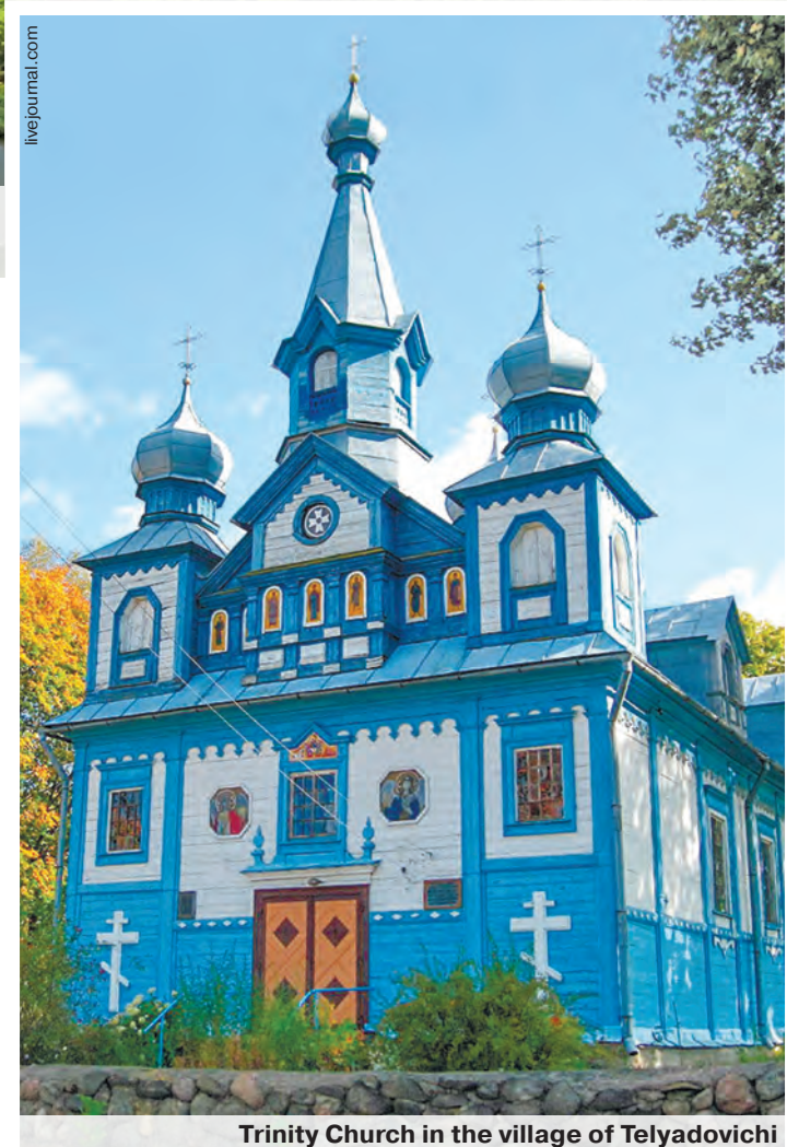
Trinity Church in the village of Telyadovichi

What was the wooden castle like? Today we can only guess. The local steep hills, covered by the rivers Mazha and Kamenka, hint that the fortifications were