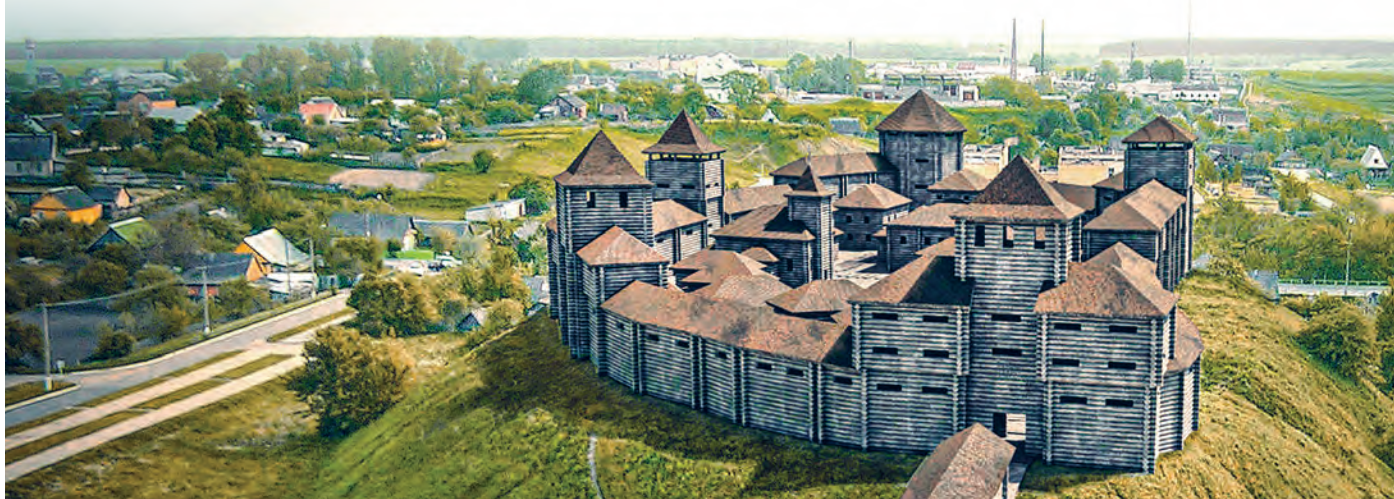
Zamkovaya Hill is now empty, but historians have a good idea of what the fortress looked like and created a realistic visualisation

In five days, the pilgrims will walk a couple of hundred kilometres and visit temples along the way. One of the most interesting points on the route is the wooden Trinity Church in the village of Telyadovichi. You can’t pass this painted beauty without bowing! It was built in 1792, decorated with rich carvings and doll turrets. Initially, the church belonged to the Uniates, then to the Catholics and only after that did it become Orthodox. The church has never closed its doors to parishioners for two hundred years.