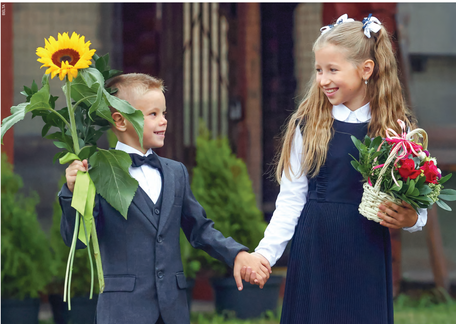
September 1st sees white hair bows for girls, bow ties for boys and excitement in the eyes of everyone

PUBLISHED SINCE FEBRUARY 2003 ● NO. 33 (895) ● THURSDAY, SEPTEMBER 2, 2021 ● WWW.SB.BY