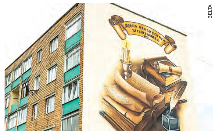
Stylish murals appeared on the facades of some houses in Kopyl

In autumn, Belarusians harvest not only grain but also cultural fields. The main September event in the country is Belarusian Written Language Day — celebrated on the first Sunday of the month. This year, the literary holiday will be hosted by the town of Kopyl in the Minsk District.