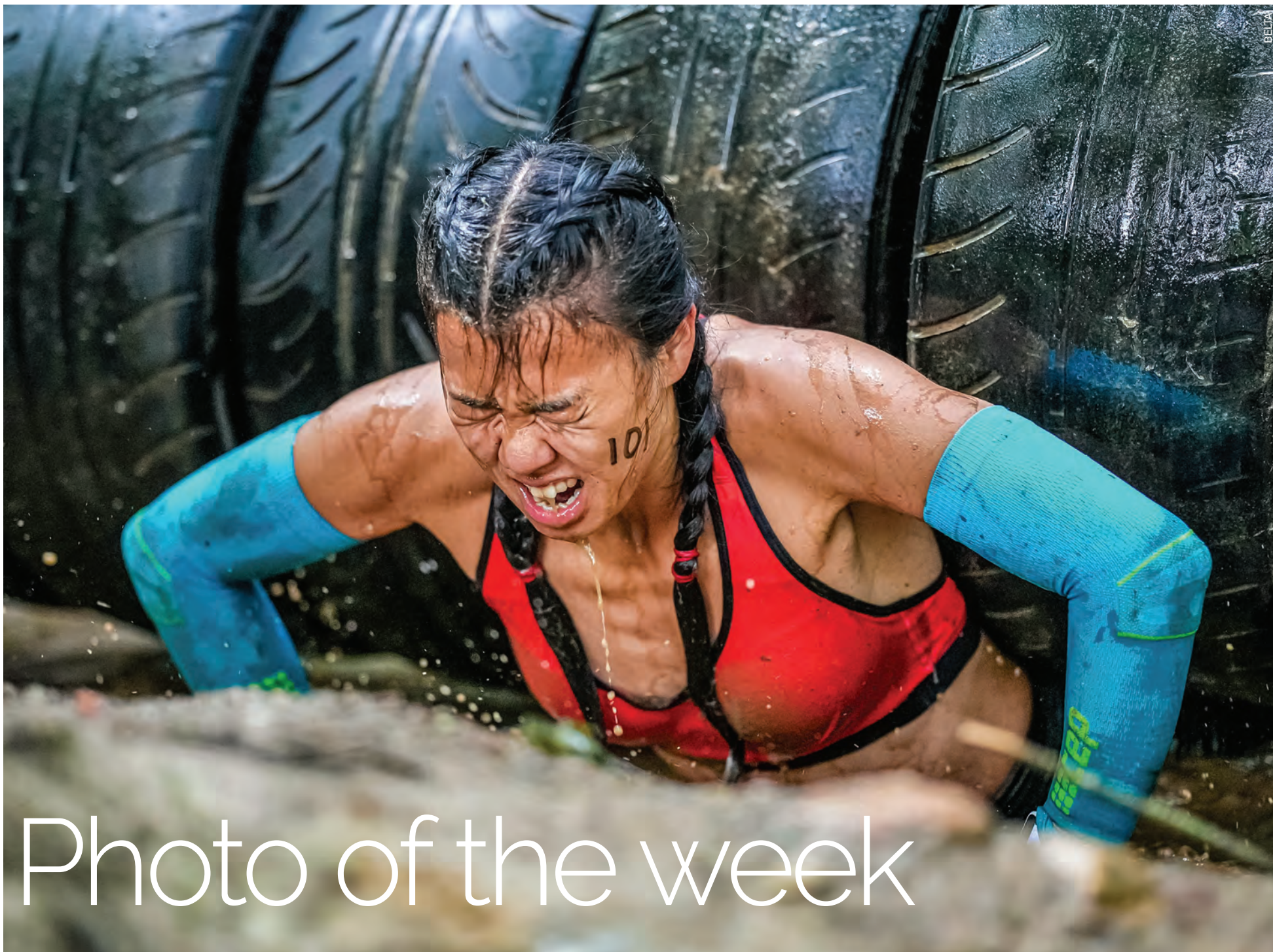
Photo of the week