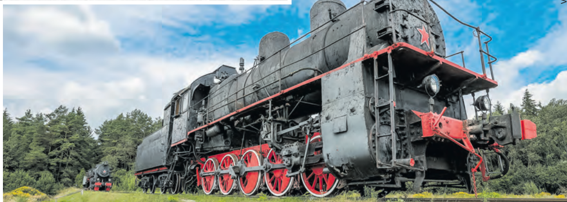
Once in Negoreloe, the trains were 'rearranged' from the broad Russian gauge to the narrower European gauge

The Poles called the annexed Belarusian lands 'eastern frontiers' and perceived them as a market for cheap labour force, a raw material appendage and a place to