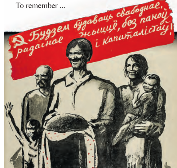
The population of Western Belarus greeted the Red Army soldiers as liberators