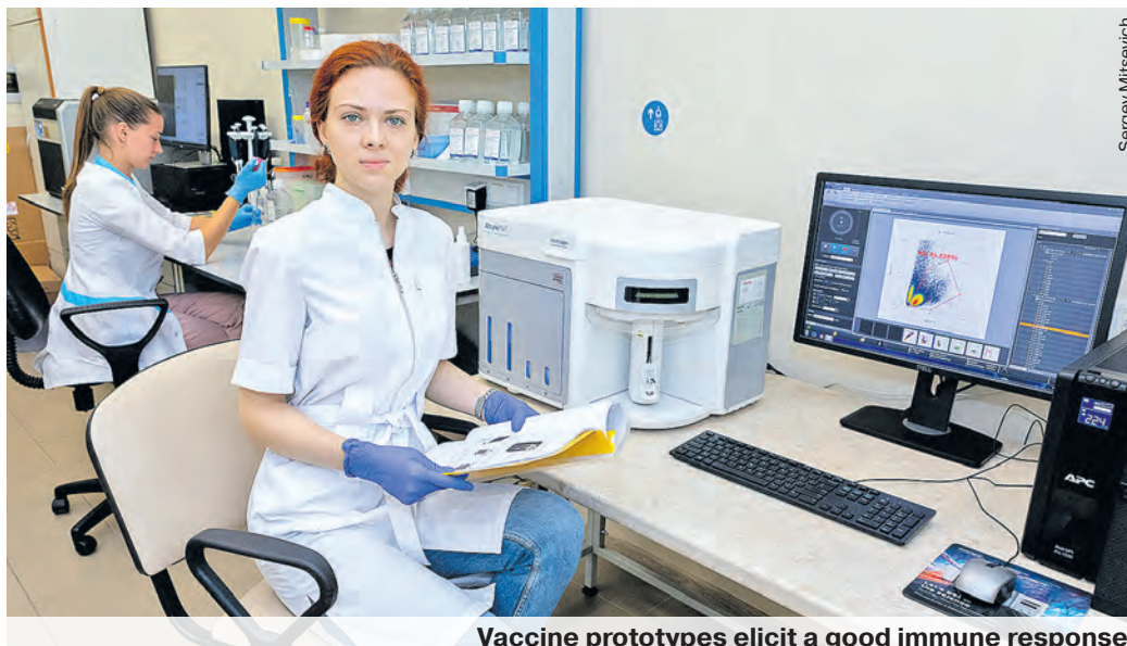
Vaccine prototypes elicit a good immune response

“It’s almost certain that a completely different isolate will be used when a vaccine is released, or even several isolates in one vaccine. Work on candidate options continues. Most importantly, we have shown that all the proposed isolates to one degree or another cause a cellular immune response and the production of antibodies,” stresses the scientist.