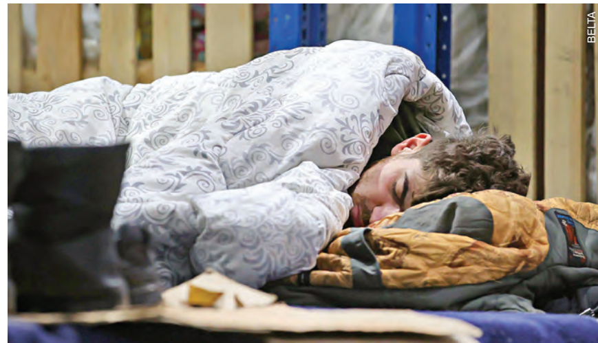
Materials prepared with aid of information agencies

Moreover, asylum seekers and refugees from the Middle East stranded along the Belarusian-Polish and Belarusian-Lithuanian border, are experiencing distress and suffering in anticipation of a humanitarian corridor to move to Germany.