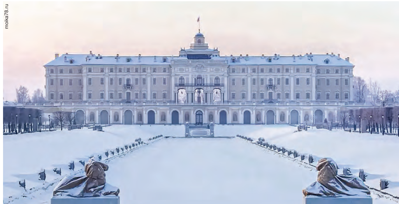
One-on-one meeting between Aleksandr Lukashenko and Vladimir Putin took place in the Konstantinovsky Palace in Strelna

"As for the economy, I would like to note that our experts believe that the economy of Belarus is in good condition."