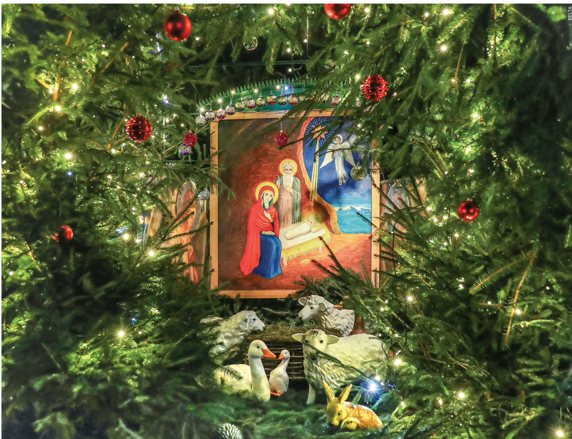
At Christmas, nativity scenes appear in churches, symbolising the place where Jesus Christ was born. In St. Nicholas Garrison Cathedral in the Brest Fortress

PUBLISHED SINCE FEBRUARY 2003 ● NO. 1 (911) ● THURSDAY, JANUARY 6, 2022 ● WWW.SB.BY