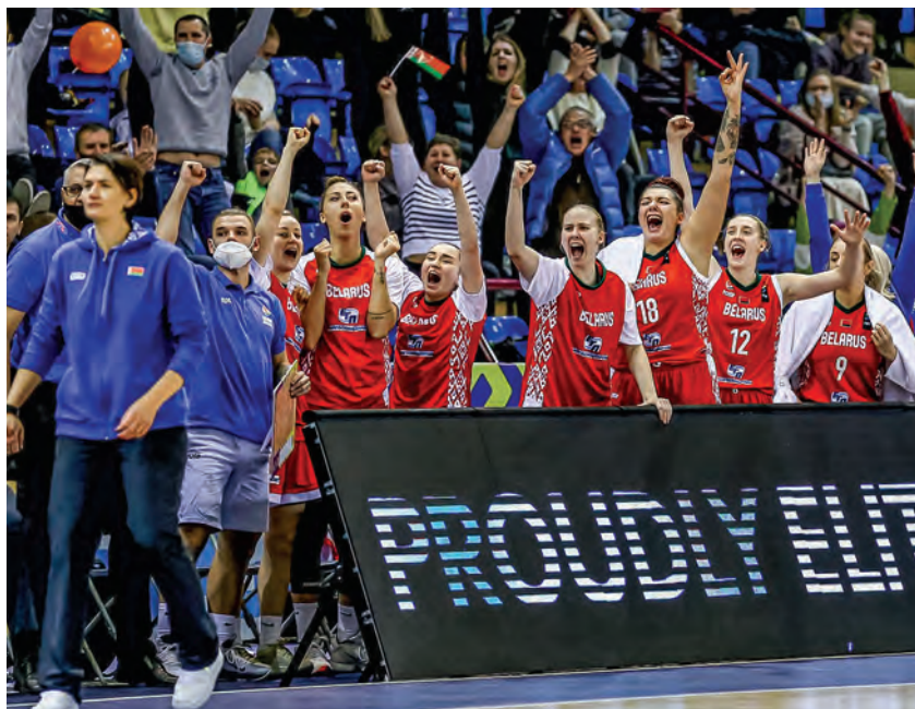
Girls from the basketball team have no rivals in team sports