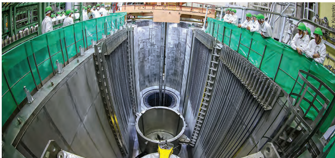
During the loading of the first batch of nuclear fuel into the reactor of the second power unit of the Belarusian NPP

(December 22nd, 2021, from the congratulations to workers and veterans of the power industry on their professional holiday: Power Engineer's Day.)