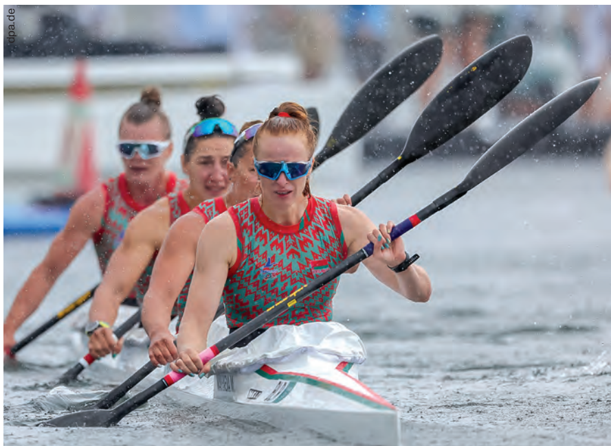
Silver crew of the canoe four

But all this will come later. In the meantime, we are waiting for the Winter Games in Beijing-2022 and, of course, dreaming. We are dreaming that the new year will turn out to be at least no worse than the past and will bring us many magical moments, which it will be very pleasant to remember later.