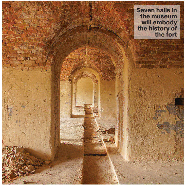
Seven halls in the museum will embody the history of the fort

Large-scale restoration works have been launched at the East Fort of Brest Fortress. In less than a year, a new museum will open here with seven exhibition halls. Specialists and builders from the Brestrestavratsiya enterprise are currently working on the site, with the project being financed from the Union State budget.