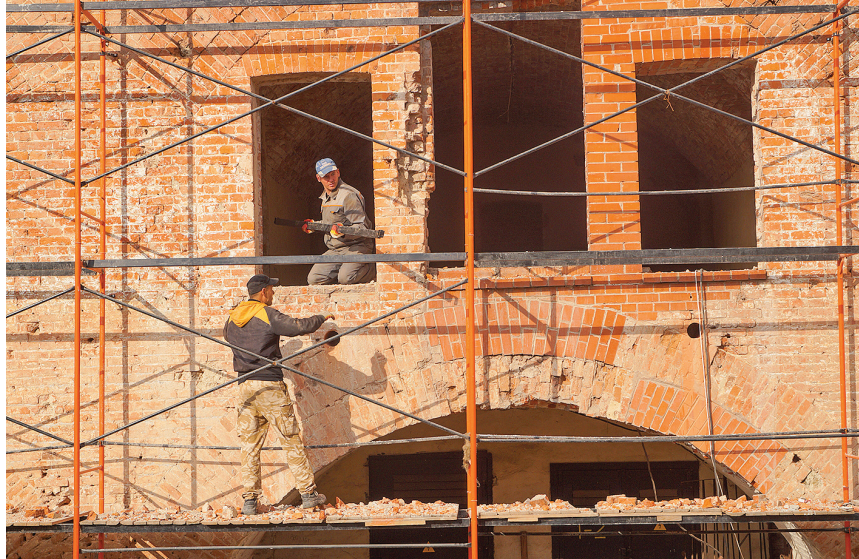
The project is not simple, and there's much work ahead

The foreman says the project is far from simple and much work lies ahead. In addition, from time to time, the builders still find ammunition from the war, "In the short time that we have been working here, there have been five such cases. Once the workers dismantled the concrete floor and began to level the ground when they found five F-1 grenades and work was suspended. Military engineers from the combat engineer and pyrotechnic group searched the area and found another 268 similar gre-