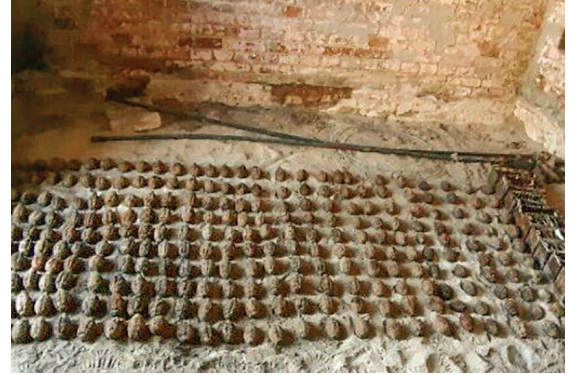
From time to time, builders find ammunition from the war

In their attempt to occupy the fort, the Germans dropped smoke bombs, used tear gas and assault guns. With no result. The East Fort was destined to become the only place in the fortress that German