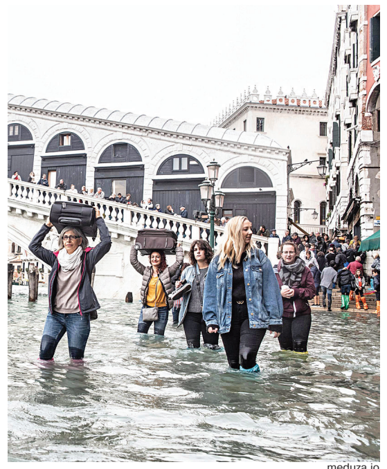
Materials prepared with aid of information agencies

Sixty people were left isolated from their homes in San Pietro after part of the only road to their houses collapsed. A water pipe was also broken leaving them without water.