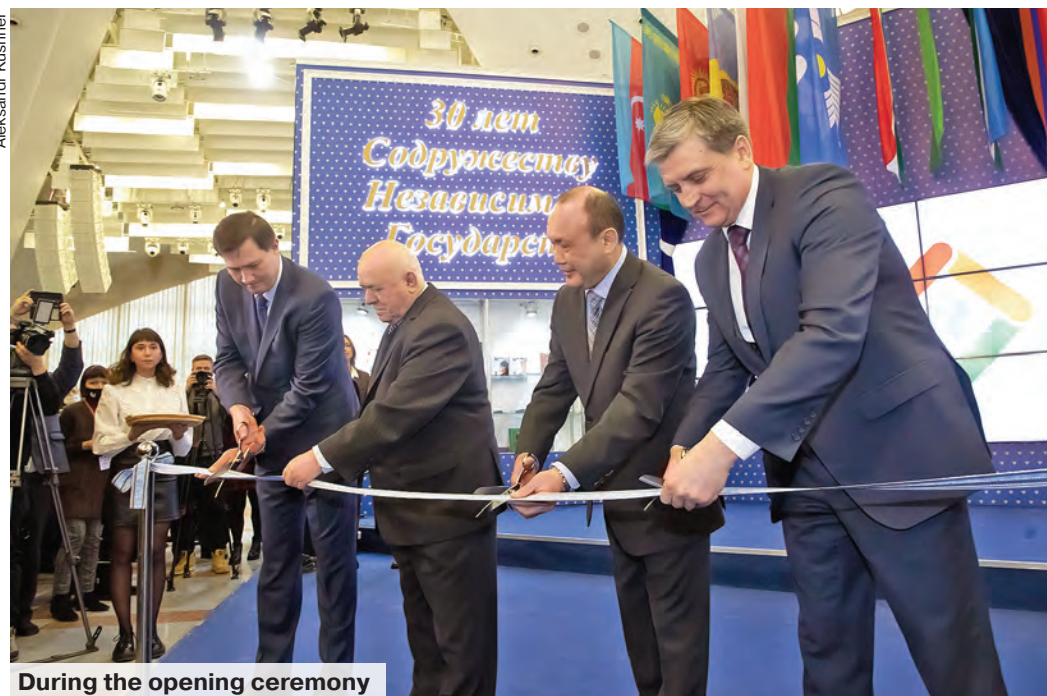
During the opening ceremony