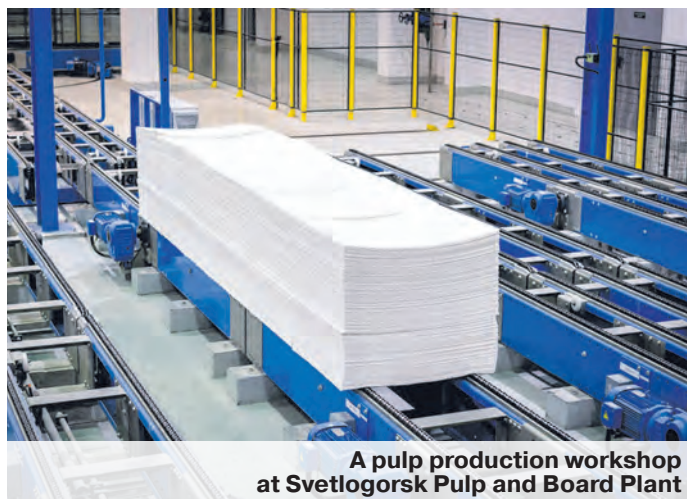
A pulp production workshop at Svetlogorsk Pulp and Board Plant

(China, Europe). Quite a lot of the output is still sold domestically. There are no problems with sales at present. The quality is very high. The colour is sufficient to encourage European consumers to buy Belarusian pulp," the official noted.