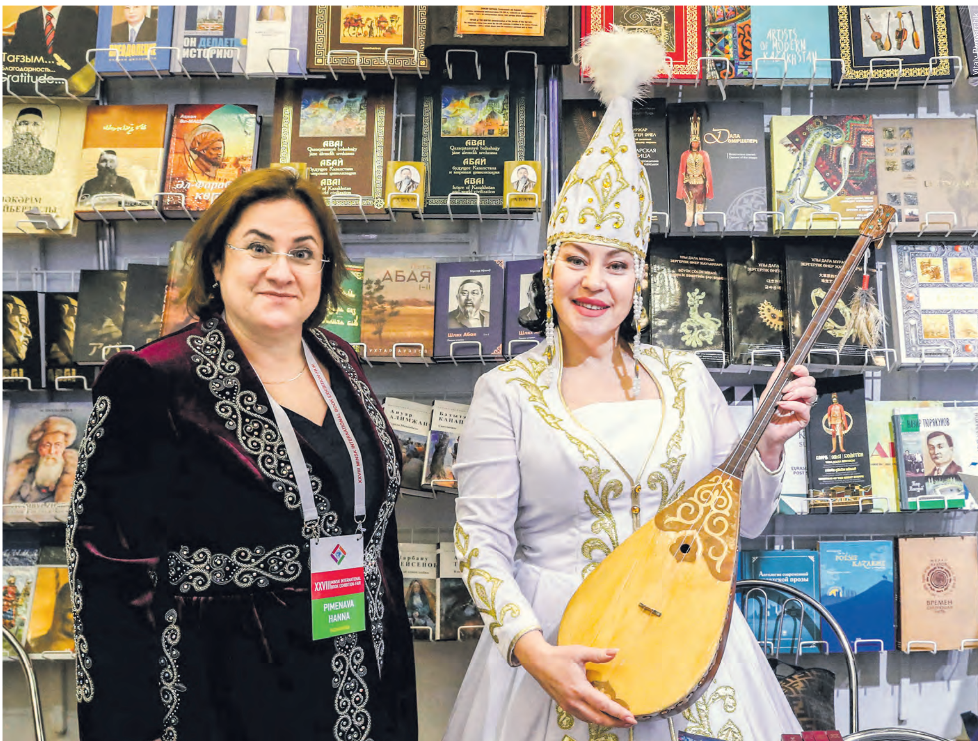
Kazakhstan's exposition at 28th Minsk International Book Trade Fair

PUBLISHED SINCE FEBRUARY 2003 ● NO. 07 (869) ● THURSDAY, FEBRUARY 25, 2021 ● WWW.SB.BY