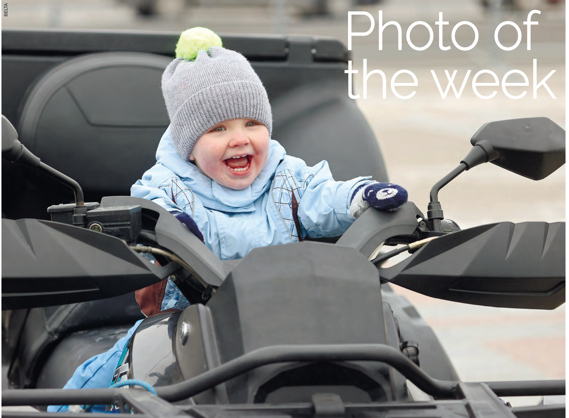
Photo of the week