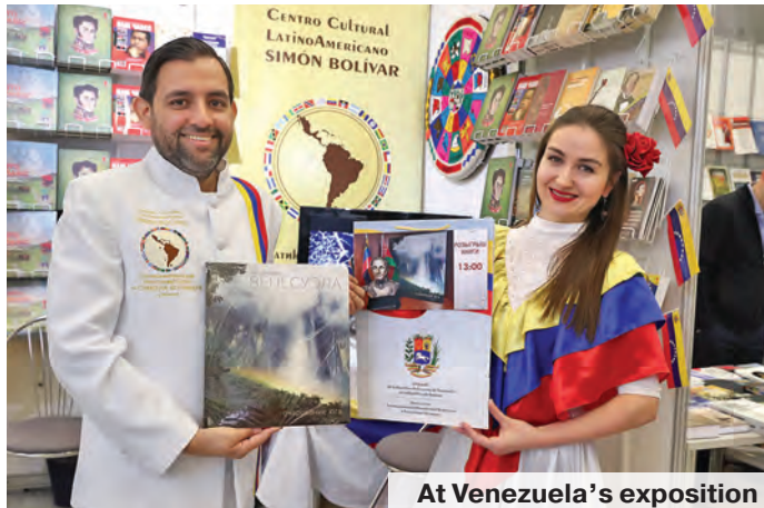
At Venezuela’s exposition