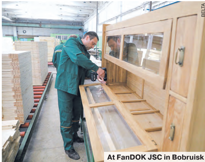
At FanDOK JSC in Bobruisk

Among the major sales markets are Russia (over 30 percent of total sales), Poland, Ukraine, China and Lithuania. Exports to non-CIS markets are steadily increasing, by almost 11.5 percent in 2020.