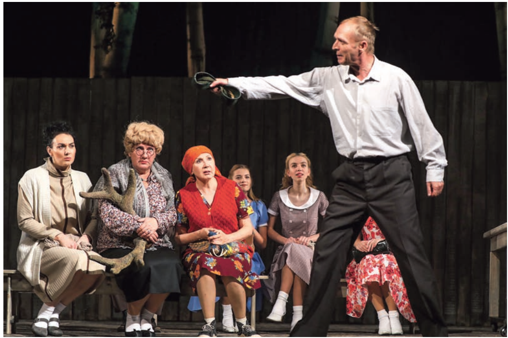
A scene from Once Again About Love

clear imagery of Vasily Shukshin, it's easily possible to recognise oneself, as well as neighbours, friends and colleagues who we meet daily at the shops, on public transport and at work. Although the atmosphere of the play remains set in the 1960s and 1970s, the theme of the production is timeless. The recognition of pure love will definitely be of interest to young and old alike.