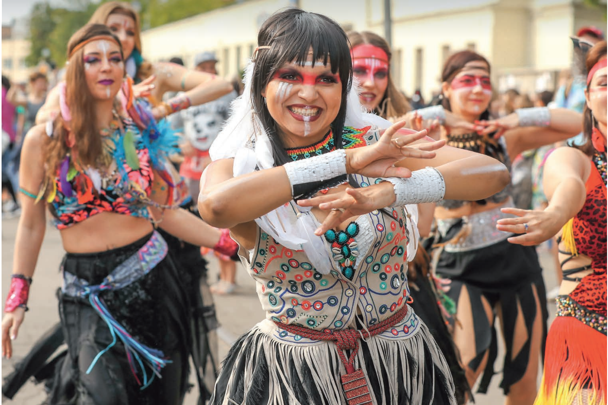
Flamboyant carnival crowns Vulica Brasil Festival in Minsk