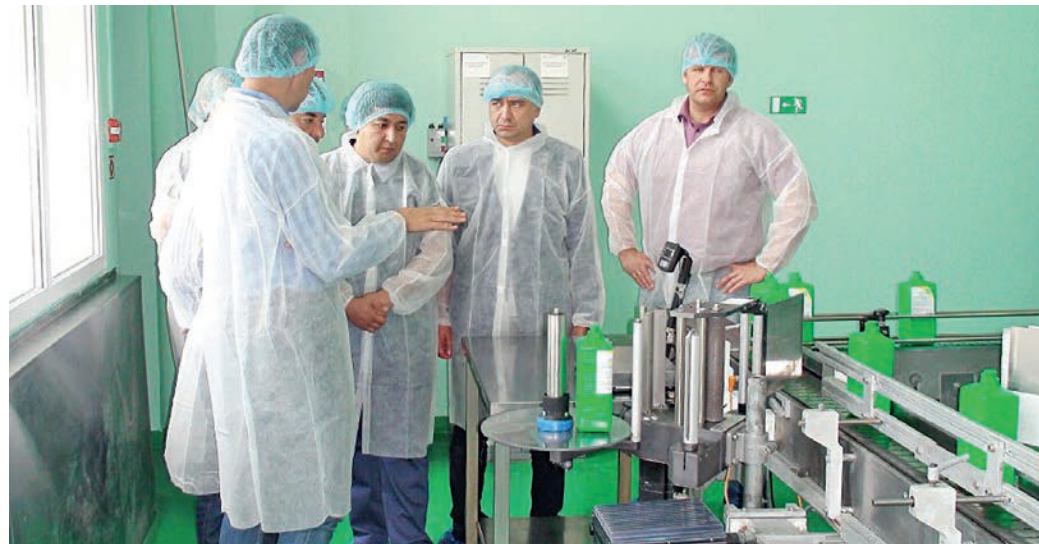
Partners discuss aspects of co-operation

“The specifications for the disinfectants are ready and per-