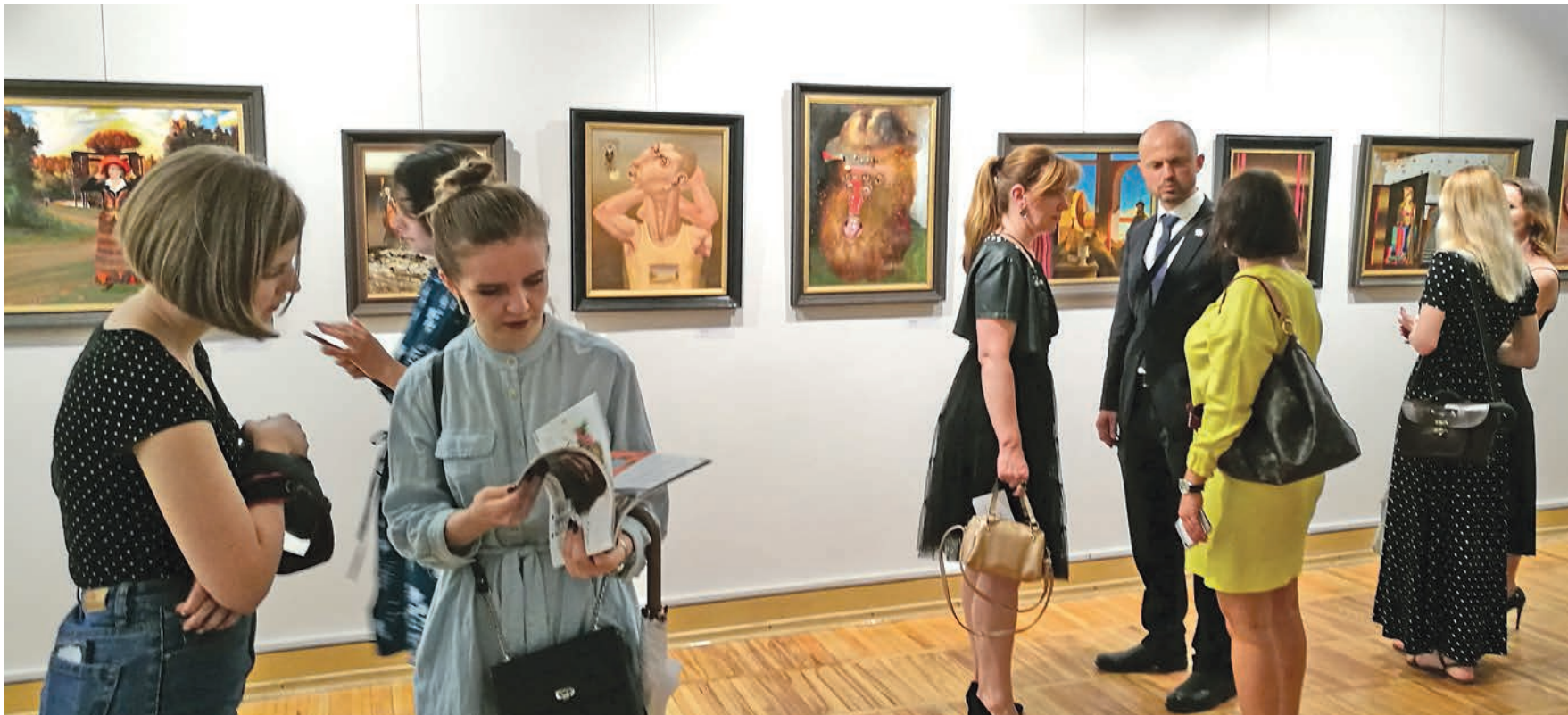
At the exhibition of Georgy Skripnichenko's works at National Historical Museum