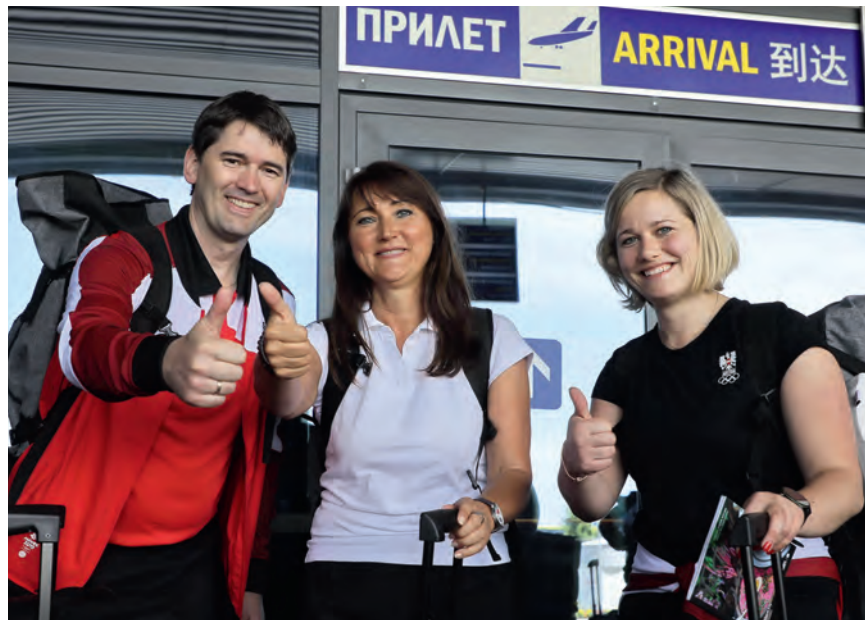
The number of tourists coming to Belarus through Minsk National Airport increased by almost 27 percent in 2018; since the visa-free period was extended to 30 days, this number has risen by 43 percent.

In line with Presidential Decree No. 8, as of January 9th, 2017, citizens of 80 countries received the right to ‘air visa-free’ movement for up to 5 days.