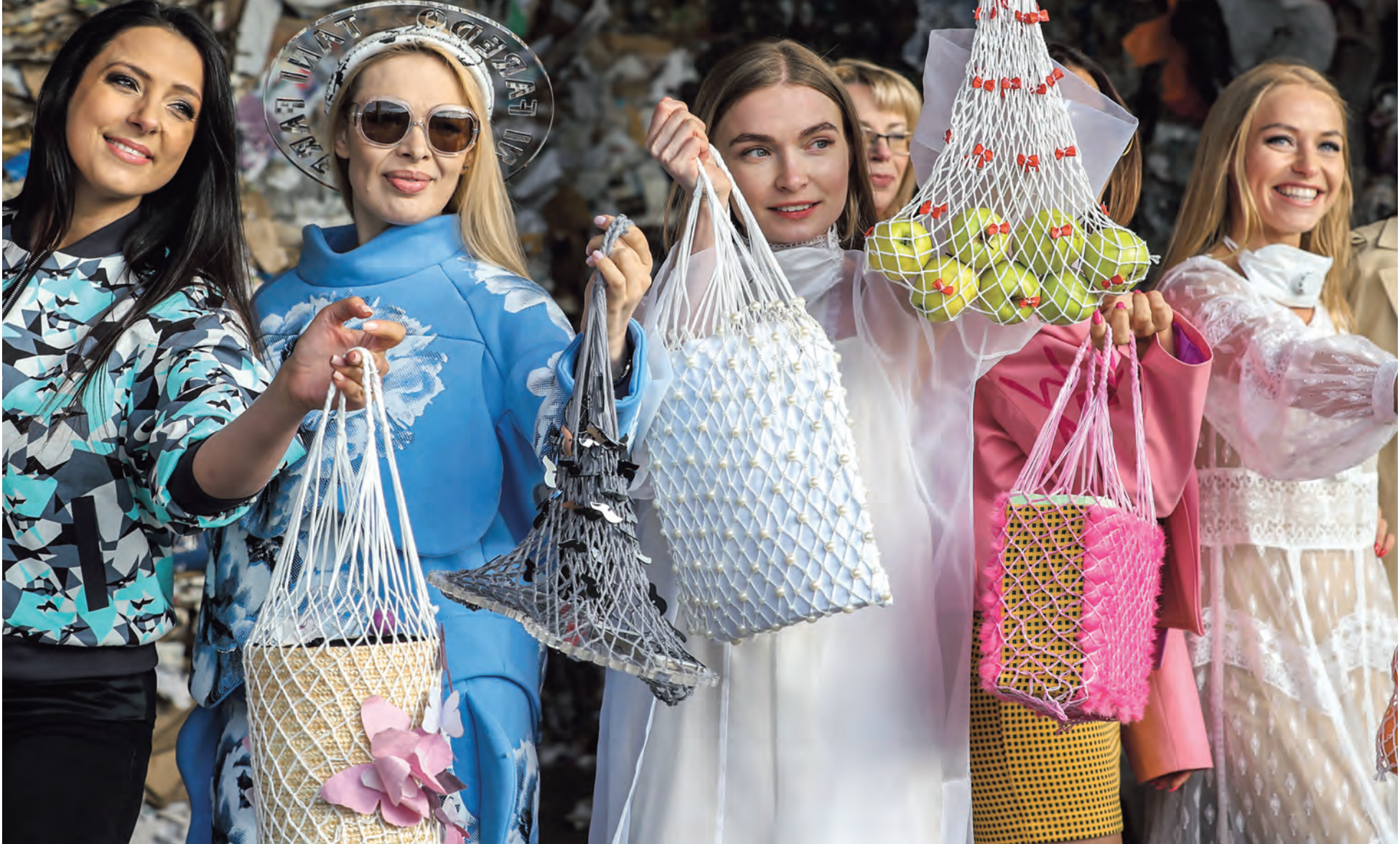
An unusual fashion show — held at Minsk's largest landfill — attracts attention to the plastic waste problem