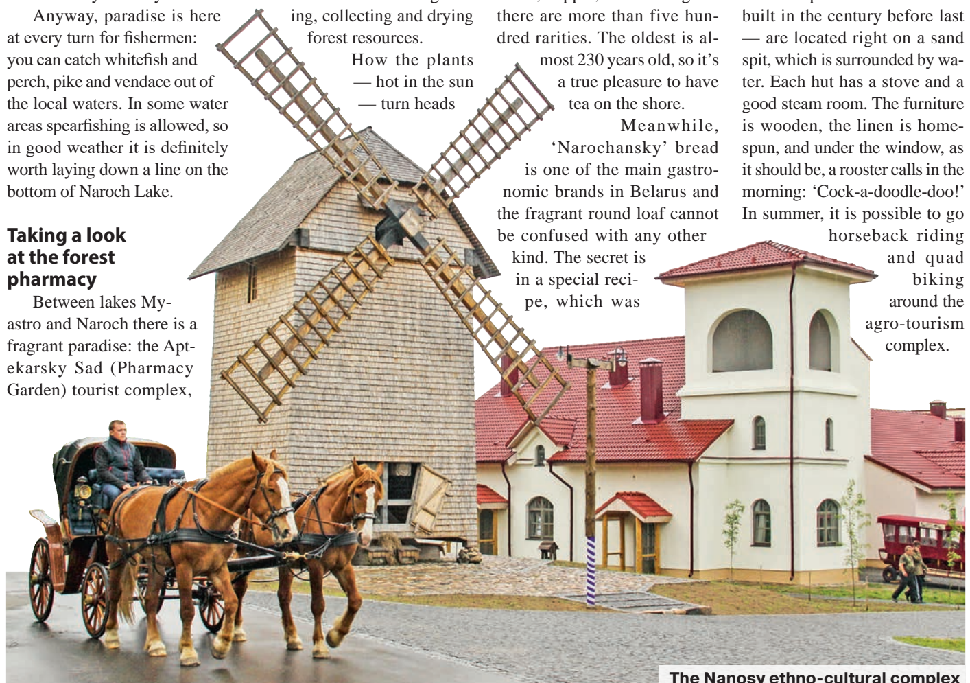
The Nanosy ethno-cultural complex

Where there is a lake or a river, there must be a bathhouse. This is our Slavic rule. The most unusual one on Naroch Lake is situated in the Nanosy ethno-cultural complex. A dozen huts — built in the century before last — are located right on a sand spit, which is surrounded by water. Each hut has a stove and a good steam room. The furniture is wooden, the linen is homespun, and under the window, as it should be, a rooster calls in the morning: 'Cock-a-doodle-doo!' In summer, it is possible to go horseback riding and quad biking around the agro-tourism complex.