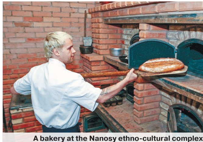
A bakery at the Nanosy ethno-cultural complex

According to the legend, the lakes (and there are about forty of them in the National Park) appeared from the fragments of a broken mirror. Naroch is almost 80 square kilometres of water. You can't even see the banks! The transparency and cleanliness are amazing: in summer it's possible to see what's happening at a depth of five to seven me-