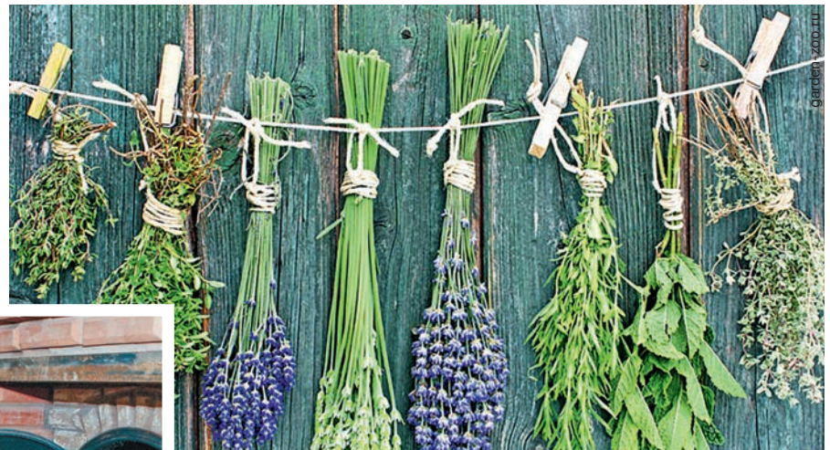
Herb aromas at the Aptekarsky Sad tourist complex are truly mesmerising