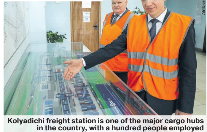
Kolyadichi freight station is one of the major cargo hubs in the country, with a hundred people employed

It takes 12-15 days for a train to reach China (40-60