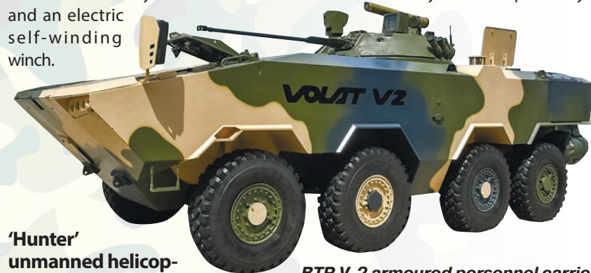
▲ BTR V-2 armoured personnel carrier

The system can be installed on any car chassis, which makes it possible to increase its mobility and ensure fast delivery to the required location.