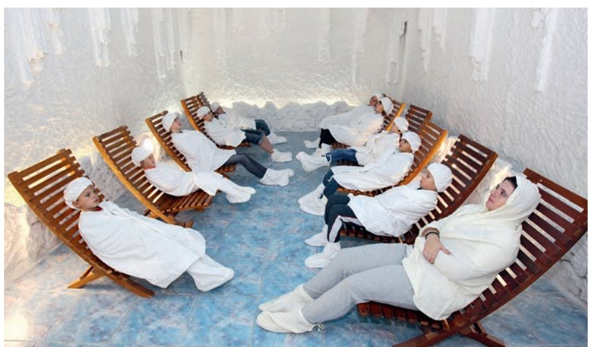
Not only Belarusians but also foreign tourists rush to relax at Naroch health resorts

Naroch — located 150 kilometres from Minsk — is called the pearl on the map of blue-eyed Belarus, with local places gaining spa fame even a hundred years ago