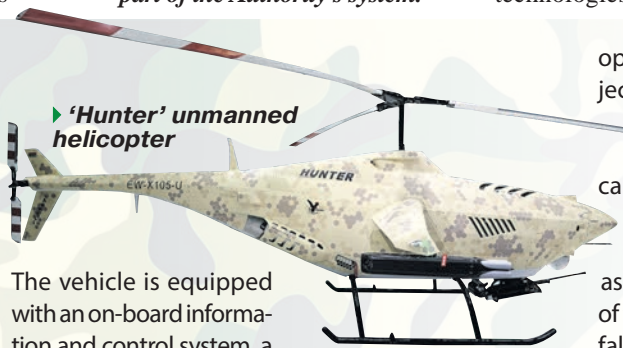
► 'Hunter' unmanned helicopter

For the first time, a new development by the Minsk Wheel Tractor Plant has been shown to the public: the BTR V-2 armoured personnel carrier. The 22-tonne combat vehicle can confidently respond when weapons of mass destruction are used, swim at a speed of up to 10 km/h and accelerate up to 110 km/h on land. It is equipped with a powerful 550HP engine, automatic transmission, a forced differential lock and a diesel generator set that provides its additional autonomy. The crew consists of three people, while eight motorised riflemen could be placed in the troop compartment in the rear. There is a ramp in the hull at the back for convenient boarding and disembarking of soldiers. The design of the armoured body provides reliable protection from bullets and shrapnel, explosive devices.