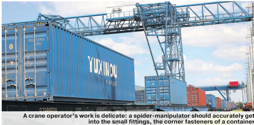
A crane operator's work is delicate: a spider-manipulator should accurately get into the small fittings, the corner fasteners of a container