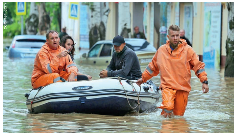
Materials prepared with aid of information agencies

"We are first evacuating the people from flooded areas in the city centre and those located near rivers," added Ms. Pavlenko. Images circulating on social media showed water rushing through Yalta's streets, sweeping aside cars and reaching up to the second story of buildings.