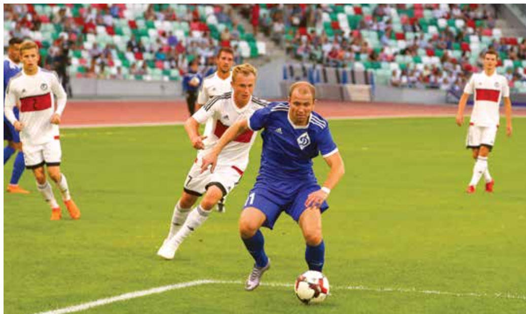
Moment of game at renewed Dinamo Stadium

Minsk and Brest Dinamo teams defeat national squad of Belarusian clubs (4:3) in first football match at revamped Dinamo Stadium