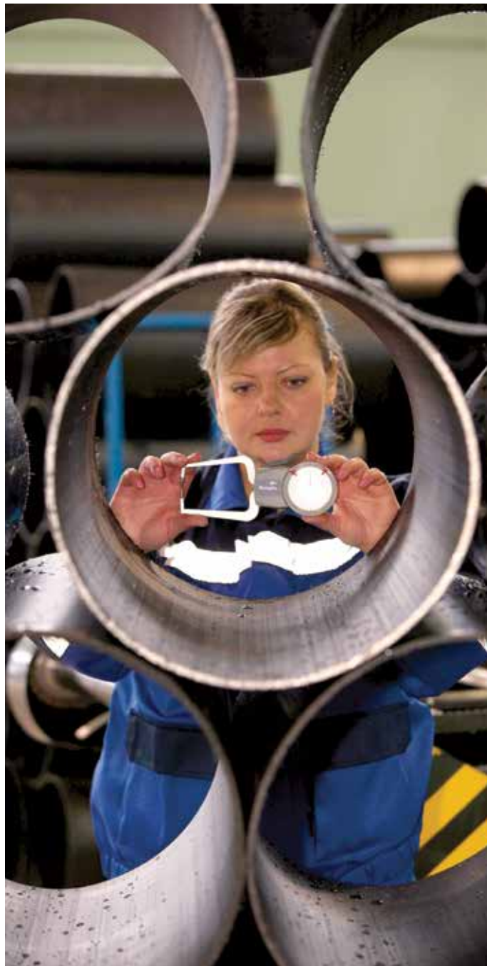
At foreign venture Salling Plast Production Orsha

Enterprises' own assessment of their current economic state is even more optimistic, with 96.3 percent of respondents calling this positive or satisfactory. Only 3.7 percent were displeased: the