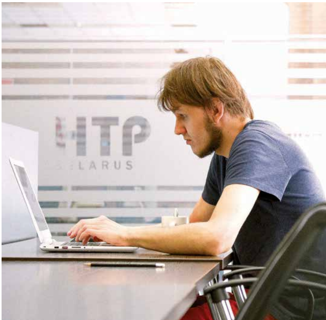
HTP residents acquire new opportunities

trol systems, aviation and space technologies, e-sports, crypto-currency exchanges and more. Importantly, in the product model of the business (which the decree supports), several specialists of different specialisations account for a single programmer: business analysts, marketing specialists, translators, designers. In