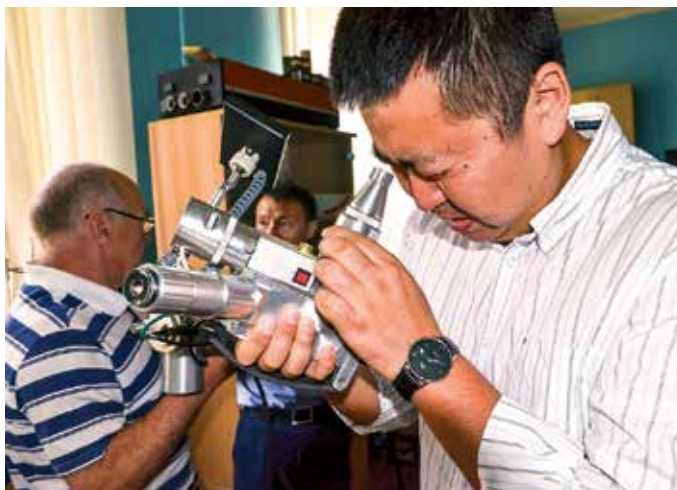
Practical aspect of the seminar

The scientific programme of the seminar includes reports on fundamental and applied aspects of modern materials sciences, the physical and chemical qualities of nano- and metamaterials, researches on the structure and qualities of nanocomposite coatings, and technologies for working vari-