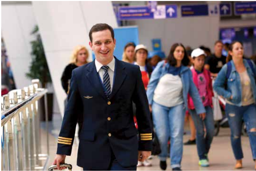
At Minsk National Airport