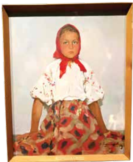
On the Bench by Kharitonenko (1963)

Exhibition at National Art Museum presents two sections united under common theme of childhood, as explored via photographic shots, paintings and graphic works