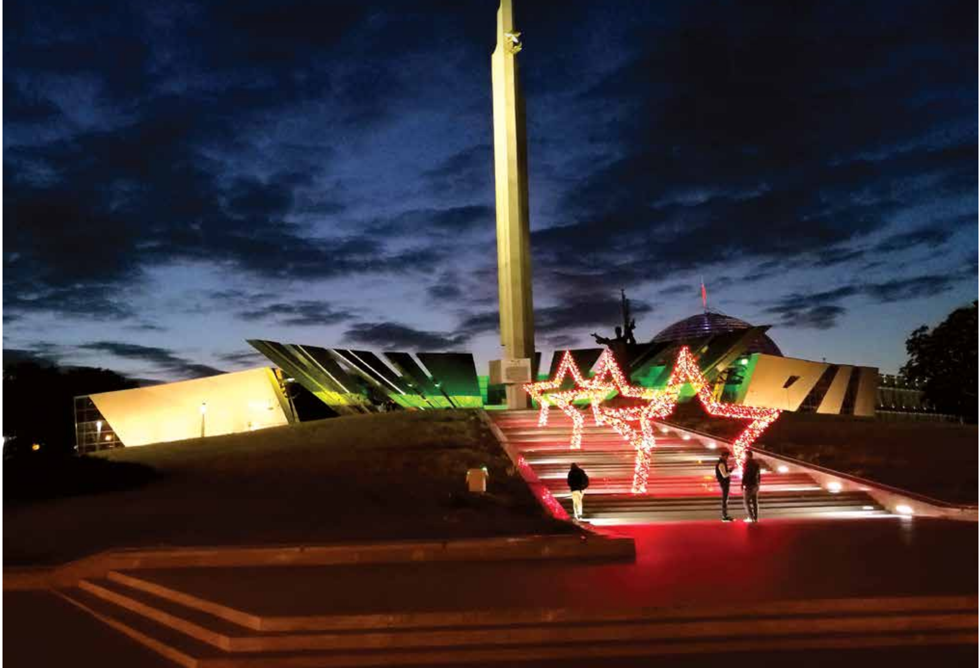
Minsk – Hero-City Memorial on the eve of the holiday (July 3rd) dedicated to liberation of Minsk in the Great Patriotic War