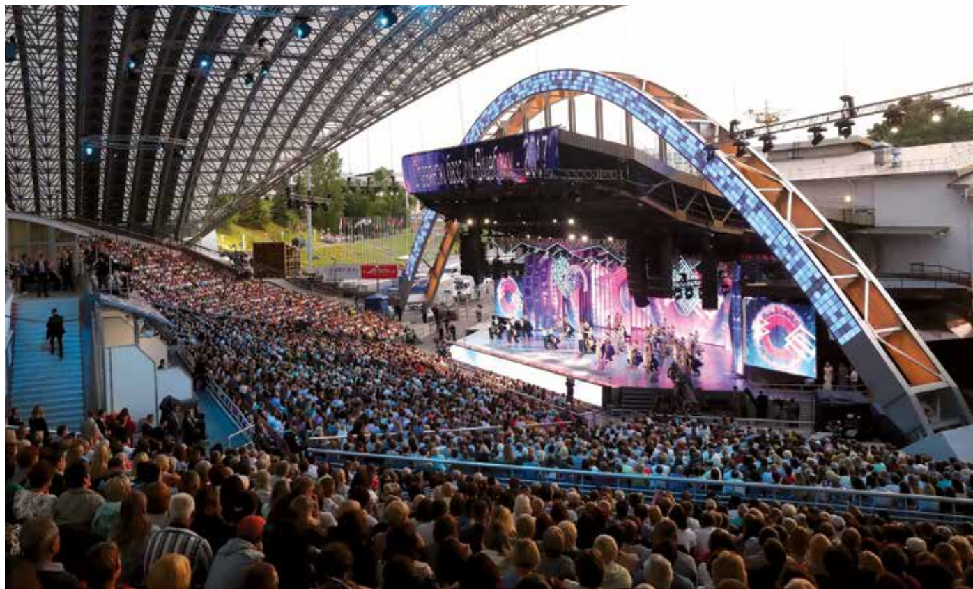
At last year's Slavianski Bazaar in Vitebsk Festival of Arts