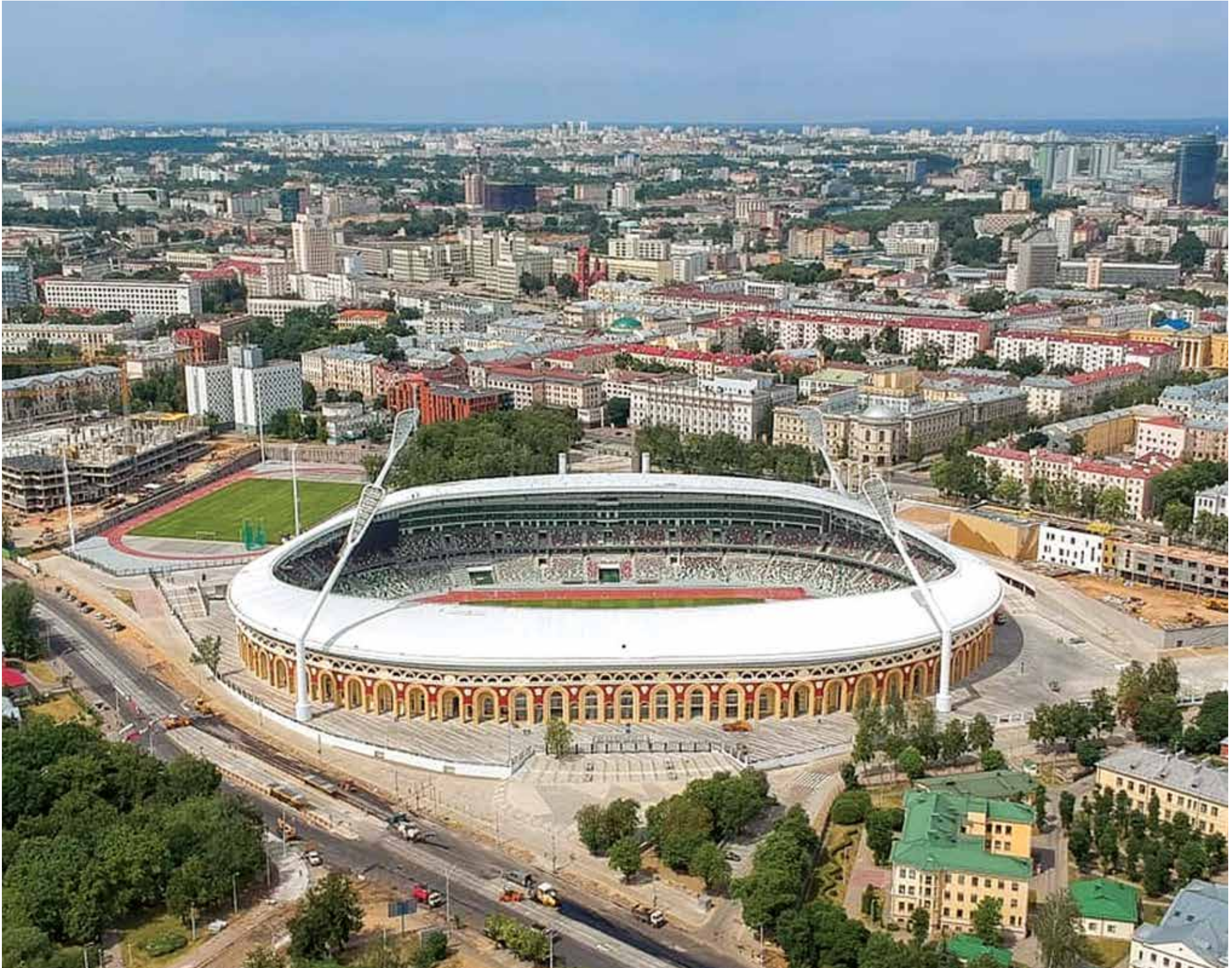
Renewed Dinamo Stadium in Minsk today

PUBLISHED SINCE FEBRUARY 2003 ● NO. 24 (742) ● THURSDAY, JUNE 28, 2018 ● WWW.SB.BY