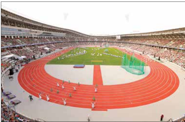
During stadium solemn opening

specialists were employed in the restoration and construction, using cutting-edge technologies. They preserved the historical foundations while making the stadium up-to-date and high-tech. Now, we can proudly invite famous athletes from all over the world to come here."