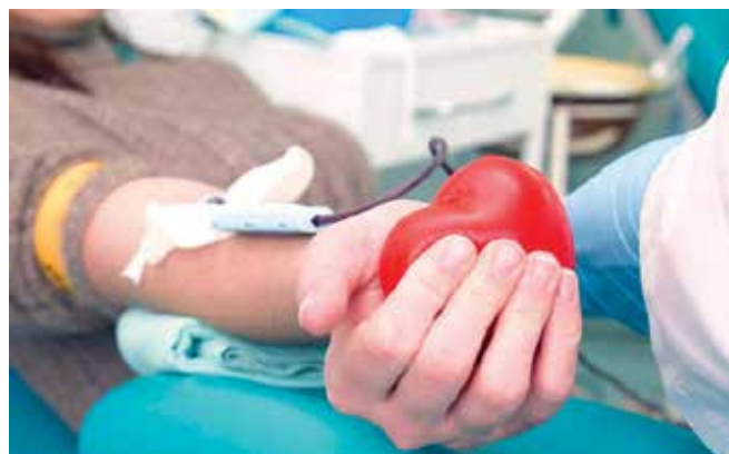
Blood donorship saves lives

2011, only kept national blood stocks from voluntary and free blood donations. In forty countries, under 25 percent of national blood reserves were received from voluntary donors, given free of charge. The World Health Organisation has a goal of all countries receiving voluntary, free donorship by 2020. Its recommendation is significant