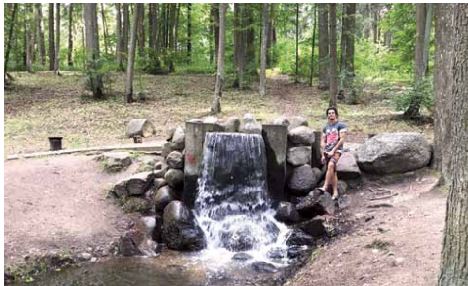
In the Belarusian countryside