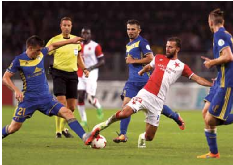
Return match at Borisov-Arena

In the second round of the qualification, BATE footballers defeated Yerevan's Alashkert — 1:1 (at home) and 3:1 (away). Now, the champions of Belarus will have to fight for entrance into the