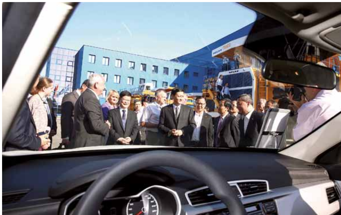
Chinese delegation at BelAZ

erful trade-economic ties. To achieve this, Minsk suggests reinforcing interaction across a range of areas, including direct investments into the Great Stone Park, with construction of new high-tech enterprises: the enterprises of tomorrow.