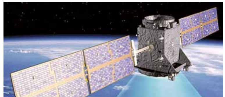
Everything seen from space

A new, space branch has formed in Belarus over this time, using Belarus-made equipment for satellites. Peleng enterprise has a portfolio of orders for space, and Integral JSC is