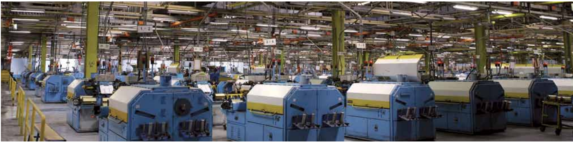
It's important in today's world for production to be high-tech and goods primarily export-oriented