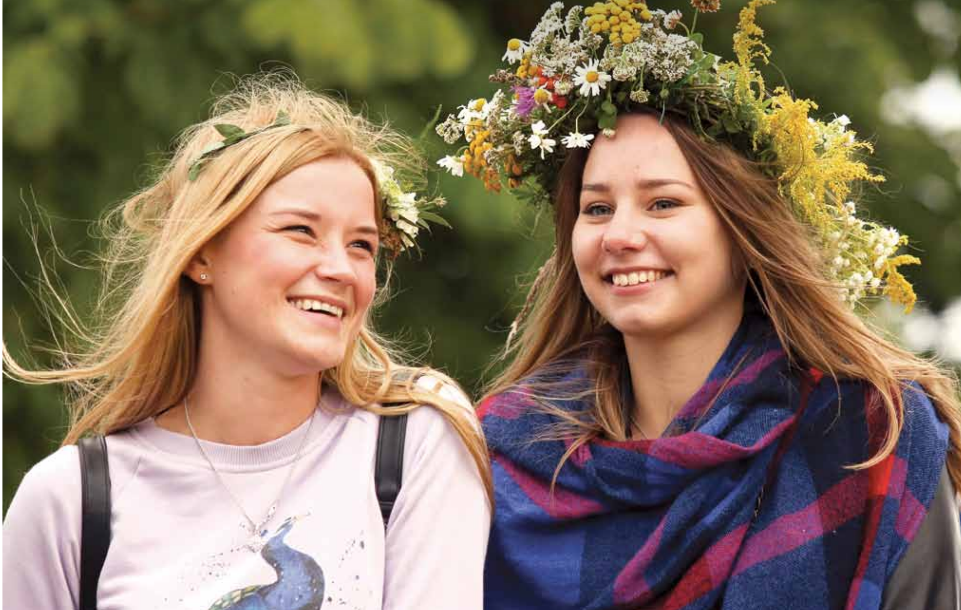
Minsk's Dreamland Park hosts Freaky Summer Party art picnic