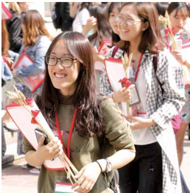
Friendly meeting of Chinese students