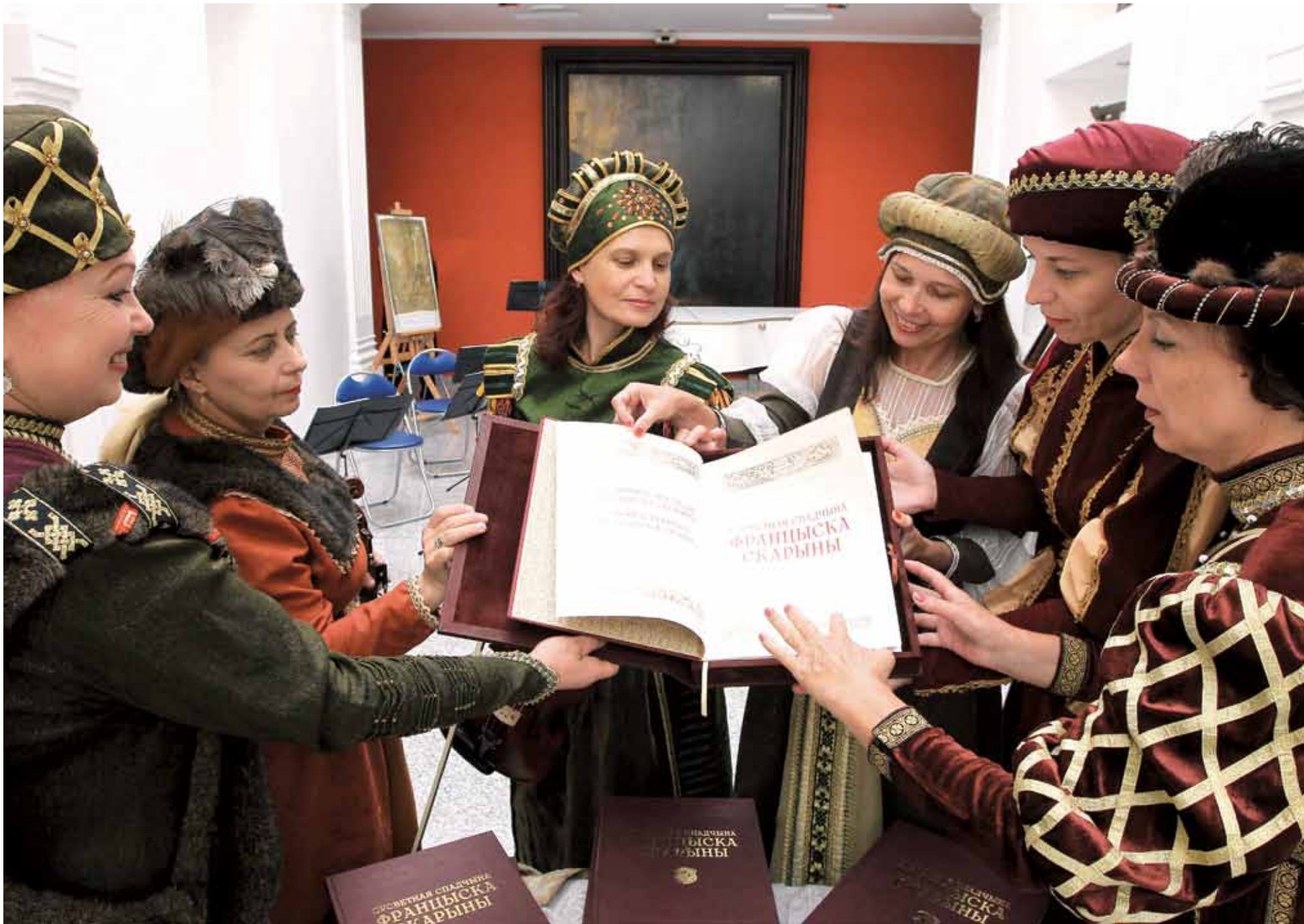
During the presentation of the book The World Heritage of Francysk Skaryna

PUBLISHED SINCE FEBRUARY 2003 ● NO. 30 (700) ● THURSDAY, AUGUST 10, 2017 ● WWW.SB.BY