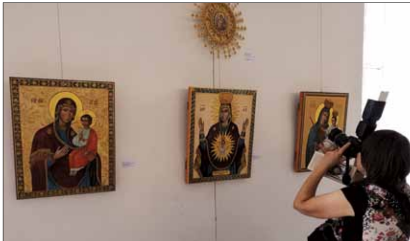
Opening of the exhibition was interesting and respectful

details. Professional painters from Belarus, Poland and Ukraine decided to lay the foundation of the museum of ancient icons united by the prayers of three faiths. They are confident that the idea of preserving the best examples of icon painters of the Grand Duchy of Lithuania will be expanded. The collection now boasts around 20 icons of the Mother of God — Yurovichi, Maryina Gorka, Zhirovichi, Logoisk, Minsk, Novogrudok, Malorita... Some images were chosen by the painters for the theme of philosophical contemplation on forgiveness and finding one's own way to God.