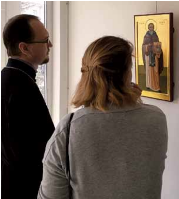
Face to face with the image

details. Professional painters from Belarus, Poland and Ukraine decided to lay the foundation of the museum of ancient icons united by the prayers of three faiths. They are confident that the idea of preserving the best examples of icon painters of the Grand Duchy of Lithuania will be expanded. The collection now boasts around 20 icons of the Mother of God — Yurovichi, Maryina Gorka, Zhirovichi, Logoisk, Minsk, Novogrudok, Malorita... Some images were chosen by the painters for the theme of philosophical contemplation on forgiveness and finding one's own way to God.