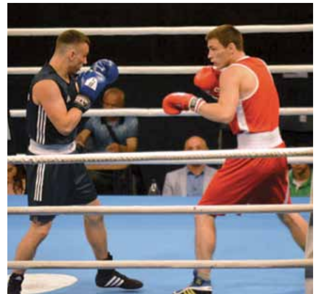
Emotions run high in the ring

This year, more than 100 boxers competed for medals, representing 15 countries: Azerbaijan, England, Armenia, Belarus, Tunisia, Greece, Kyrgyzstan, Poland, Russia, Tajikistan, Turkmenistan, Ukraine, Wales, Scotland and Estonia. For the first time in all the years of the event female entrants took part in the tournament.