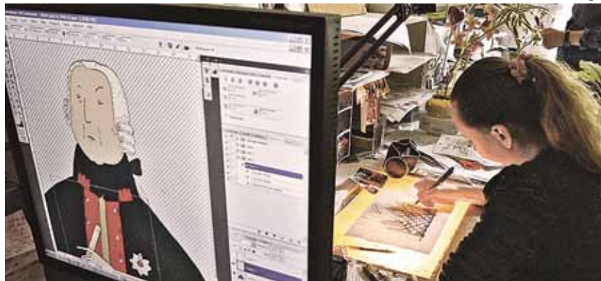
During the work on the Toshka i Kompaniya animated film

ary past. We're now working on the 'Stars of the Seventh Sky' animated musical, whose characters are voiced by Belarusian pop celebrities. This is the first project of the kind in our country and I can already show you a fragment [colourful characters appear on the screen, singing in surprisingly familiar voices]. The film is to be full-length and, in 2019, we plan to premiere it in cinemas.