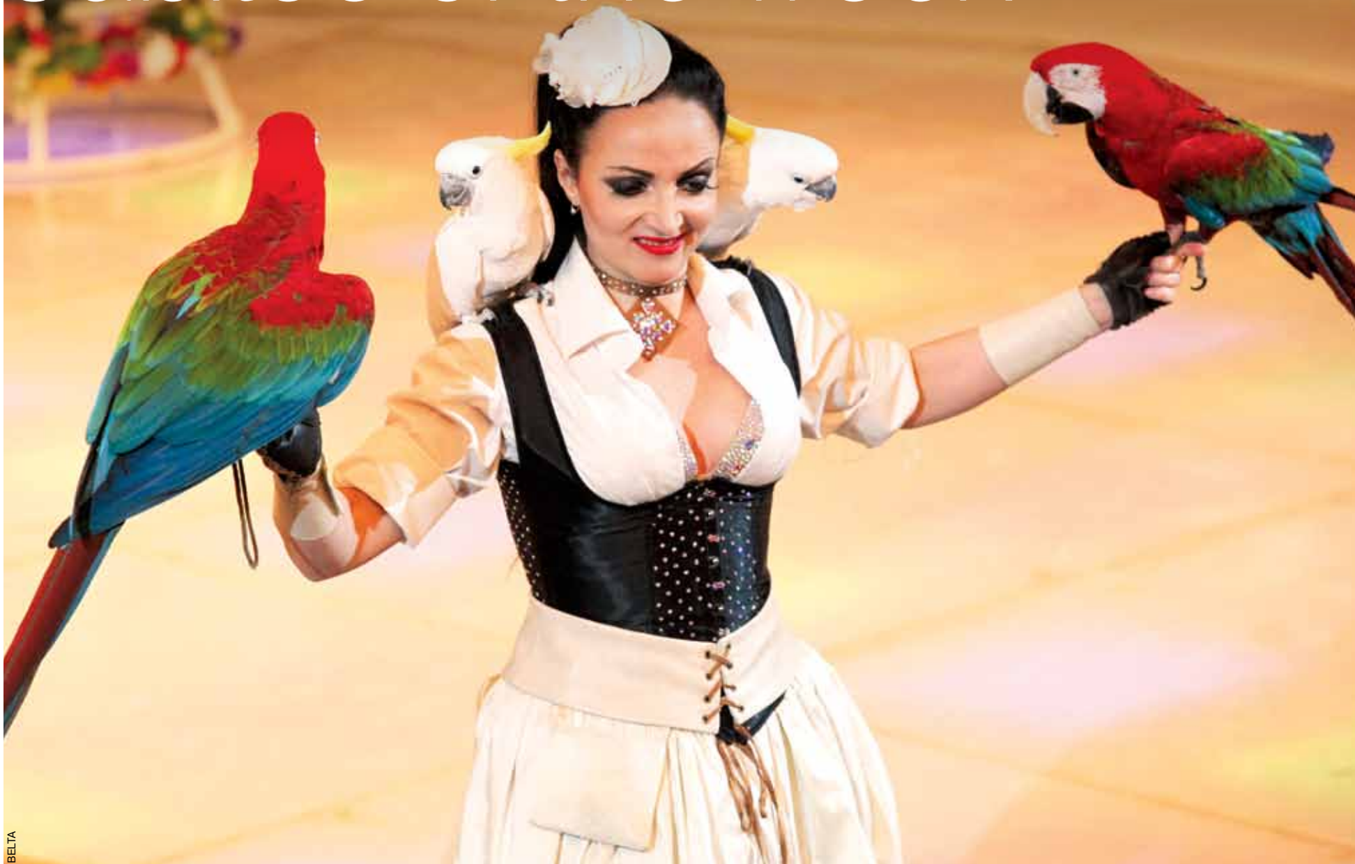
Gomel's State Circus celebrates its 45th anniversary with festive performance, Circus Revue and the Show of Bears