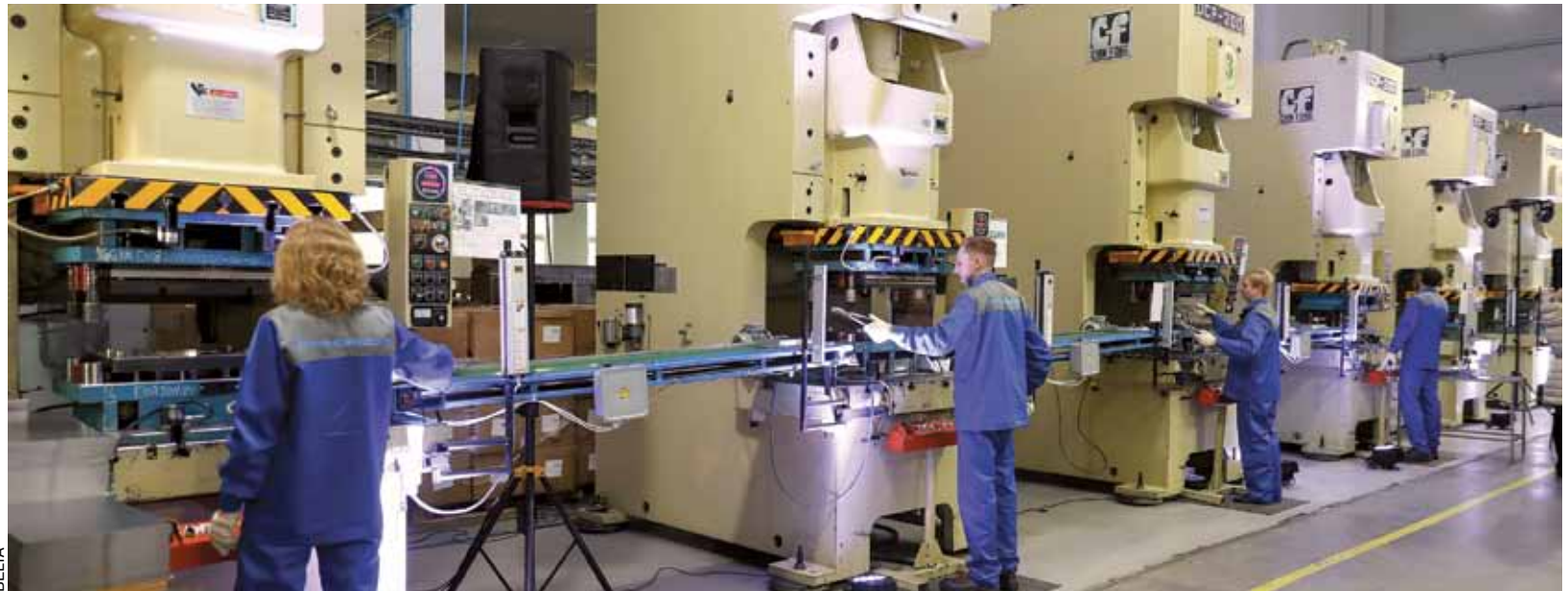
Microwave oven production line at joint Chinese-Belarusian enterprise Midea Horizont