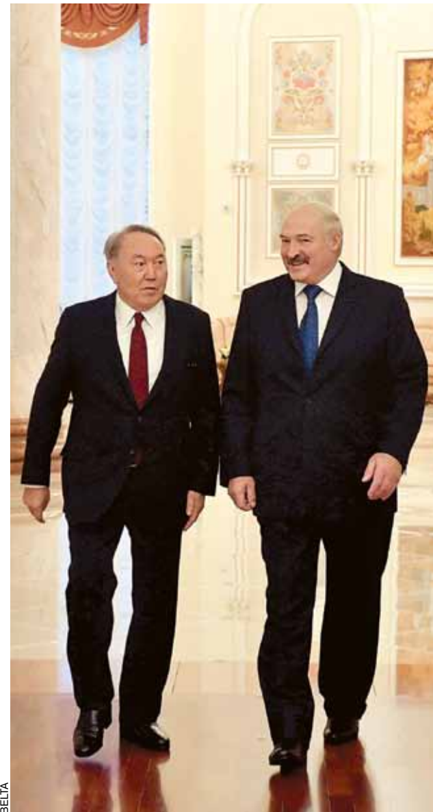
Nursultan Nazarbayev and Alexander Lukashenko

The President of Belarus believes that the most important result of talks