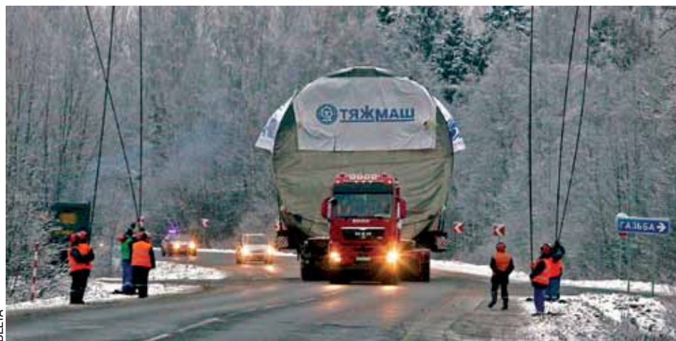
Everything was done to ensure that important transport can pass by

It was 9 metres in the height and width, weighing as much as a heavy loaded BelAZ truck: over 220 tonnes. To avoid trouble, all other vehicles were prohibited from using the road until the convoy had passed. Moreover, power lines were disconnected and lifted out