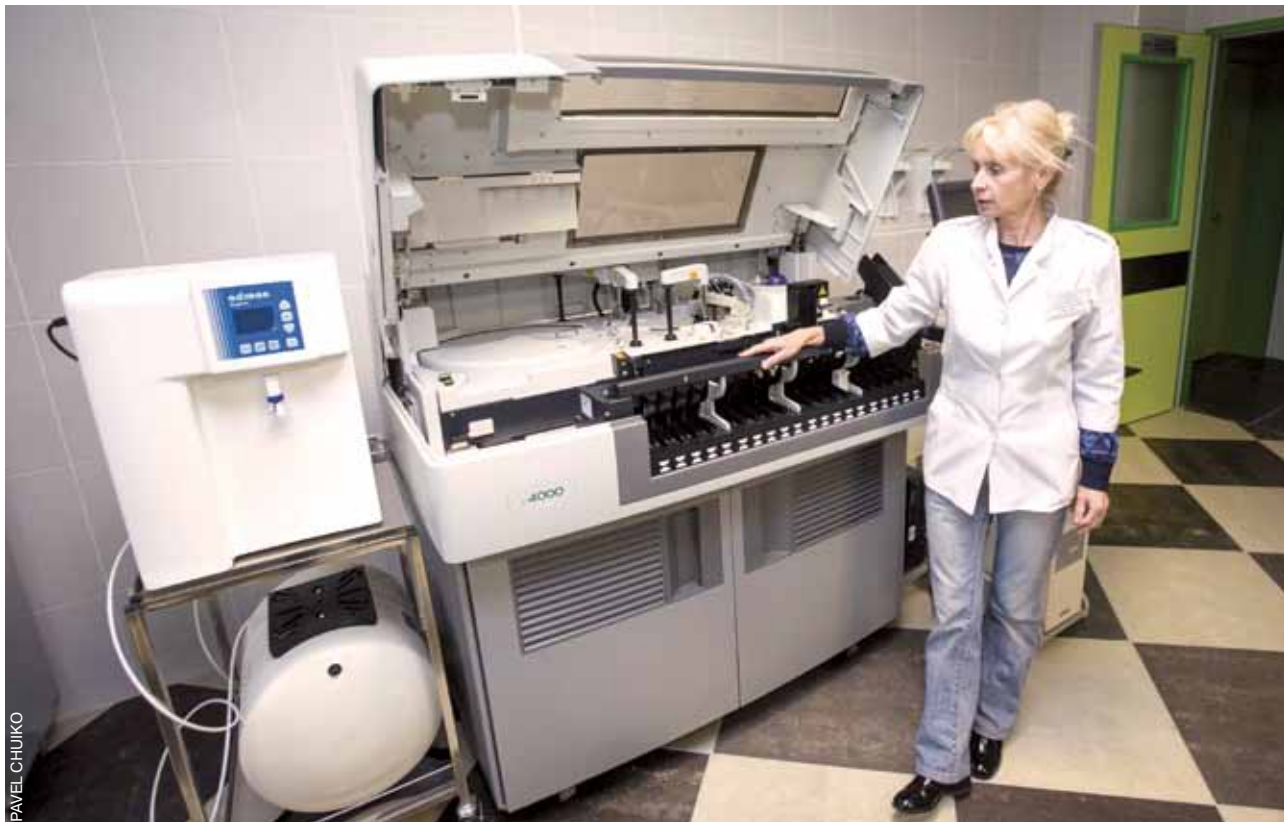
New City Transfusiology Centre equipped with modern equipment