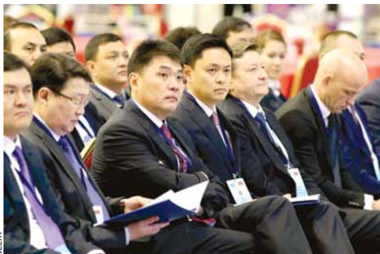
During the work of the forum

Our two counties have been interacting fruitfully in the industrial sphere, with quarry and mining machinery assembled in Karaganda. Belarusian tractors, grain