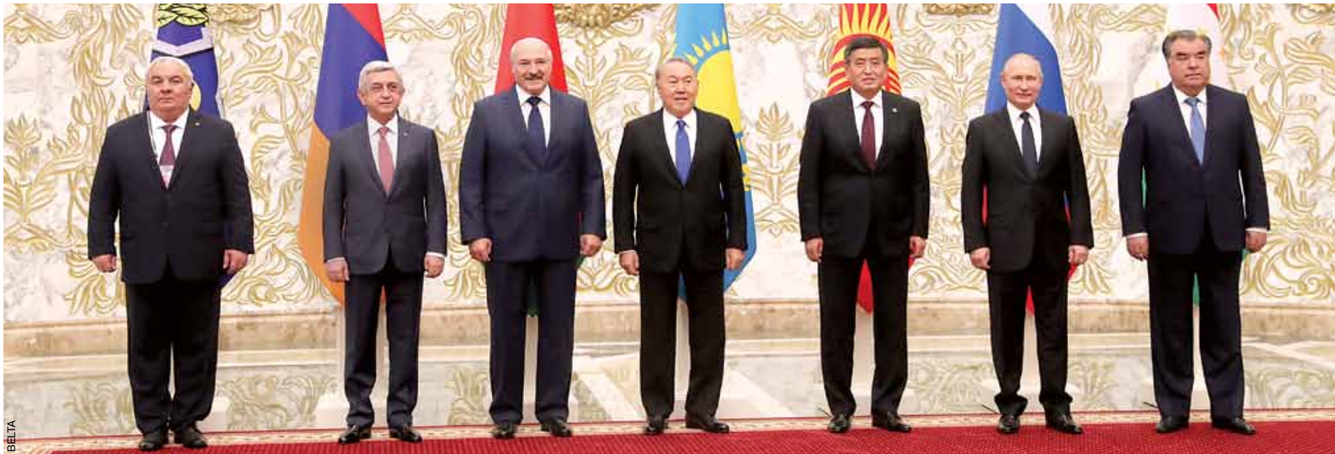
Heads of State take part in the CSTO Collective Security Council session