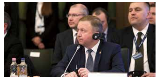
Andrei Kobyakov at summit in Budapest