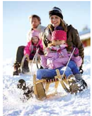
Exercise essential to health

Some products should be consumed in moderation only, due to their high fat content and lack of fibre: white rice and pasta; dairy products made from semi-skimmed milk; meaty soups; fish fried in non-healthy oils; non-recommended vegetable fats; and fatty meats, such as goose and duck, as well as sausages, salami and pates. The skin of all birds should be avoided where possible, since it's fatty, and you should eat no more than two egg yolks per week. Biscuit made from unsaturated margarines and fats should also be consumed only in moderation, alongside such confectionery products as marzipan and halva. Even Brazil nuts, cashews, peanuts and pistachios should be eaten in moderation. Of course, all alcoholic drinks require moderation.