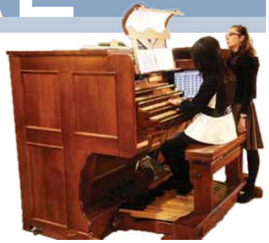
Performances by foreign organists at Musical College