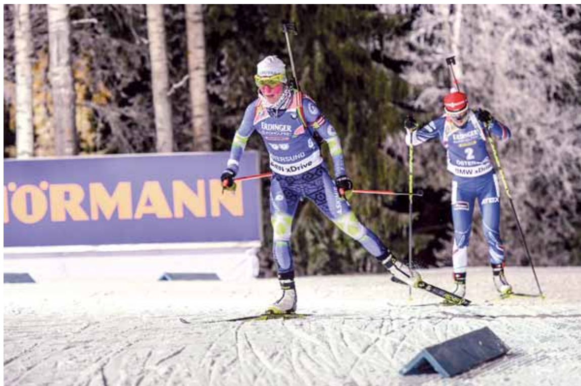
Nadezhda Skardino skiing laps

Nadezhda’s individual race at the last Olympics clearly won’t be