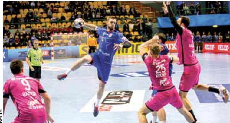
A moment of the match

In the second half, Brest Meshkov HC truly came into its own, repeatedly attacking its opponent’s goal, winning 29:24 by the final