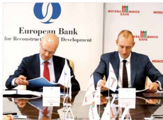
During the signing of the document

The Head of the EBRD Office in Belarus also said that the Bank plans several interesting projects in the municipal sector. "We're now discussing interesting projects dealing with Minsk. There's a significant project with Minskvodokanal that we'd like to realise jointly with the European Investment Bank. Moreover, within approximately six months we plan to finish preparation of the project dealing with the energy efficiency of