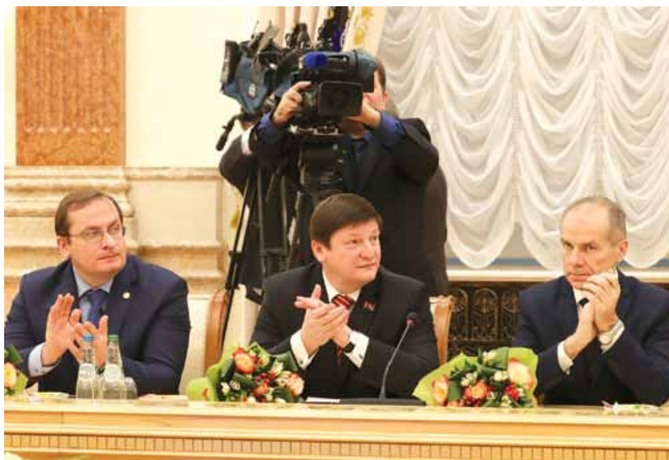
At the diploma awards ceremony

The President emphasised that the state has done a great deal for the development of Belarusian science.