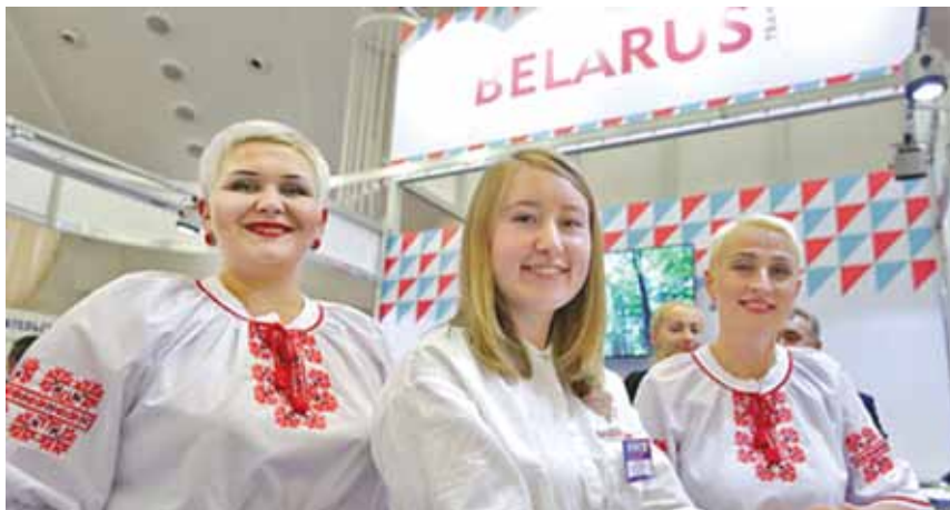
Near the Belarusian stand at the exhibition in New York

The sincere, though unfamiliar, greeting, ‘Welcome to Belarus’ was heard for three days in the centre of US business — New York, with our country presenting its tourist potential at one of the world's most prestigious exhibitions, The New York Times Travel Show-2018