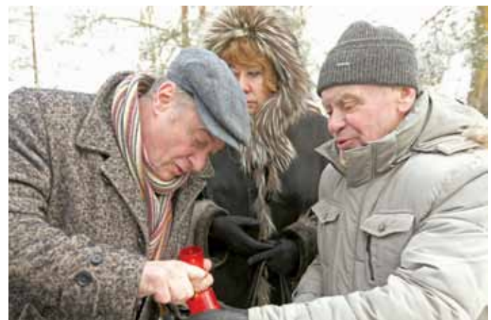
On Holocaust Remembrance Day in the village of Porechie in Pukhovichi District

Attending the event was also OSCE Chairperson-in-Office, Italian Foreign Minister, Angeli-