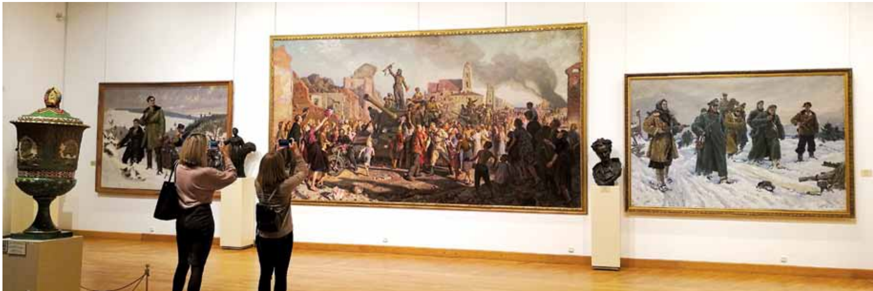
National Art Museum's permanent exhibition boasts many works dedicated to the Great Patriotic War