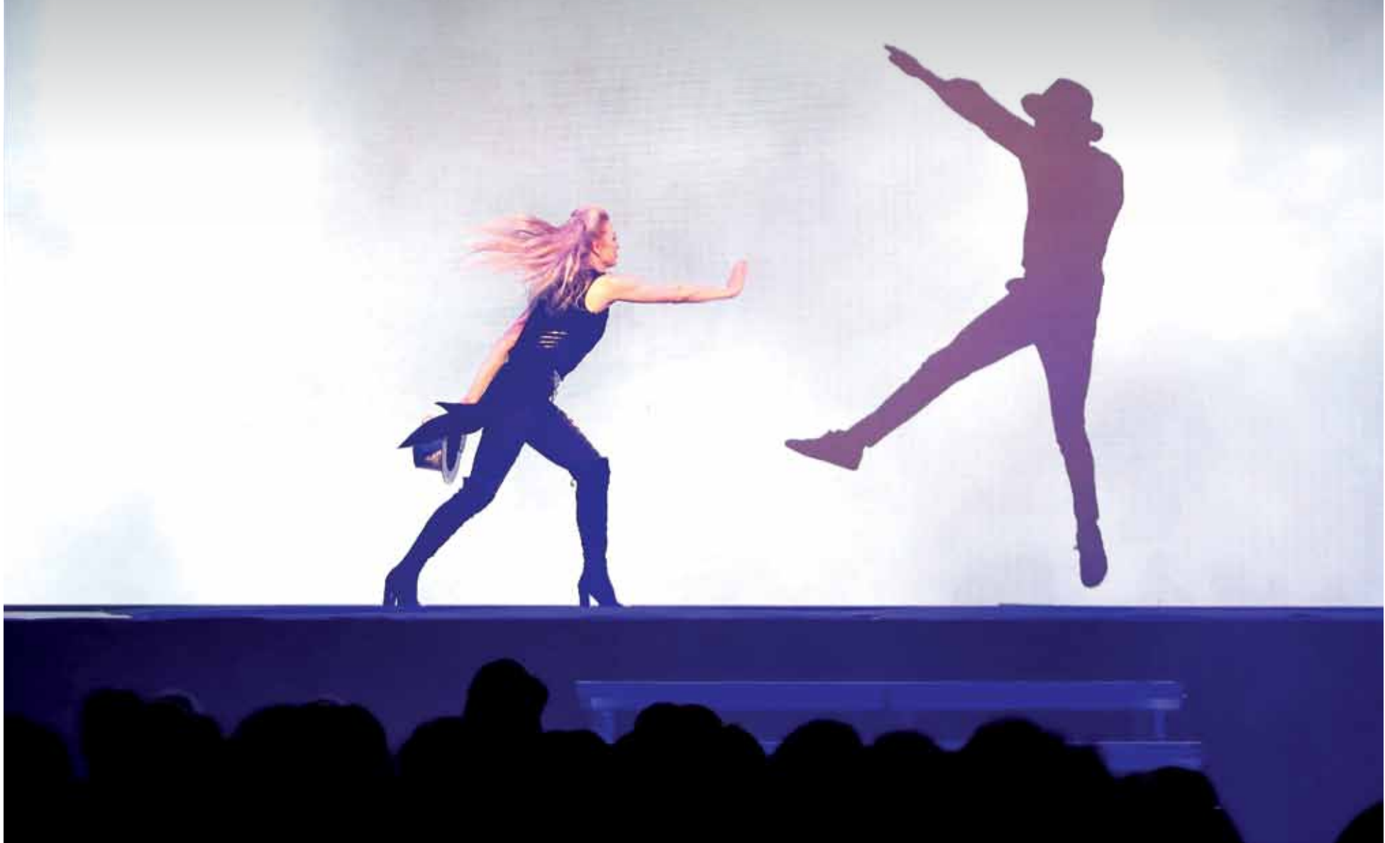
Illusionists, which has already toured 200 cities across 25 countries, hosted by Minsk