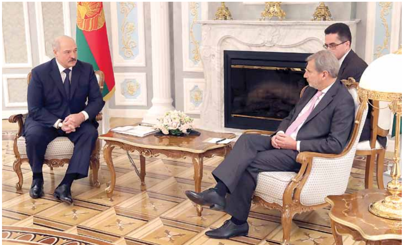
Alexander Lukashenko and Johannes Hahn during their meeting

The significant increase in collaboration between Belarus and the EU was also emphasised by Johannes Hahn on the eve of his visit to Minsk. "Co-operation in the spheres which are of common interest was begun. The EU increased measures aimed at developing the regions and the