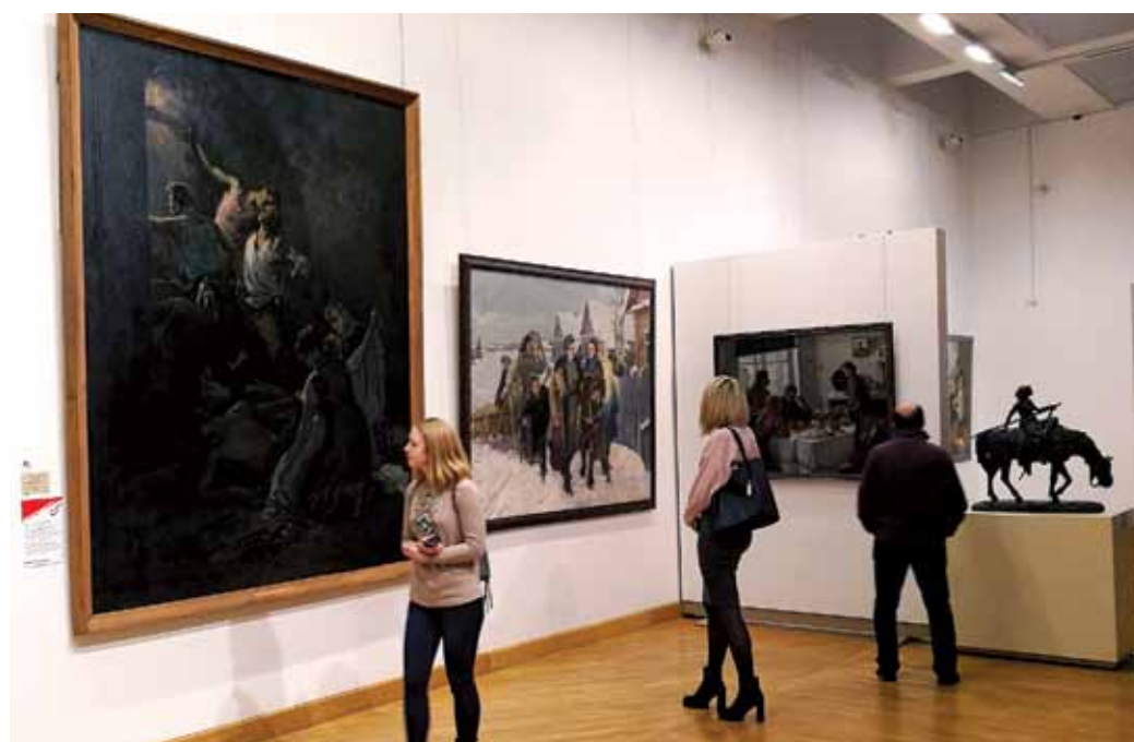
Works which reflect the military theme

The National Art Museum's current virtual exhibition showcases painting and sculpture from the museum's collection — all devoted to the first months of the Great Patriotic War. The earliest of them were created in the war years and the latest were from the mid-1980s. Some of the works reflect the heroic resistance to the occupiers and the heroism of the soldiers who defended the Motherland, while others depict the first victims of the war, as well as the destruction and forced resettlement. Some pieces are devoted to particular days: i.e. Nikolay Gastello's pieces on the defence of Brest Fortress and the formation of the people's militia. The exhibition provides an opportunity to get to know diverse ways of interpreting the war theme in art and demonstrates how the pictorial language transformed from illustration during the war and in the immediate post-war years, to the more complicated and philosophical compositions of the 1960-80s. The realism of Ivan Akhremchik coexists with the symbolic conditionality of Israel Basov, the expressiveness of Andrey Bembel contrasts with the externally restrained drama of Leonid Shchemelev, while heroic pathos depicted by Vitaly