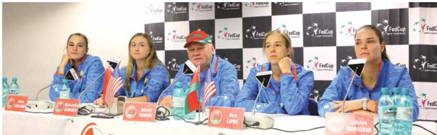
Belarus' national women's tennis team during the press conference