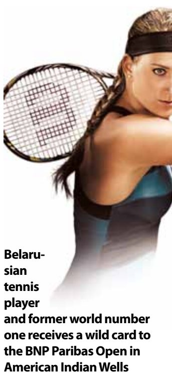
Belarusian tennis player and former world number one receives a wild card to the BNP Paribas Open in American Indian Wells

After receiving the special invitation, Victoria posted a video message on social networks to thank the organisers of the Indian Wells competition. She noted that this is one of her favourite tournaments; it has an amazing audience and boasts excellent organisation. Victoria said that she really wants to play there again and intends to take part in March. The tournament in Indian Wells will be held from March 7th-18th. In 2012 and 2016, Azarenko won it. As previously reported, the tennis player was also invited to the competition in Doha — to be held in mid-February.