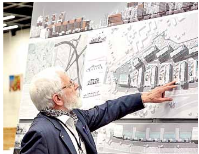
Concept housing developments in Minsk and St. Petersburg

In Minsk, the Petersburg quarter will be built on the site of the village of Petrovshchina; it joined the city area in 1978. Until recently, private houses were situated there but they are now being demolished and the residents resettled. The site is around 10-15 minutes from the city centre by car. A hospital and a large green zone are nearby; the latter soon to be landscaped. The site of the former Horizont factory is situated on the opposite side of the road; in Soviet times, TVs and