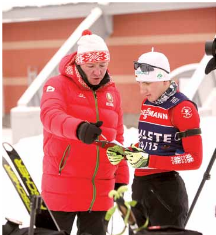
Training on the firing range