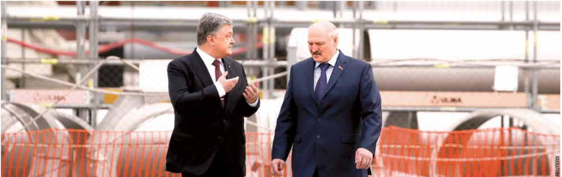
Alexander Lukashenko and Petro Poroshenko during visit to Chernobyl nuclear power station

Presidents of Belarus and Ukraine take part in events dedicated to another anniversary of the accident at Chernobyl nuclear power station