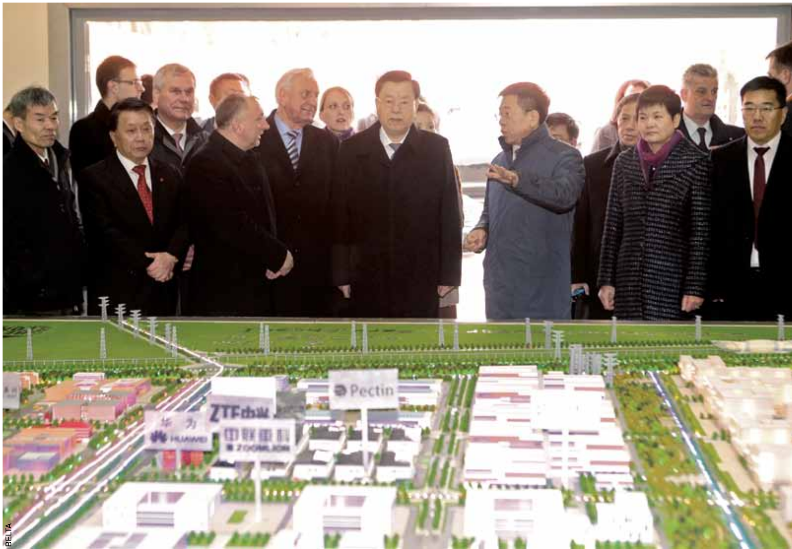
Zhang Dejiang (C) visits the Great Stone Chinese-Belarusian Industrial Park