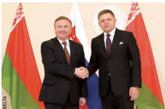
Andrei Kobyakov and Robert Fico

Belarus' Prime Minister Andrei Kobyakov has arrived in Slovakia on an official visit. The schedule of the trip is very intense, with the Head of the Government speaking to his counterpart, Robert Fico, taking part in the Belarusian-Slovak Business Forum and signing a range of important bilateral documents.