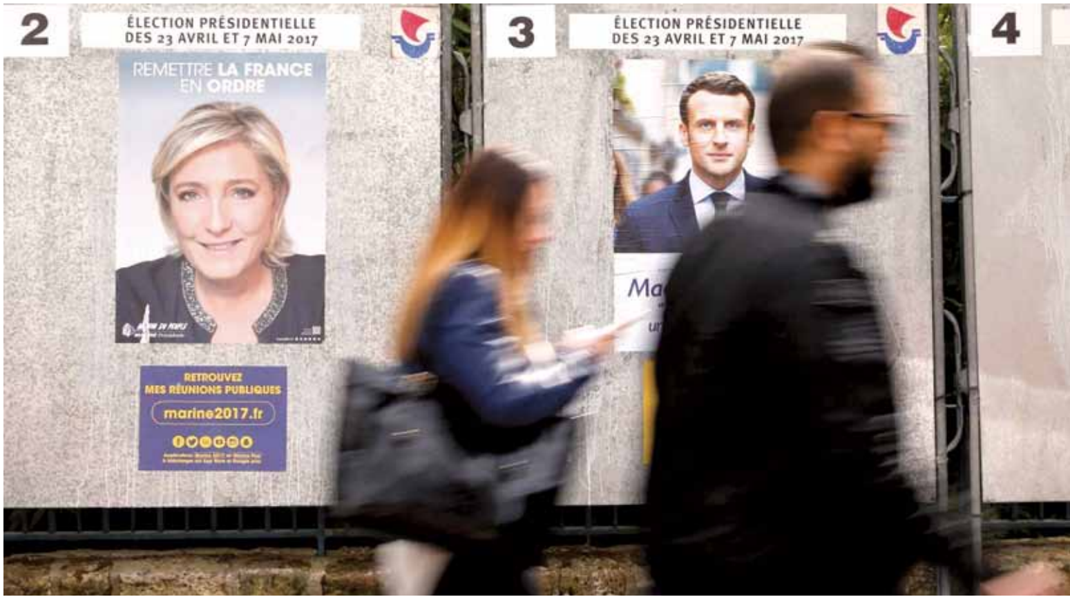
Posters with pre-election canvassing in the streets of Paris