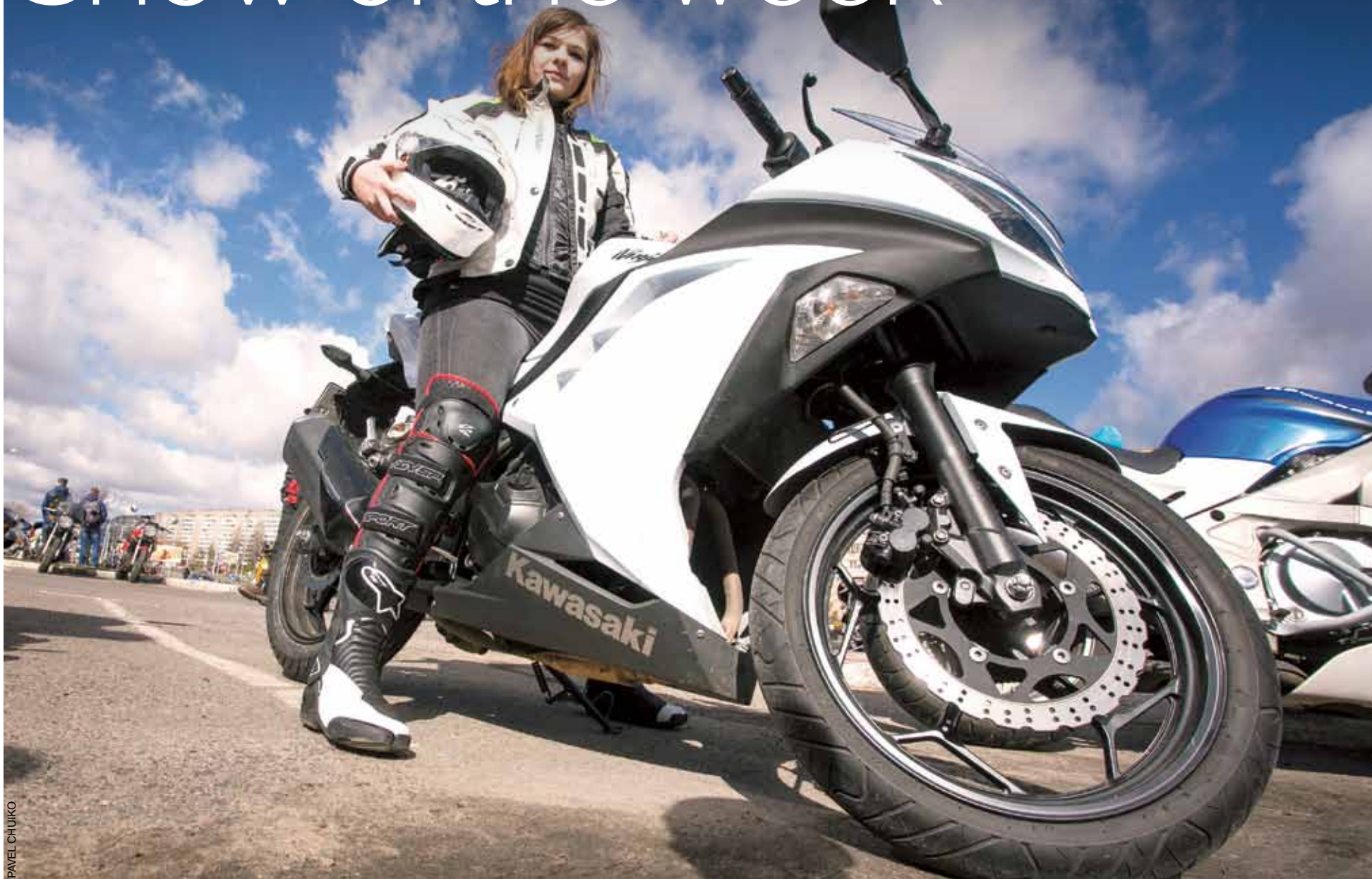
At city holiday — opening of 2017 motorcycle season H.O.G. Spring Challenge — in Minsk