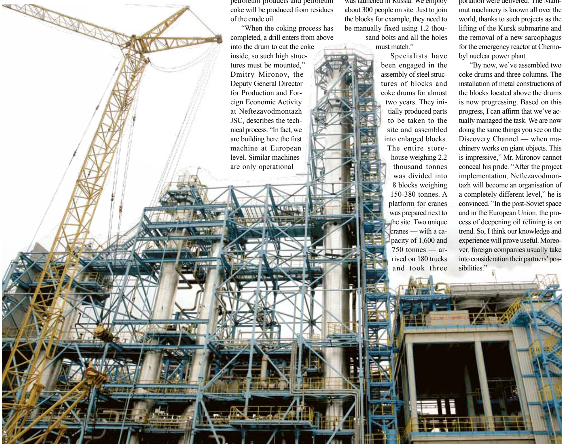
Naftan undergoing modernisation