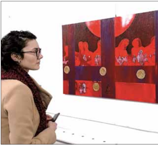
Diversity of exhibition project

since the birth of one of the pioneers of modern art — Marc Chagall. It's very symbolic that its title is 'The Return of the Image'. The event showcases various images: from those of material culture to mysterious and contradictory styles. However, they all illustrate the continuity of the traditions of avant-garde art and the creative journey. The exhibition reminds us that Belarus was the cradle of avant-garde culture in the early 20th century," said the Minister.