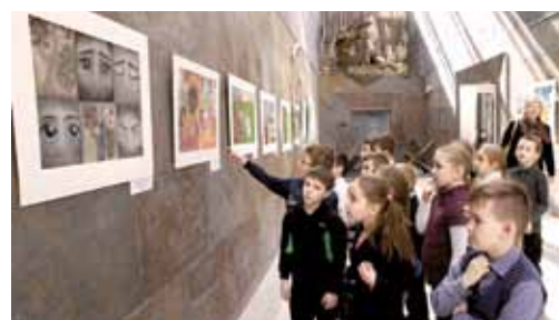
Exploring the exposition

None of the authors of the 27 pictures are more than 15 years old. It’s important to see how such young painters deal with this complex topic. The exhibition is not merely about the Great Patri-