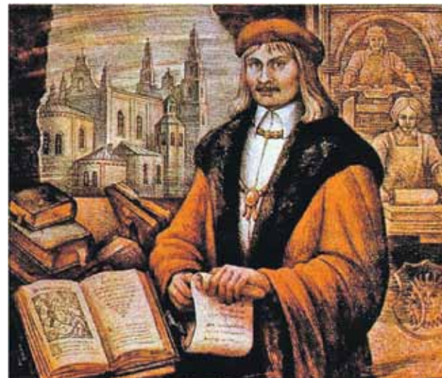
The philosopher-humanist's biography is shrouded in myth: historians don't even know the date of his birth or death