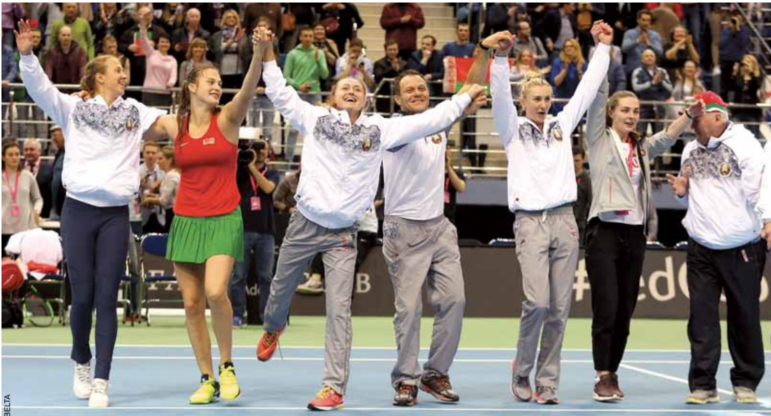
Tennis players and coaching staff thank fans for their support