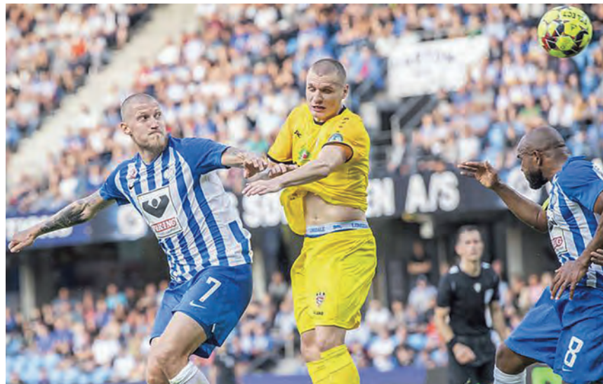
A scene from match between Esbjerg FC and Shakhtyor

Before the break, Esbjerg was mainly on the attack, but didn't pose a serious threat to goalkeeper, Andrey Klimovich. "Sometimes we had to soak up the pressure. In addition, the field was very dry