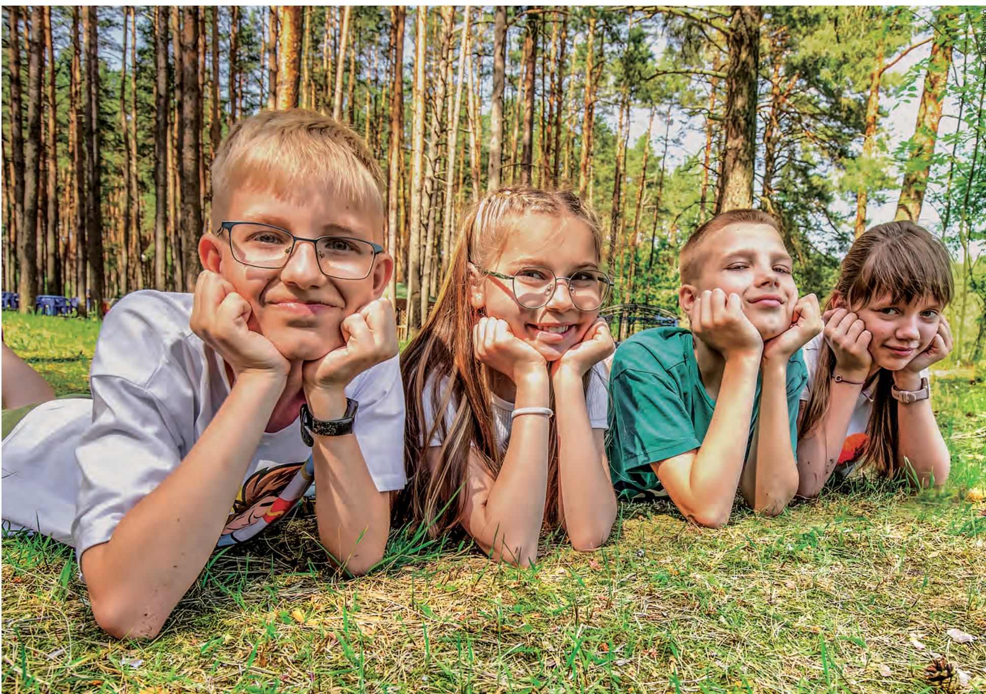
The start of the season was celebrated at the Minsk City Education and Recreation Centre Leader. About a thousand children will be able to enjoy the romance of the children's camp here during the summertime.

PUBLISHED SINCE FEBRUARY 2003 ● NO. 21 (1027) ● THURSDAY, JUNE 6, 2024 ● WWW.SB.BY