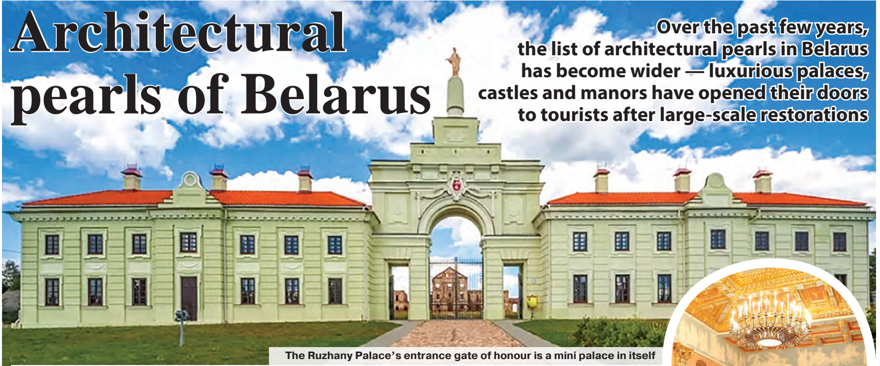
The Ruzhany Palace's entrance gate of honour is a mini palace in itself

Over the past few years, the list of architectural pearls in Belarus has become wider — luxurious palaces, castles and manors have opened their doors to tourists after large-scale restorations