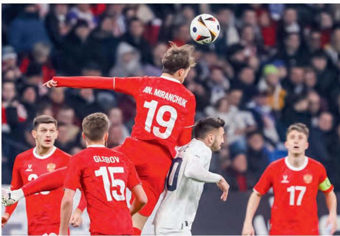
Anton Miranchuk, who has recently become the Europa League winner, and his partners in the Russian national team in March stood head and shoulders above the participant of the upcoming Euro 2024, the Serbia national football team — 4:0

The Belarusian national team features significantly fewer stars in contrast to the Russia's 'landing force' that mainly consists of guys from FC Ural Yekaterinburg, who will have to fight in order to retain their position in the Elite League, and guys from FC Khimki, who have just won a ticket to the Premier League, the top tier of professional football in Russia. In this regard, resisting the Russian 'shock battalion' will be anything but simple. All the more exciting it will be to see what Belarusian football players and their legionnaire coach are capable of in action. There will definitely be someone to admire at the Dinamo Minsk Stadium.