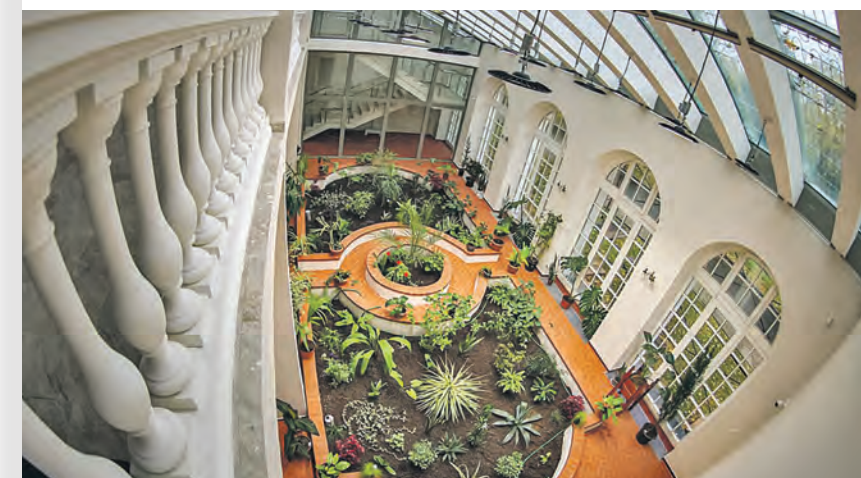
The Botanical Garden of Belarus' National Academy of Sciences was engaged in landscaping in the style of noble luxury

The Bulgakov estate has reached our days in excellent condition. Sophisticated bas-reliefs, frescoes, stucco mouldings decorate the interiors now as they did under the first owner. Attentive tourists traditionally try to solve the mystery of the 'all-seeing eye' on one of the gables of the side extensions. Is that the Masonic trail? Missed it! There was a home Roman Catholic church in this part of the building.