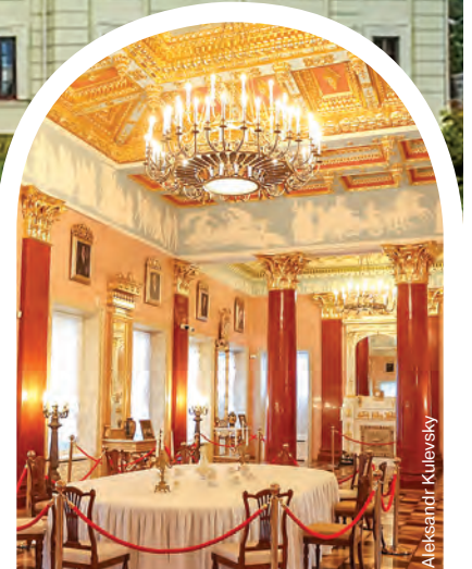
The Bulgakov Palace's interiors are decorated with sophisticated bas-reliefs, frescoes, stucco mouldings