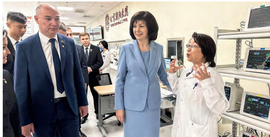
In the framework of the official visit, the Belarusian delegation visited Chaoyang Hospital in Beijing to get an insight into the advanced Chinese experience in the field of healthcare

About 6,000 kilometres separate Belarus and China, but even a huge distance does not prevent the countries from building high-level relations with each other. This is largely due to the far-sighted and wise policy of the leaders of both states, as well as the vigorous work at the level of parliaments, ministries and departments. Thus, an official Belarusian delegation headed by Chairperson of the Council of the Republic of the National Assembly of Belarus Natalya Kochanova paid a visit to the Chinese capital last week. The programme of the visit was eventful — after all, Belarus–China bilateral co-operation is developing in almost all areas. On the first day of the visit, the focus was made on the legislation and interaction of women's organisations. On the second day, Chairperson of the Council of the Republic Natalya Kochanova met with Vice President of the People's Republic of China Han Zheng and Chairman of the National People's Congress Standing Committee Zhao Leji. Special attention was paid to trade and economic partnership, parliamentary interaction and co-ordination of a unique Belarus–China: Partnership 2030 co-operation plan. The initiatives concerning many other areas of collaboration were also announced during the events.