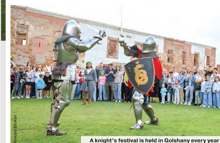
A knight's festival is held in Golshany every year