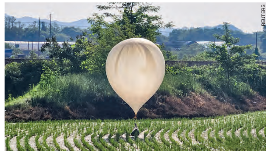
Materials prepared with aid of information agencies

South Korea's military condemned the act as a 'clear violation of international law'.