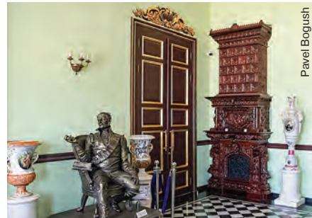
Each hall of the Kossovo Palace had its own purpose