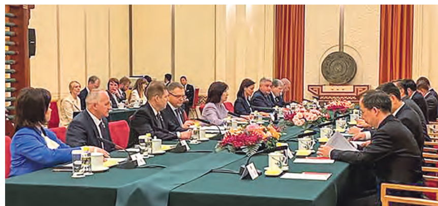
During the first meeting of the High-Level Committee on Co-operation between the Legislative Bodies of Belarus and China

The proposals of the Chinese side during the meeting of the Committee were voiced by Zhang Qingwei, Deputy Chairman of the Standing Committee of the National Peo-