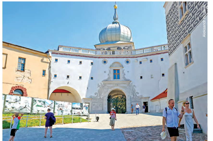
It is easy to feel like a medieval townsman inside the Old Castle

allowed, and the couple began to meet in secret. The guy showed up on dates dressed in monastic vestments so as not to be caught. However, this did not save him, as the girl's father ordered her lover to be walled up in a thick wall. Since then, the ghost of the Black Monk has been wandering around the castle. Nearby, a White Lady can be seen in the Franciscan Monastery — the ghost of the wife of one of the builders buried alive during construction.