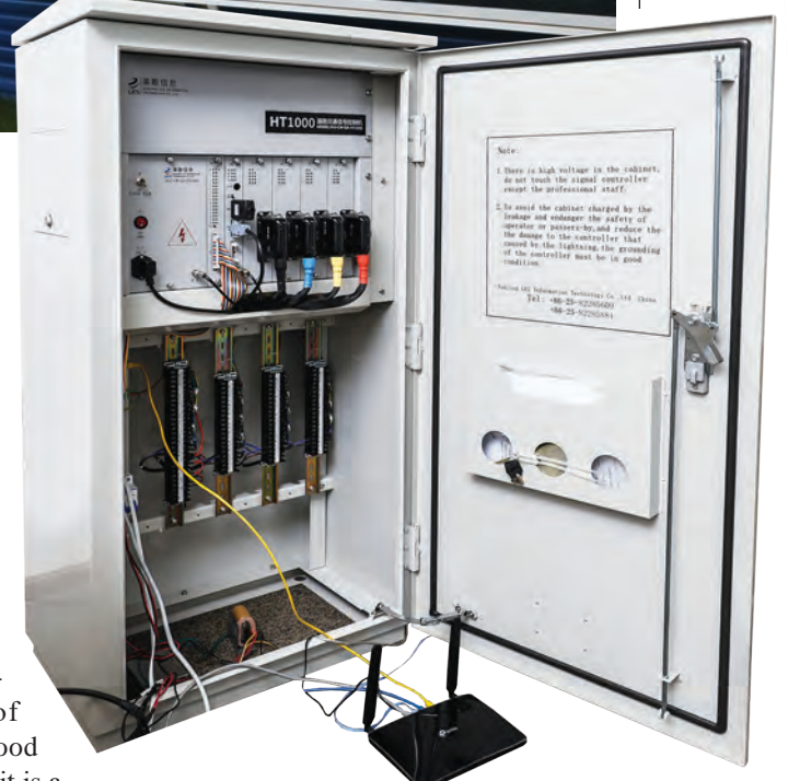
Smart city traffic management system consists of many elements

"Similar systems operate in China where there are traffic issues. Your situation is simpler. We plan to build an ex-