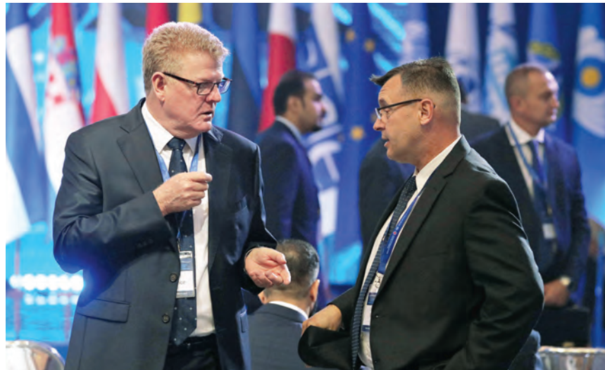
During the conference

The Head of State proposed, “Perhaps it’s time to take this model as an example for the formation of a new initiative: Digital Neighbourhood Belt . This can be done by concluding interstate and other agreements on information security. From our point of view, the key elements of such agreements could be the ideas of digital sovereignty and neutrality, which will first of all guarantee the non-interference of countries in each other’s information resources.”