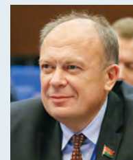
Valery Voronetsky, the Chairman of the Standing Committee on Foreign Affairs of the House of Representatives of the National Assembly of the Republic of Belarus:

The hosting of this conference testifies to the authority of our country and a positive assessment of its contribution to the fight against terrorism and strengthening security in the region. These are interrelated and I think it is quite logical that the forum is held in Minsk, taking into account the role of our country in modern international life — namely, in the fight against terrorism and other manifestations, such as drug trafficking, illegal migration and so on. The difficulty lies only in the fact that many use the fight against terrorism as an instrument of influence in a particular region. Therefore, this issue should be primarily discussed at the level of heads of state and, first of all, in the regions which are the centres of power and world politics.