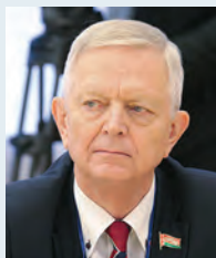
Sergey Rakhmanov, the Chairman of the Standing Committee on Foreign Affairs and National Security of the Council of the Republic of the National Assembly of the Republic of Belarus:

The theme of the fight against terrorism in the modern era is relevant for all, because international exchange is intensifying, and no one is guaranteed from penetration into our territory under different banners of radical elements. To avoid this, we need serious interaction with our part-