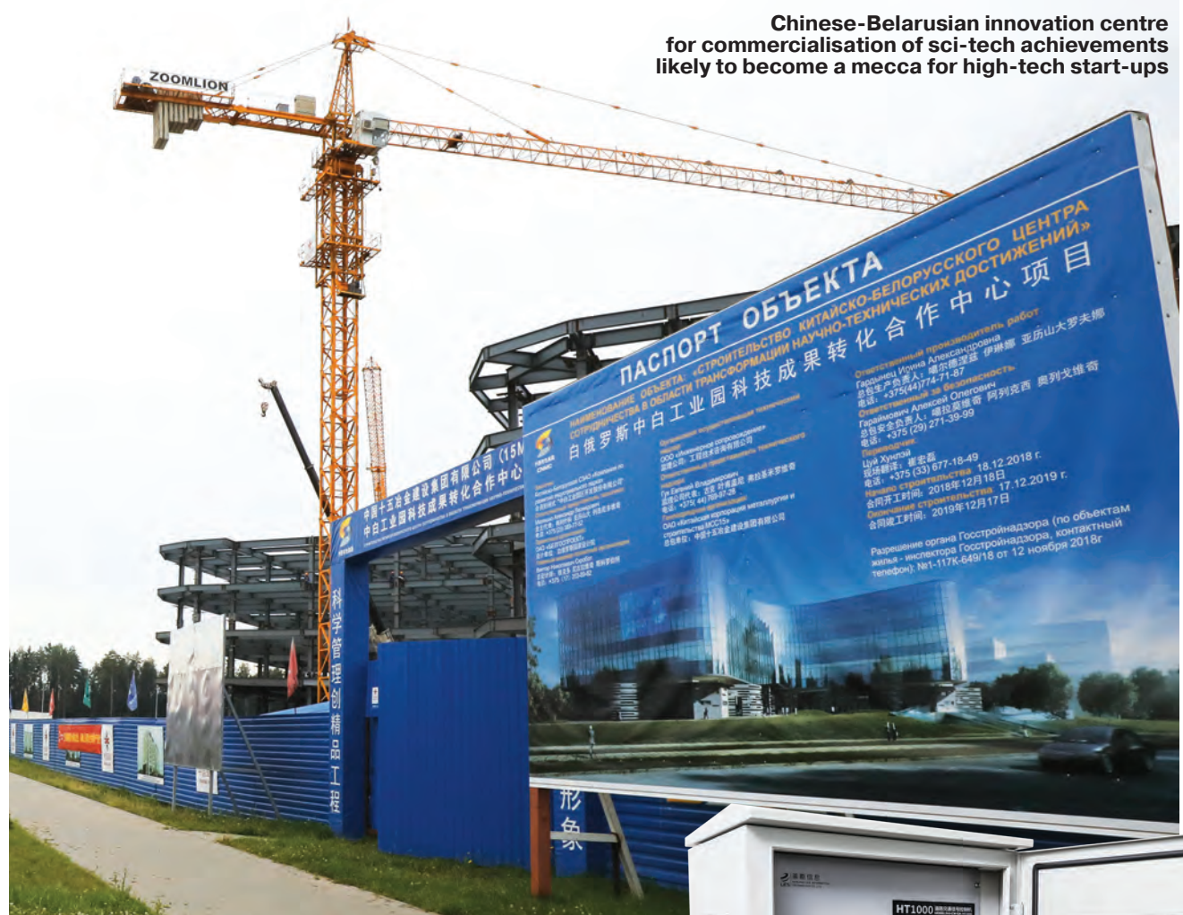
Chinese-Belarusian innovation centre for commercialisation of sci-tech achievements likely to become a mecca for high-tech start-ups

The start-up will not receive the money immediately. After selection, a team of developers will be offered an office where they will be allowed to work on the project, free of charge, for six months. After that, if the team presents a viable idea with the possibility of its commercialisation, it will receive financing. A $20m fund has been established in the Park to assist the Iskra programme.