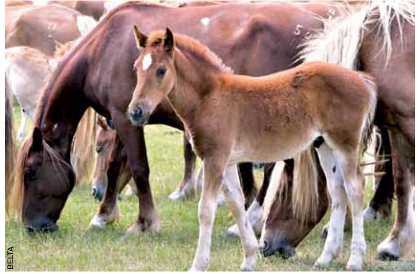
Pedigree horses raised on the reserve

days. He noted that the issue of a vacation in respect of the President of the country rests on the Constitution. “The Belarusian President cannot have a normal holiday. I have no vice-president and, according to the Constitution, I cannot pass my authority to anyone,” Mr. Lukashenko said. He then added that, even while visiting Sochi for several days, he maintains constant contact with the homeland and is in-