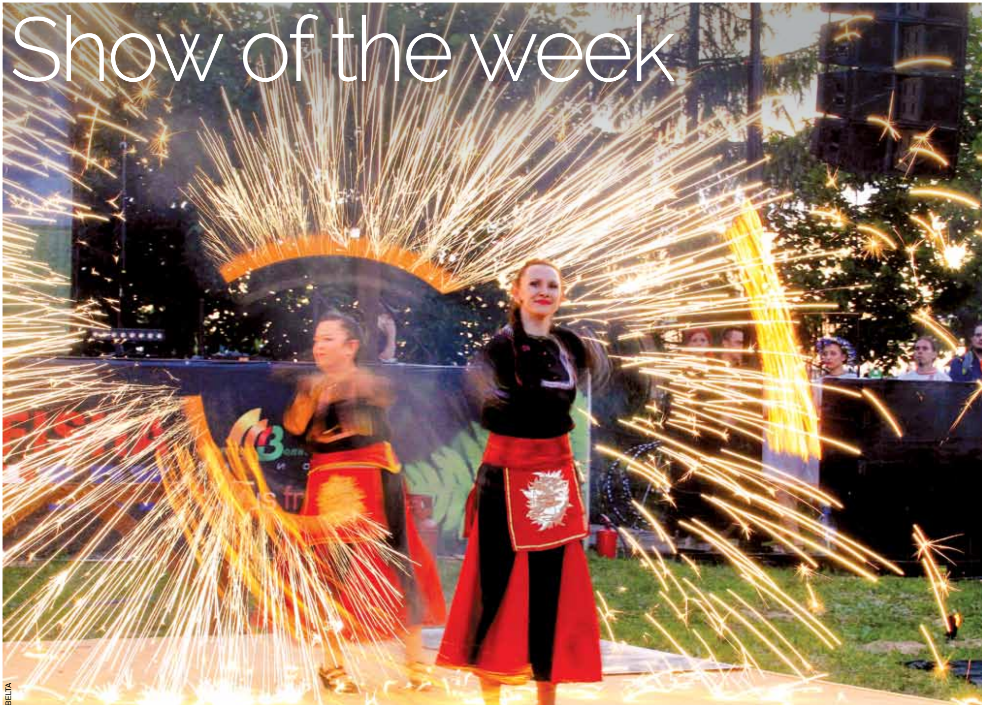
Two dozen teams demonstrate their mastery of fireworks at the Sviata Sontsa-2017 (Holy Day of the Sun) folk festival, held in the Dudutki museum complex