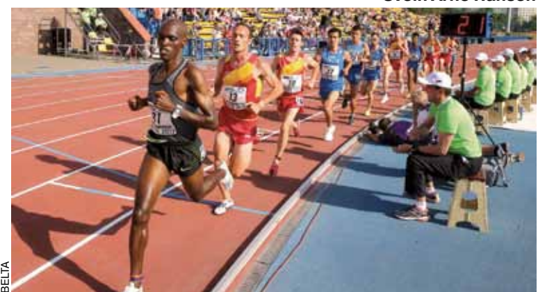
During the competitions

The President of the European Athletics Associations stressed that