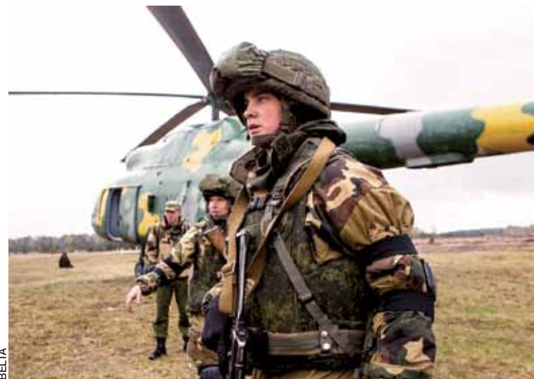
Rapid Reaction Forces

“Obviously, in these conditions our organisation becomes even more important. Being a multi-purpose organisation, the CSTO has a potential for playing a big role in the future architecture of security on the Eurasian continent,” said the Head of State. He deems it necessary to make timely strategic decisions based on unity and allied solidarity and prepare concerted collective responses to global and regional challenges. It was reported that Belarus presides in the CSTO since October 2016.