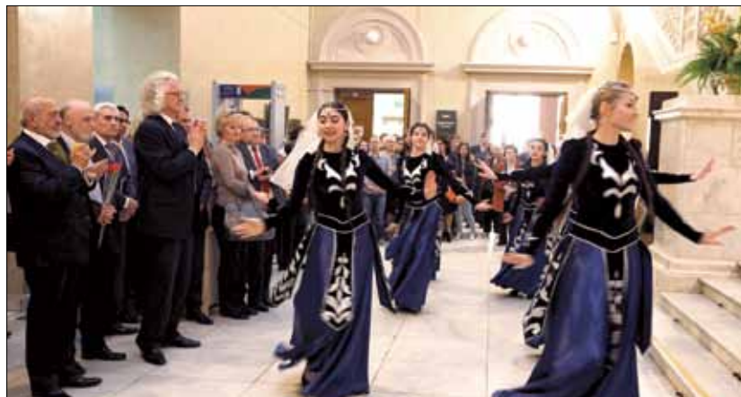
Exhibition opening ceremony