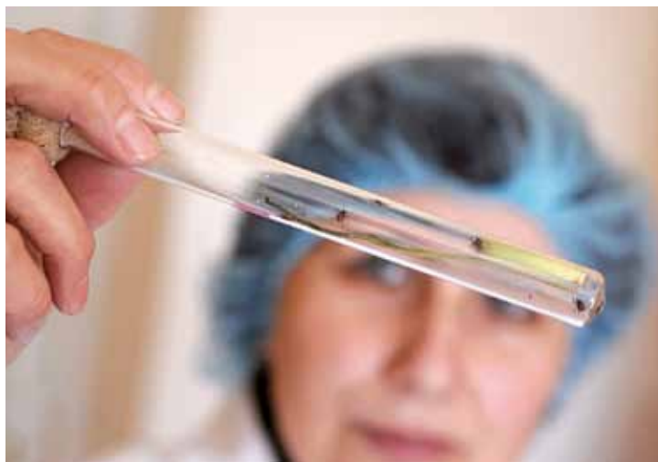
No joking with ticks

If the mite head (a black dot) is torn off during removal, wipe the wound with cotton or a band-