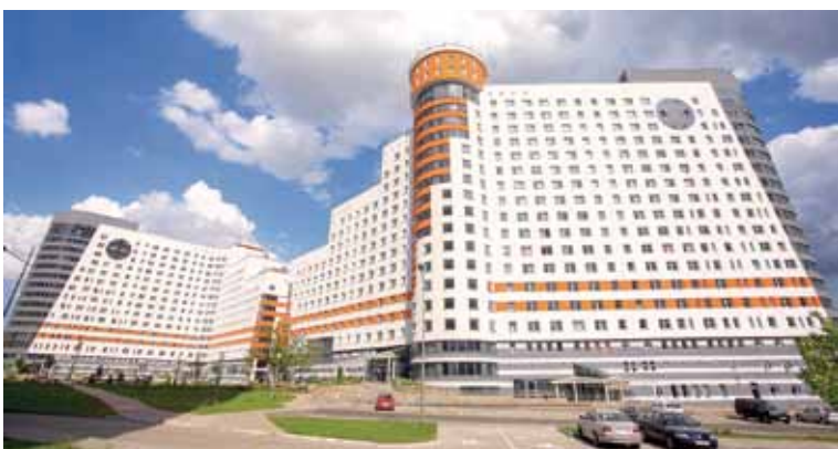
Participants of Games will live in Student Village