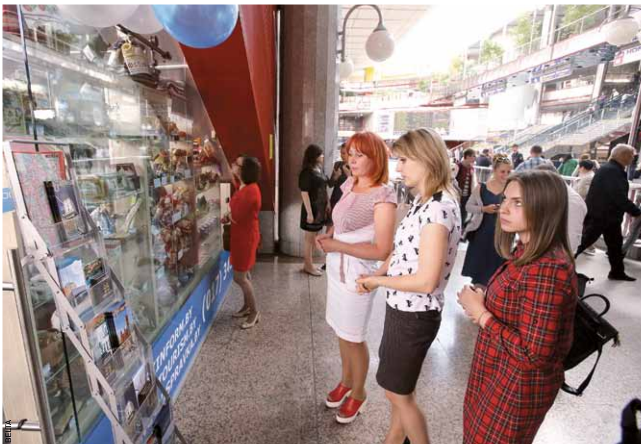
Tourists gain information on city and country at railway station kiosk

“There have been statements that they can do without the Minsk format and find other ways to resolve the Ukrainian conflict,” said the President. “Of course, they can. But it is always more difficult to start from the beginning than to continue with a good thing.”