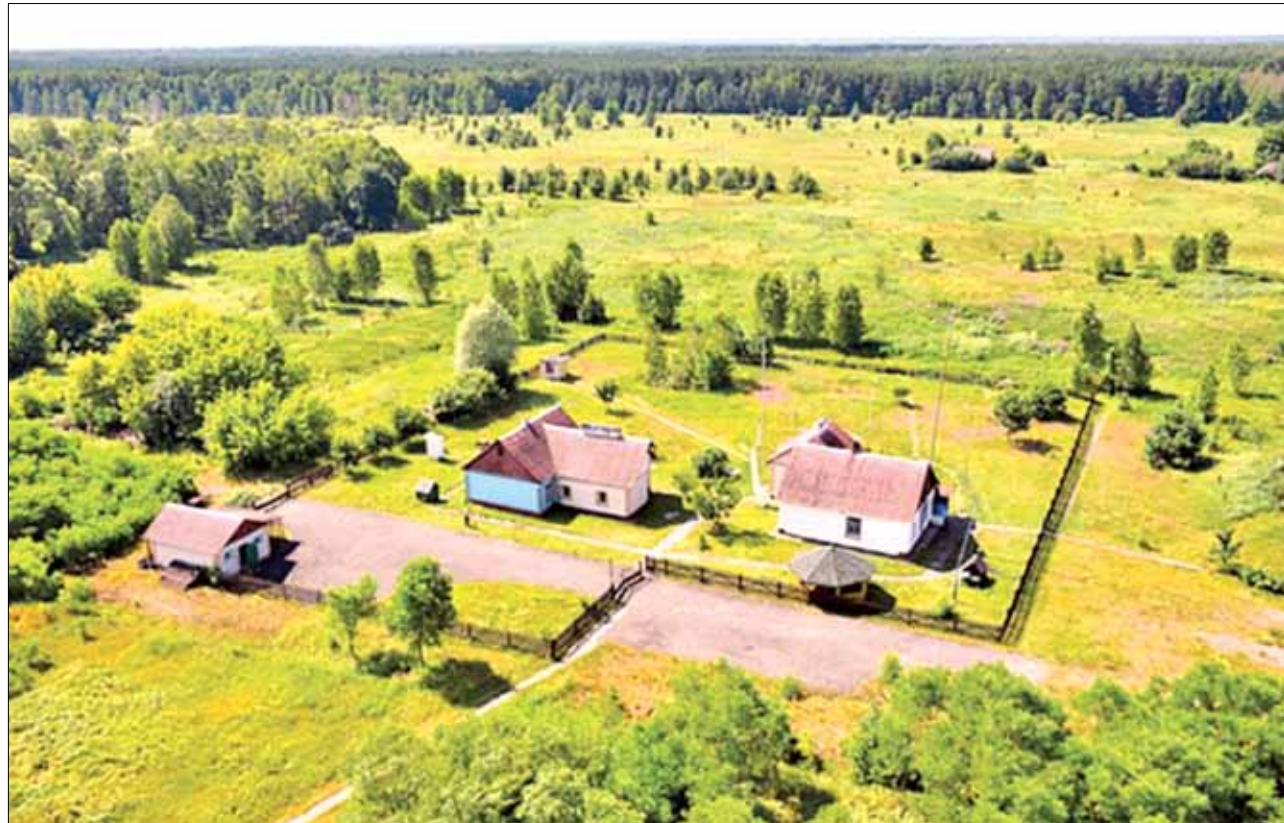
A bird’s eye view of the Polesie State Radiation-Ecological Reserve

While staying in the reserve, Mr. Lukashenko visited the uninhabited village of Babchin; after the tragedy, over 700 people were evacu-