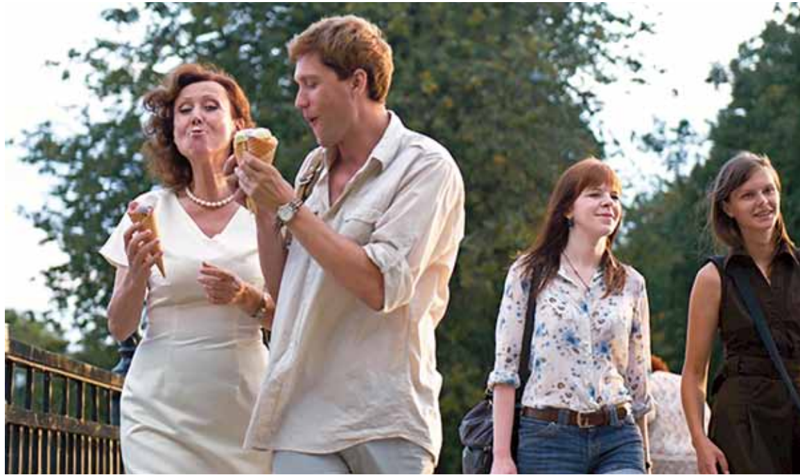
A Shot from the film Vera's Sweet Farewell

Do you know why 'Vera's Sweet Farewell' conquered American