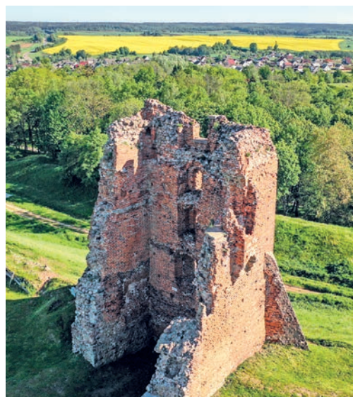
The ruins of the once majestic Novogrudok Castle attract guests even in their present condition

will concrete the slope, turning it into a rock, enabling the castle to stand for more than a century. Then the slope will be covered with a polymer net with grass seeds, which will further strengthen the surface of the hill with its roots. This technology has already been used to save the 12th century Kolozha Church and reconstruct the Old Castle in Grodno. More than $125,000 (equivalent) has already been allocated from the regional budget to carry out work to strengthen the slope of the Zamkovaya Hill in Novogrudok.