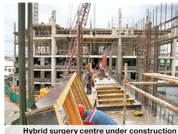
Hybrid surgery centre under construction

Belarus is constantly working to improve and introduce high-tech methods of treatment of cardiovascular diseases. With this in view, the centre's work will help significantly reduce the death rate of patients with severe pathologies.