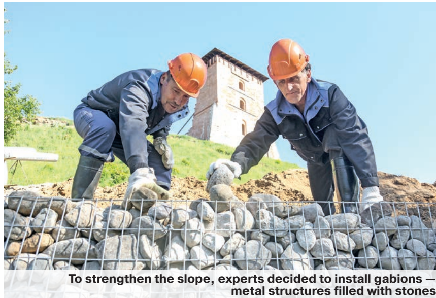
To strengthen the slope, experts decided to install gabions — metal structures filled with stones