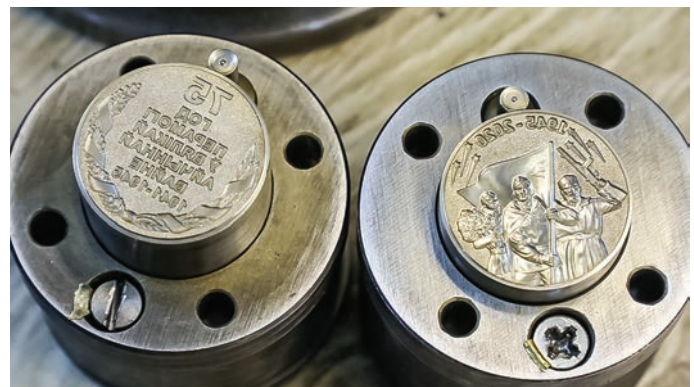
This is what the stamp for the medals looks like