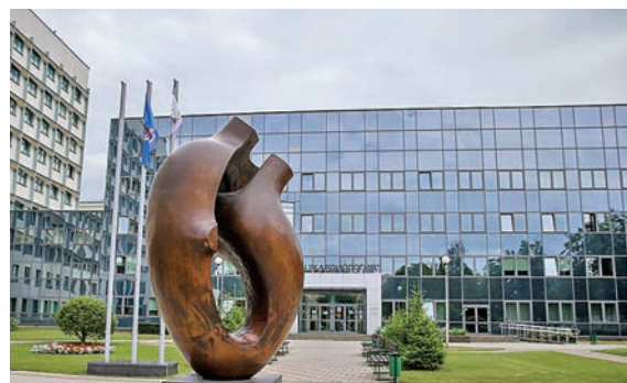
Cardiology Republican Scientific-Practical Centre

Mr. Khrenin also stressed, "We cannot but be bothered by the increasing military activity near our state borders in recent years. We're also worried that with every year, the possibilities of modern technology are increasing. Therefore, a decision was made in favour of acquiring modern Su-30SM aircraft and putting them on combat duty. As Minister of Defence, I have not the slightest doubt that those pilots who stand around the clock on alert, who hold the 'keys to heaven' in their hands, will ensure peace and stability on our land."