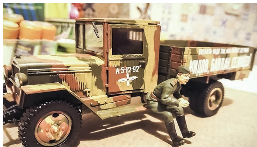
The Soviet ZIS-5V was the first to replenish Ivan Trus' home collection of miniature models