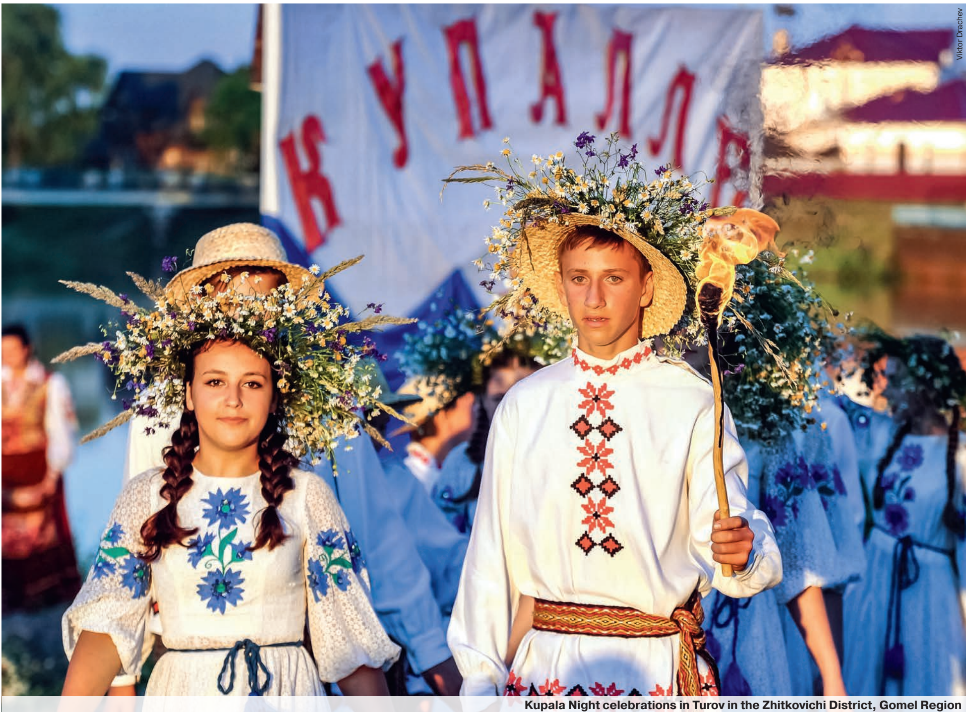
Kupala Night celebrations in Turov in the Zhitkovichi District, Gomel Region

PUBLISHED SINCE FEBRUARY 2003 ● NO. 26 (840) ● THURSDAY, JULY 16, 2020 ● WWW.SB.BY