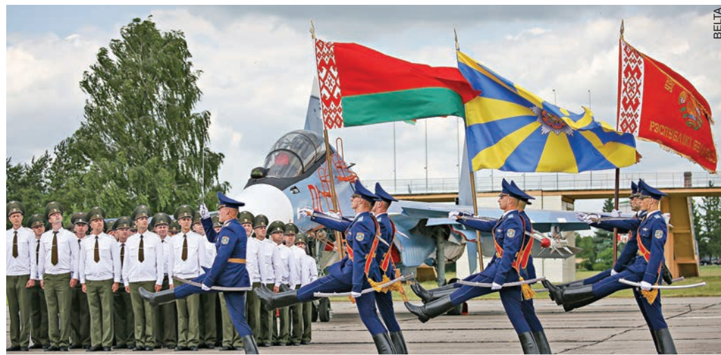
Officially taking up combat duty on Su-30SM fighters by the pilots of the 61st fighter air base

Before that, the Minister of Defence, Viktor Khrenin, addressing the military, noted, "The young generation of pilots, who quickly mastered this complex type of aviation equipment, took up combat duty. This indicates the effectiveness