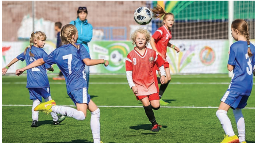
During the young football players' 'Leather Ball' tournament for prizes of the President's Sport Club, in 2019