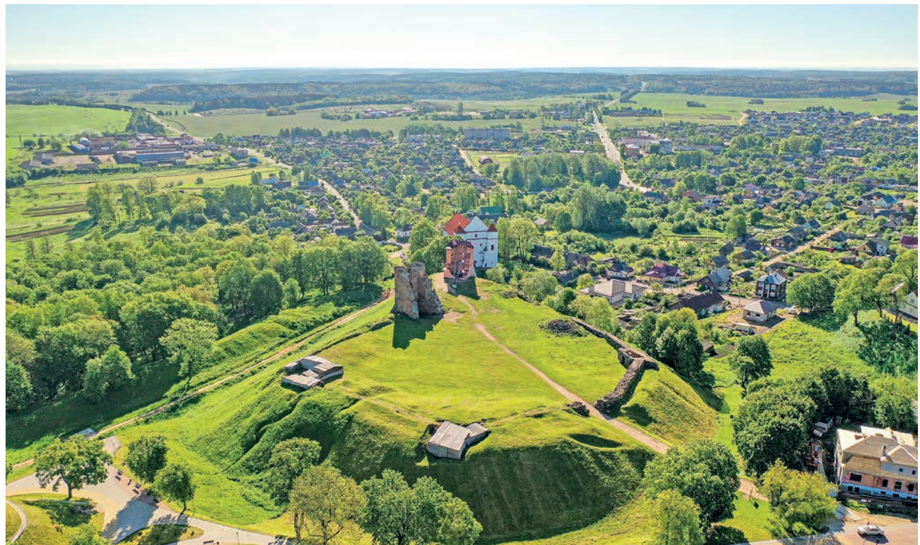
Serious works to restore the castle began in 2012, when Novogrudok and Lyubcha castles were included in the Castles of Belarus state programme

At the same time, workers are adding roads for vehicles to drive up to the site. After all, the installation of gabions is only the first step in strengthening the slope. The main thing is a complex system of bored piles and anchors. They